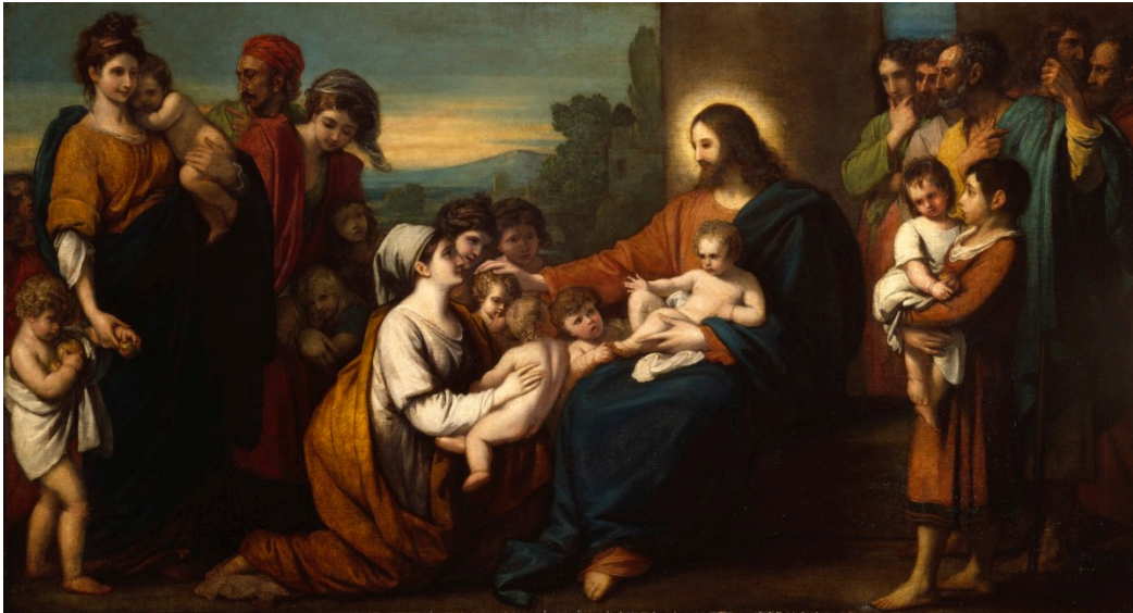
Christ blessing Little Children, Benjamin West PRA, 1781 Painting is located at The Royal Academy of Arts, London

The meek and humble souls and the souls of children