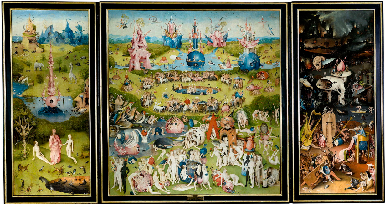
The Garden of Earthly Delights, Hieronymus Bosch, 1490-1510 Painting located in Museo del Prado, Madrid

"Today bring to Me all mankind, especially all sinners, and immerse them in the ocean of My mercy. In this way you will console Me in the bitter grief into which the loss of souls plunges Me."