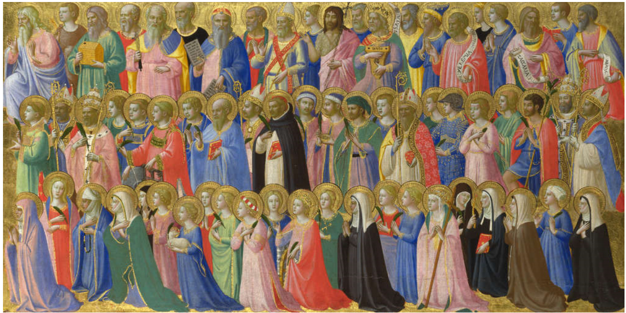
The Forerunners of Christ with Saints and Martyrs, Fra Angelico, 1420s Painting located in The National Gallery, London

"Today bring to Me all Devout and Faithful Souls, and immerse them in the ocean of My mercy. These souls brought me consolation on the Way of the Cross. They were a drop of consolation in the midst of an ocean of bitterness."