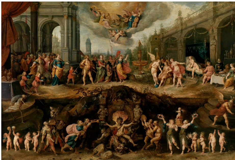
Mankind's Eternal Dilemma – The Choice Between Virtue and Vice, Frans Francken the Younger, 1633 Painting located at The Museum of Fine Arts in Boston, Massachusetts

"Today bring to Me the Souls who are in the prison of Purgatory, and immerse them in the abyss of My mercy. Let the torrents of My Blood cool down their scorching flames. All these souls are greatly loved by Me. They are making retribution to My justice. It is in your power to bring them relief. Draw all the indulgences from the treasury of My Church and offer them on their behalf. Oh, if you only knew the torments they suffer, you would continually offer for them the alms of the spirit and pay off their debt to My justice."