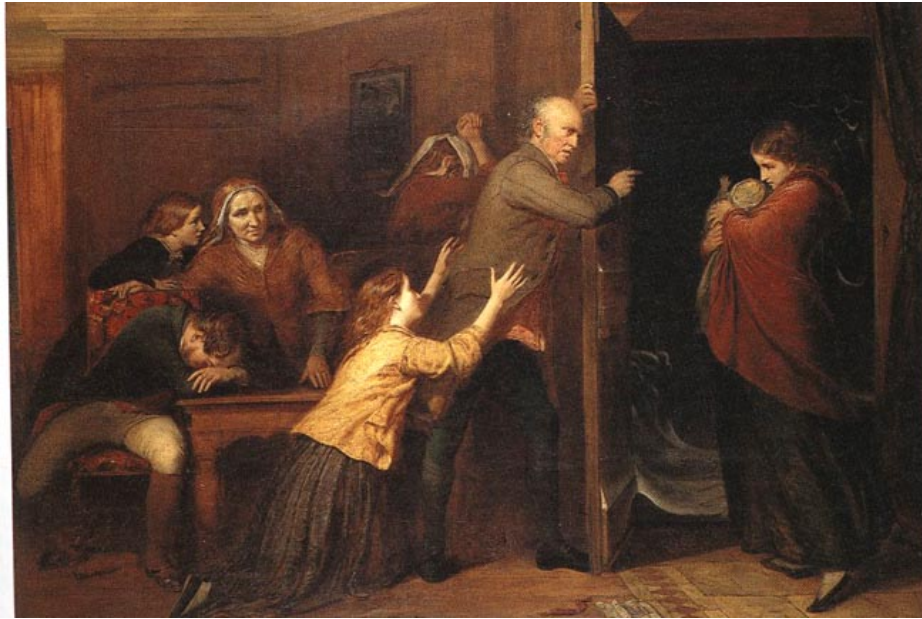
The Outcast, Richard Redgrave, 1851 Painting is located at The Royal Academy of Arts, London

"Today bring to Me the Souls of those who have separated themselves from My Church and immerse them in the ocean of My mercy. During My bitter Passion they tore at My Body and Heart, that is, My Church. As they return to unity with the Church My wounds heal and in this way they alleviate My Passion."