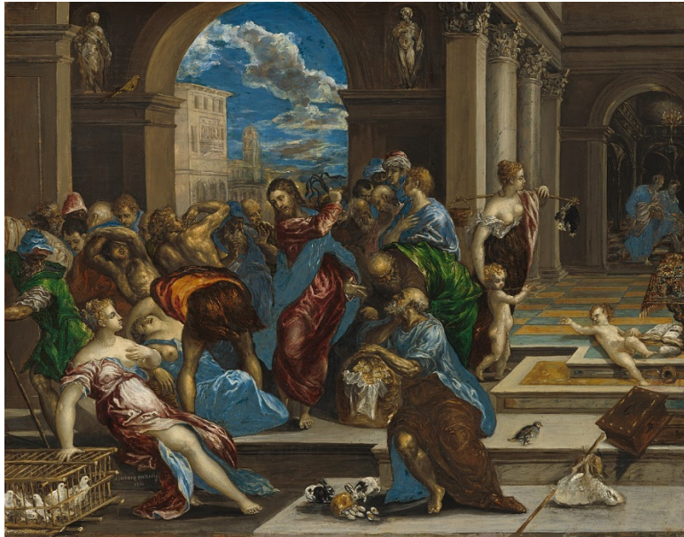
Christ Driving the Money Changers from the Temple, El Greco ( Doménikos Theotokópoulos ), 1568 Painting is located in the National Gallery of Art, Washington, D.C.

"Today bring to Me the Souls who have become Lukewarm and immerse them in the abyss of My mercy. These souls wound My Heart most painfully. My soul suffered the most dreadful loathing in the Garden of Olives because of lukewarm souls. They were the reason I cried out: 'Father, take this cup away from Me, if it be Your will.' For them, the last hope of salvation is to run to My mercy."