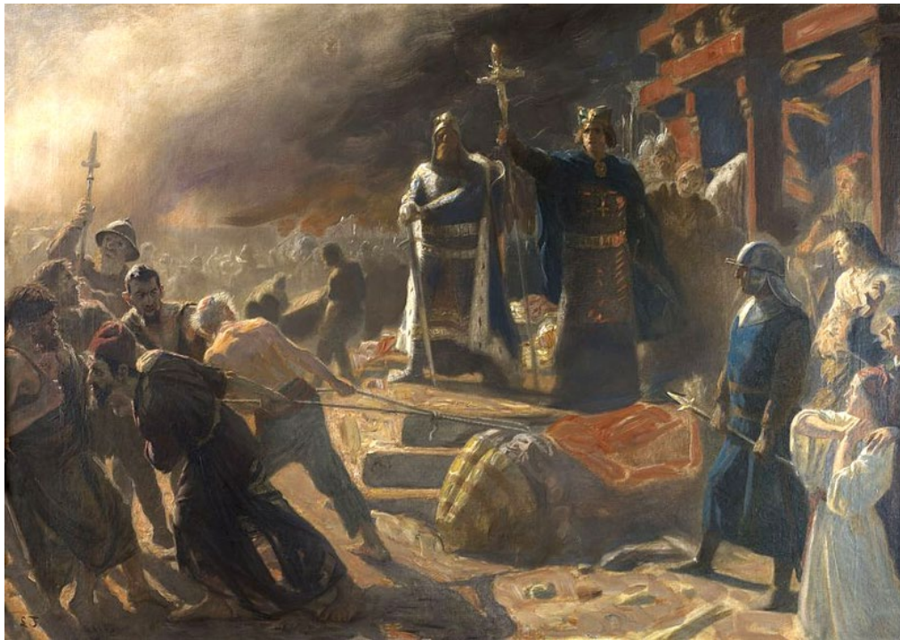
The Taking of Arkona in 1169 by King Valdemar and Bishop Absalon, Laurits Tuxen, before 1890 Painting located in The Museum of National History, Copenhagen

Those who do not believe in Jesus and those who do not yet know Him