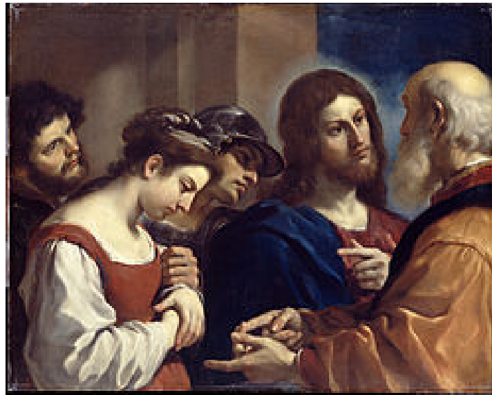
La donna adultera, Guercino (Giovanni Francesco Barbieri), 1621 Painting is located at the Dulwich Picture Gallery, London

The souls who especially venerate and glorify Jesus' mercy