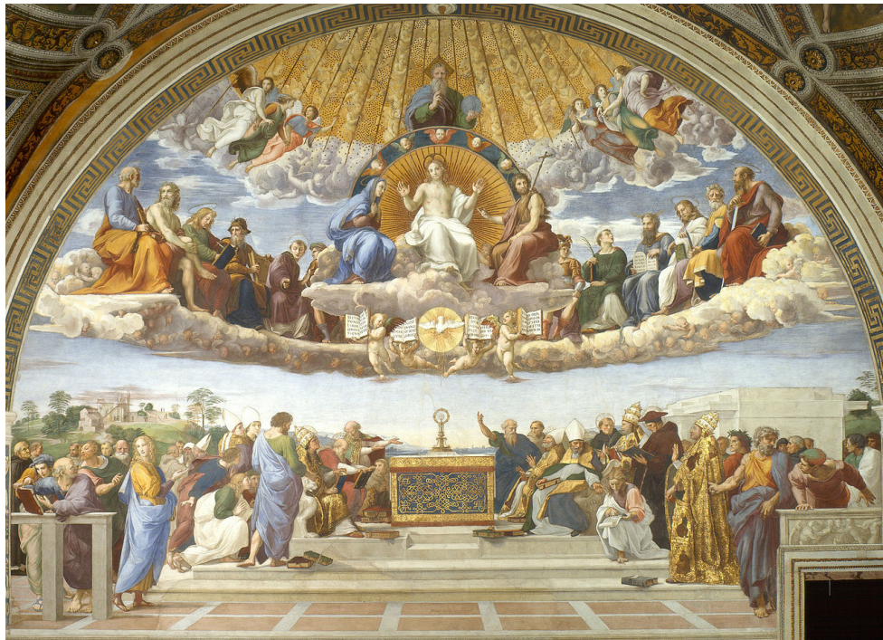
Disputation of the Sacrament, Raphael ( Raffaello Sanzio da Urbino ), 1509-1510 Fresco located in the Apostolic Palace, Vatican City

"Today bring to Me the Souls of Priests and Religious, and immerse them in My unfathomable mercy. It was they who gave me strength to endure My bitter Passion. Through them as through channels My mercy flows out upon mankind."