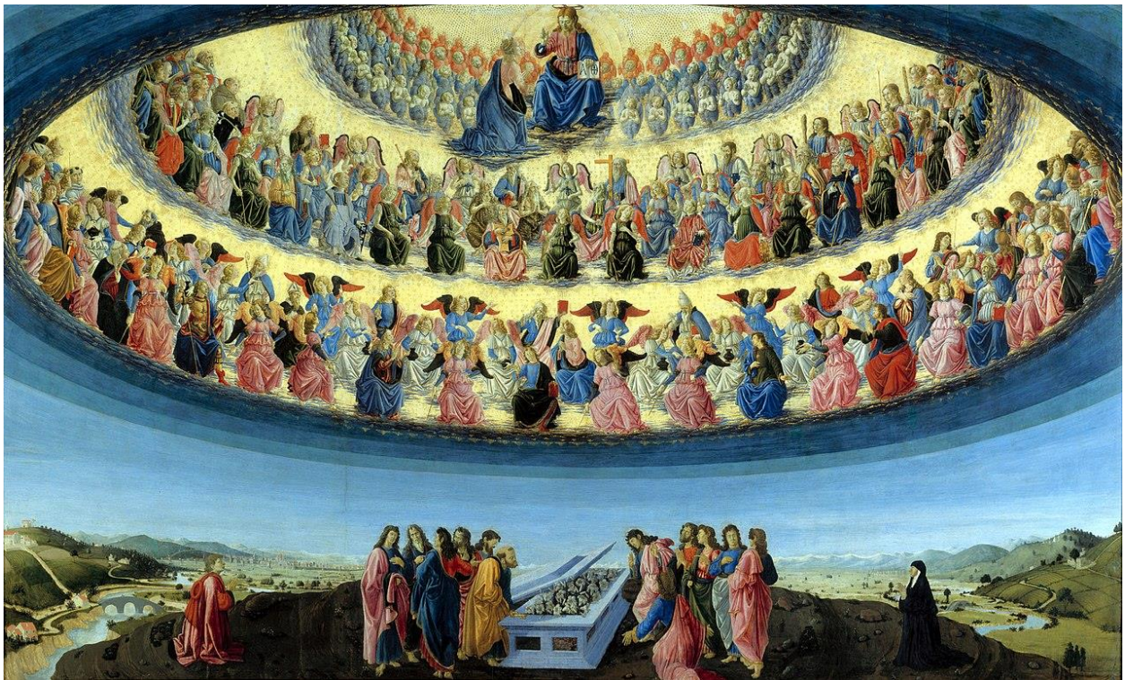
Francesco Botticini, The Assumption of the Virgin, 1475-1476, National Gallery, London.

This is an illustration of the three hierarchies and nine orders of angels, distinguishing each order with different characteristics. The painting also centers around the assumptions of Mary's body.