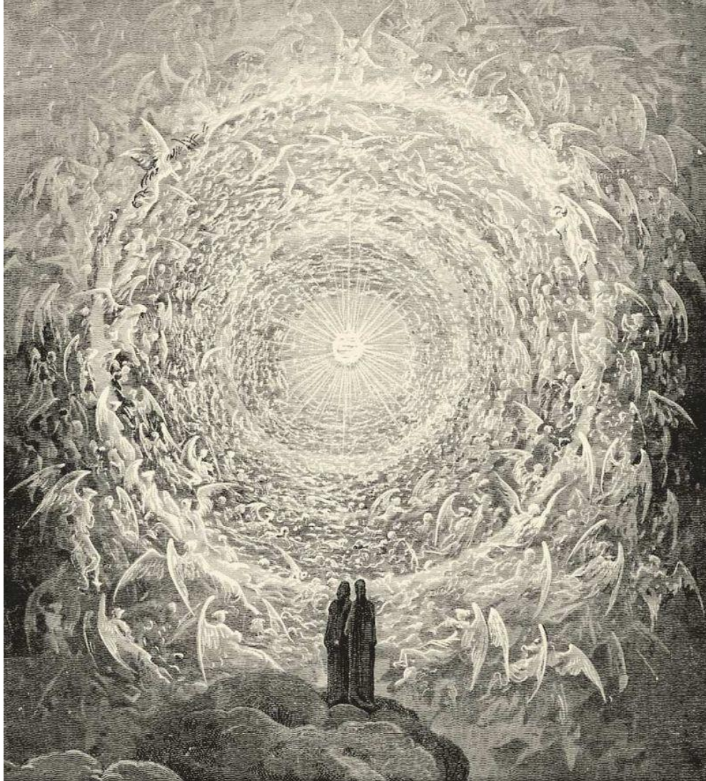
The angelic choirs circling the abode of God, from Dante's Paradiso, illustrated by Gustave Doré.