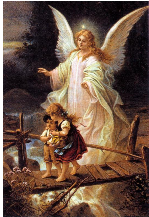
Guardian angel, German postcard, 1900

http://en.radiovaticana.va/news/2015/10/02/pope_francis_respect_and_listen_to_your_guardian_angel/1176291 )