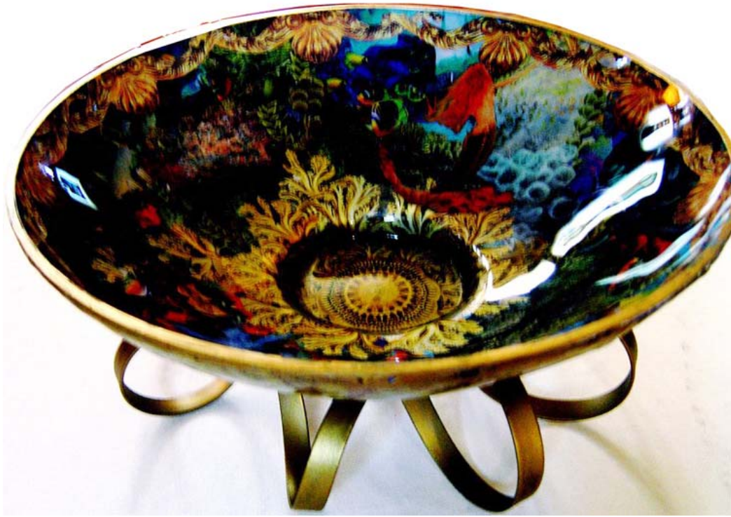
Under Sea Bowl Under Glass 17" x 4"