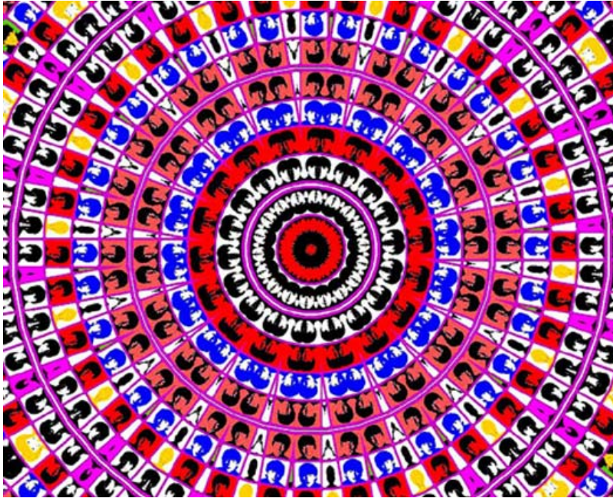
Paper design created for cover and inside lid (Can you see all the Beatle heads making up the design?)