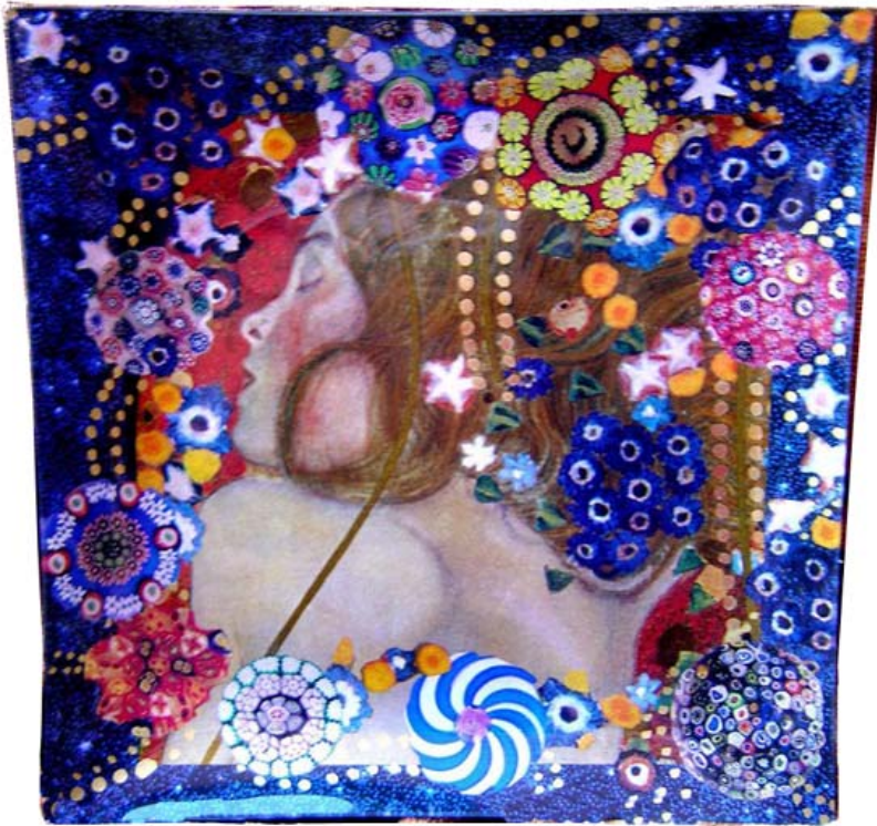
Klimt and Murano-style Collage 12"x12" curved glass

I used a print for the center and carried out the metallic gold design of the center on the edges with a gold leaf pen. I also used a sheet of decoupage paper with lots of Murano glass designs. The tiny floral and circular designs were copied from a scarf and the starry sky background I copied from a quilt square.