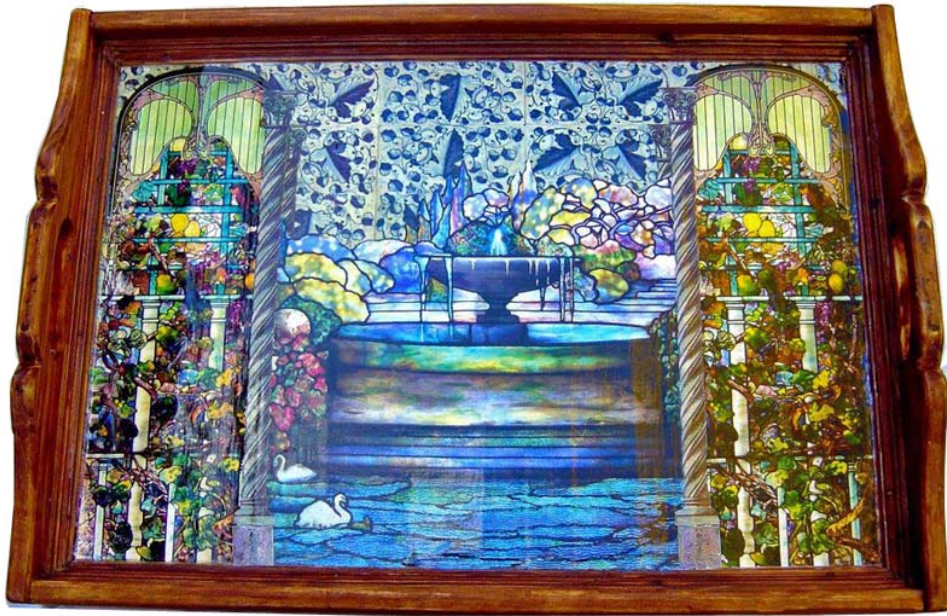
Tiffany Under Varnish Tray 20" x 14"