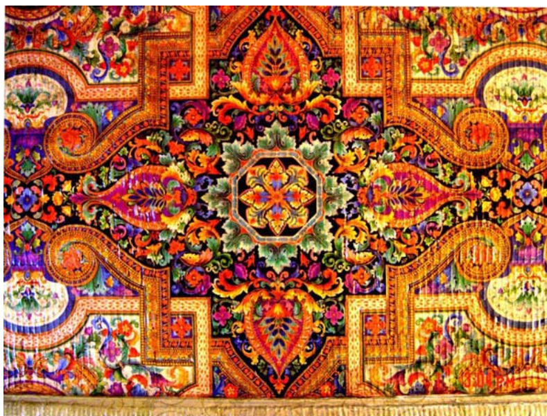
Close-up of Trunk Top

Wicker is easy to decoupage. Just paint on the glue and VERY, VERY, VERY ever so gently press the tissue into the weave. Finish with a coat of polyurethane.