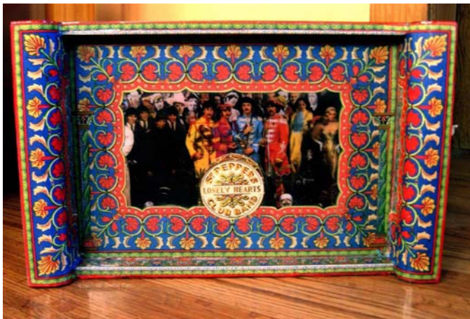
Sgt. Pepper Under Varnish Tray 18" x 11" x 3"