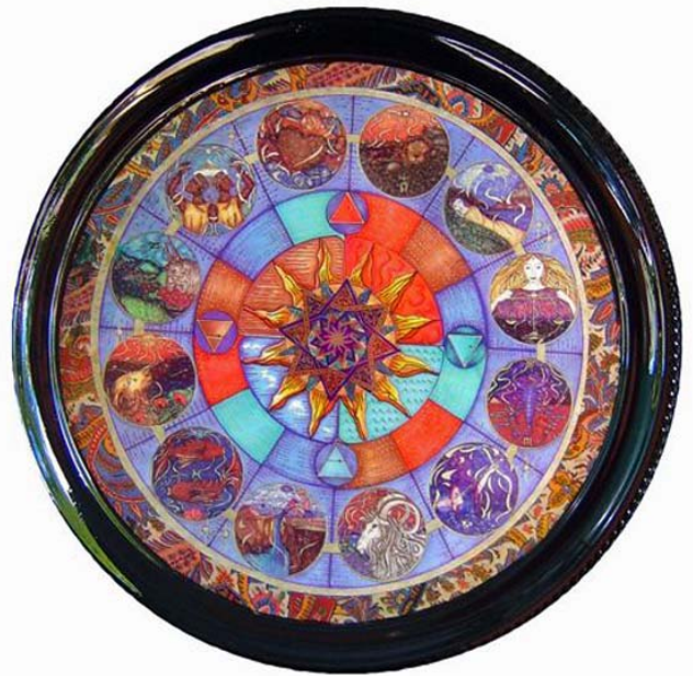
Under Varnish Zodiac Tray 15" diameter