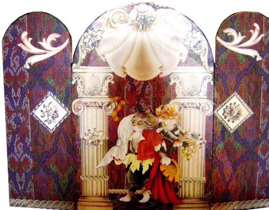
The Taming of the Shrew

Kitty Privacy Screen Under Varnish (48" x 18")