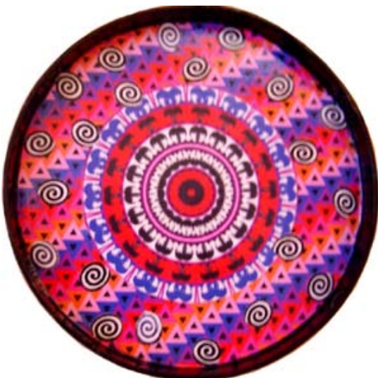
Inside of box lid