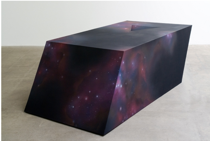
An Infinite Collapse

but it is formed into rhythmic intervals (in contrast to the formlessness of modern art, which basically stresses the infinity of space stretching into depth)." 3 The spatial interval, now understood as a container of infinite space rather than an empty passage, has been made to submit to the dominating effect of rhythm and the aesthetic imperative of unity.