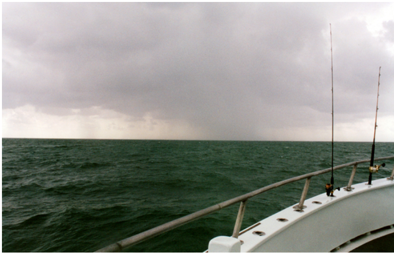
The Bermuda Triangle

When we learn, for instance, that the hollow core of An Infinite Collapse (2005) is filled with fifty gallons of hermetically sealed saltwater harvested from the Bermuda Triangle we see a doubling, like an image splitting and “de-laminating” from itself, suddenly crystallized: the sculpture is there as a physical body, but the sculpture is also in the wild currents of information regarding the Bermuda Triangle that come rushing in. Neither side has priority over the other. And to obviate the second, immaterial (but very real) dimension of the work is to shortchange its complexity and to refuse to see the exercise in adjusting sculptural production to a world traversed by endless networks, overflowing with information, and shaped by invisible forces.