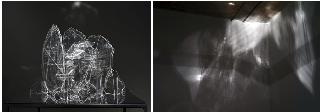
The Glass Delusion - Mirage Artifacts and their light reflections

that wants to assemble a new type of image. My suggestion is that the sculpture wants to perform for us a mode of seeing that could loosely be called visionary in nature.