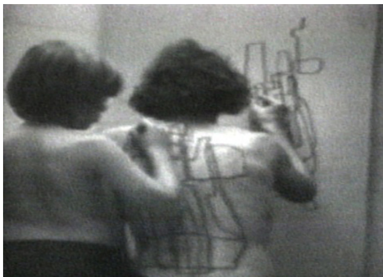
Dennis Oppenheim - Two Stage Transfer Drawing (Advancing to a Future State)