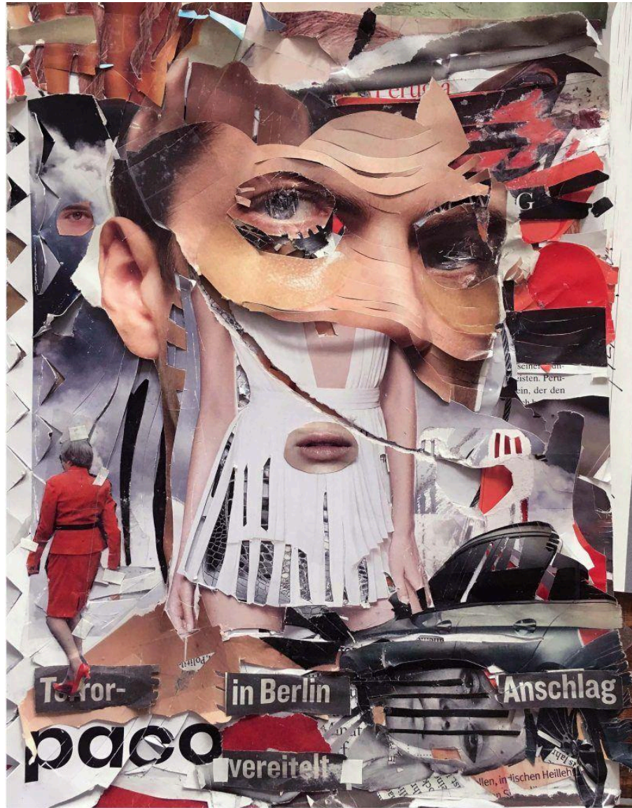
Terror with Theresa May Turning Her Back on Europe

of fascism, mass extermination, and world war, she is pointing to the necessity of encoding explosive cultural commentary in humor and visually appealing imagery, of going underground with it, as it were—both to protect one’s powers of perception and to counter the effects of the spellbinding that numbs us to the dangers facing us.