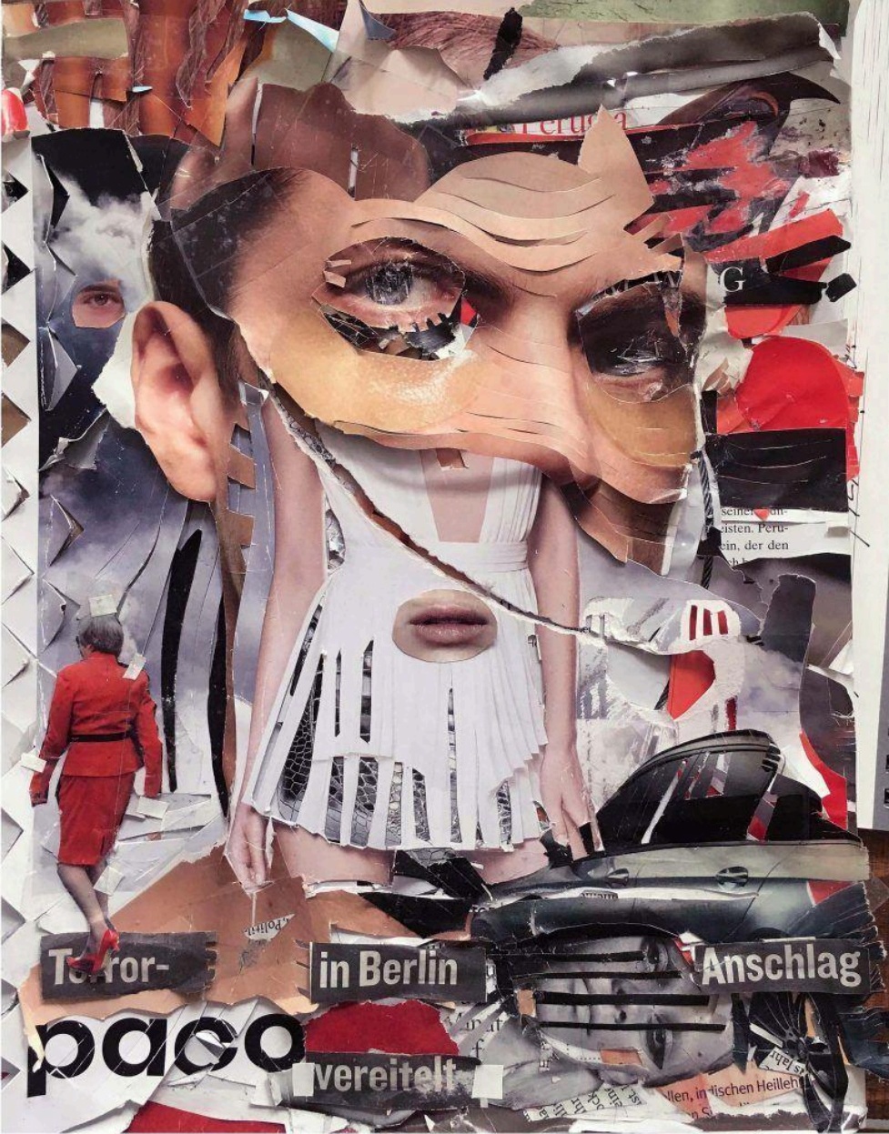
Terror with Theresa May Turning Her Back on Europe

encoding explosive cultural commentary in humor and visually appealing imagery, of going underground with it, as it were—both to protect one’s powers of perception and to counter the effects of the spellbinding that numbs us to the dangers facing us.