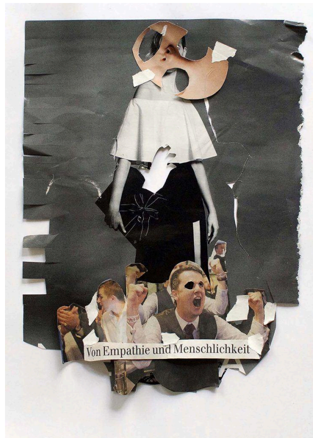
Empathy and Humanity

but rather that no one believes anything at all anymore. (...) And a people that can no longer believe anything cannot make up its mind. It is deprived not only of its capacity to act, but also of its capacity to think and to judge. And with such a people you can then do what you please.”