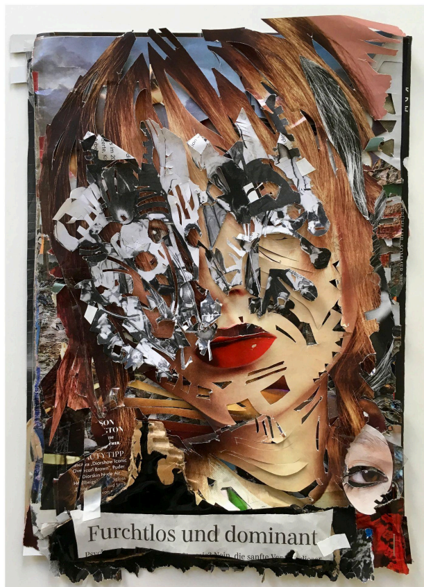
Fierce and Dominant

Alyssa DeLuccia's Letting You in on a Secret is an eloquent artistic inquiry into present-day politics, the media, and contemporary life—one that takes the form of a visual essay operating within the disturbance pattern of a subtle but crucial shift in medium that multiplies and compounds the power of the work and its message.