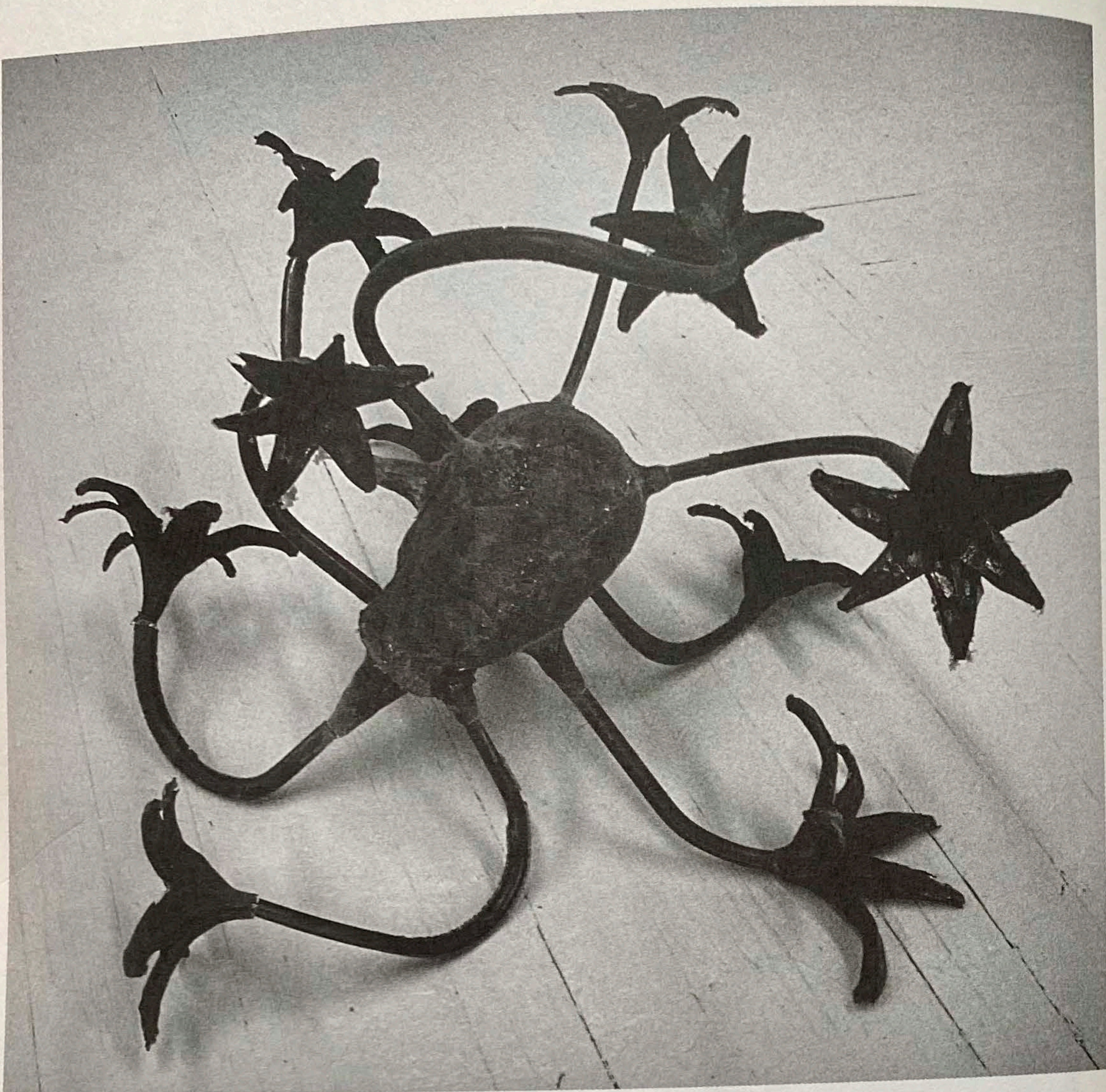
Tory Fair , Daydream , 2008, cast rubber with steel, 35 x 34 x 35 in.