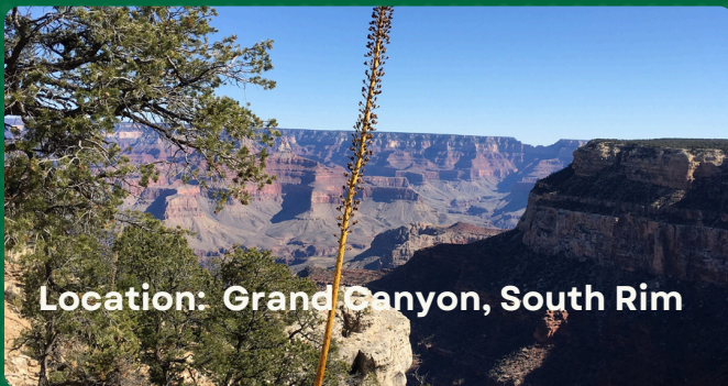
Location: Grand Canyon, South Rim