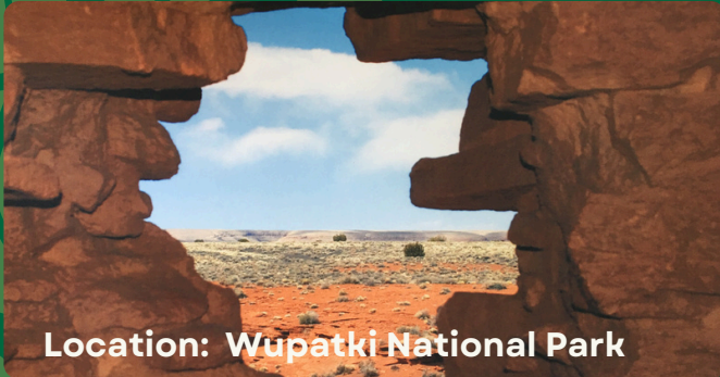
Location: Wupatki National Park