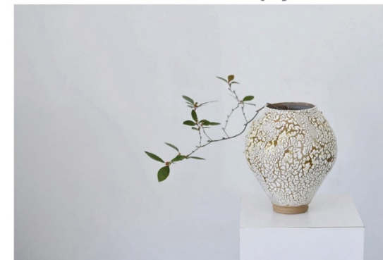
River Vase, Stoneware and Local Clay, 14\", 2022