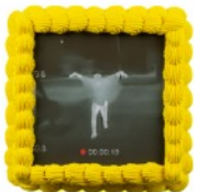
cmyk thermal, 2025 acrylic, inkjet, board 7 x 7 x 4 in 350