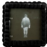
cmyk thermal, 2025 acrylic, inkjet, board 7 x 7 x 4 in 350