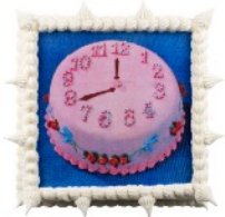
phi-zoelectric, 2024 acrylic, inkjet, board 9 1/2 x 10 x 4 in 450