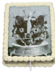
frosted boar. 2024 acrylic, inkjet, board 9 1/2 x 12 x 4 in price on request