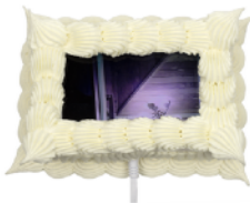
video cake 2. 2024 acrylic, inkjet, board 7 x 5 x 4 in price on request