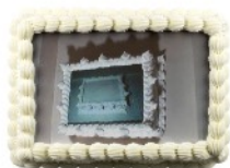
Navidson. 2024 acrylic, inkjet, board 11 x 8 x 4 in 400