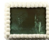
NV BRIDGE, 2024 acrylic, inkjet, board 11 x 9 x 4 in 500