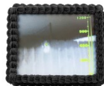
USDHS RH, 2024 acrylic, inkjet, board 12 x 10 x 4 in 450