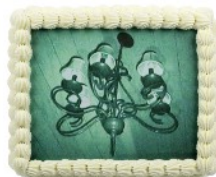
NV CHAN, 2024 acrylic, inkjet, board 11 x 9 x 4 in 500