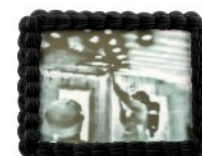
USDHS OVR, 2024 acrylic, inkjet, board 10 1/2 x 9 x 4 in 450