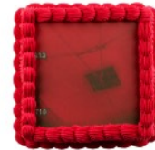
cmyk thermal, 2025 acrylic, inkjet, board 7 x 7 x 4 in 350