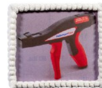
U-LINE GUN, 2024 acrylic, inkjet, board 10 1/2 x 9 x 4 in 450