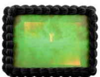
USDHS INVS, 2024 acrylic, inkjet, board 10 1/2 x 9 x 4 in 450