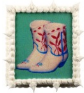
cowboy boots, 2024 acrylic, inkjet, board 9 x 10 x 4 in 450