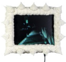
video cake 1. 2024 acrylic, inkjet, board 10 x 8 x 4 in price on request