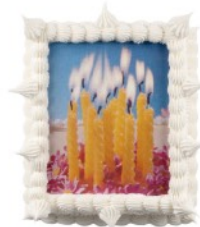
hbd. 2024 acrylic, inkjet, board 8 x 9 x 4 in 350

These sculptures explore the cake as an object that carries an inherent metaphorical language and visual function, transforming it from a consumable item into a vehicle for deeper social and technological commentary.