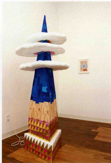
(left to right) UNTITLED #3 (FAIR WEATHER CUMULUS, FORT), 2008, cardboard, metal, cloth, plaster, plastic, paper, acrylic, wax, plasticine, rubber and papier-mâché, 9.5' x 18" x 24"; UNTITLED #4 (REFRACTION OF BOLTS), 2008, cardboard, wood, cloth, plaster, plastic paint and ink, paper, acrylic, wax, rubber and papier-mâché, 7' x 24" x 30"; UNTITLED #5 (STRATA AND HALO), 2008, cardboard, wood, metal, cloth, plaster, plastic, paint, ink, paper, acrylic, light bulb, cable, and papier-mâché, 7' x 26" x 24". (All works pictured are from the series, The Vertical Shadows .)