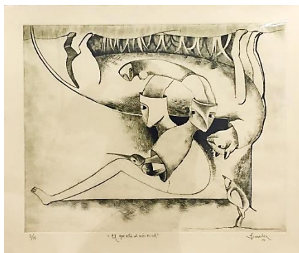
Vicente Bonachea (Havana, Cuba, 1957)