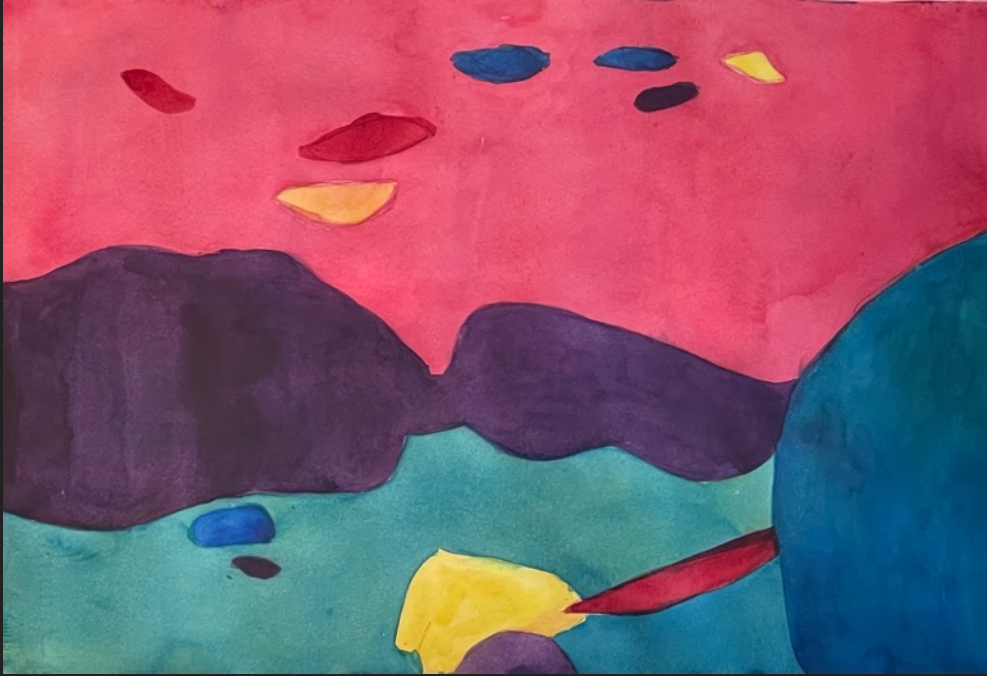
Shapes, January 27