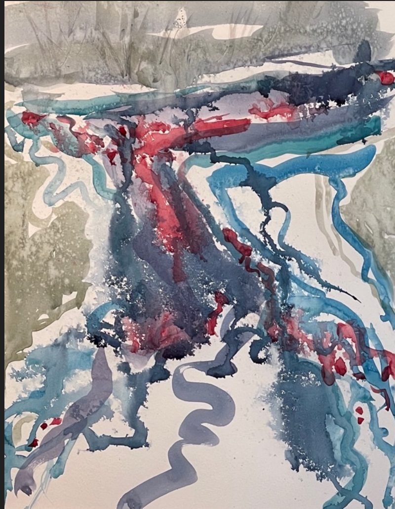
Water Defining Water, March 30