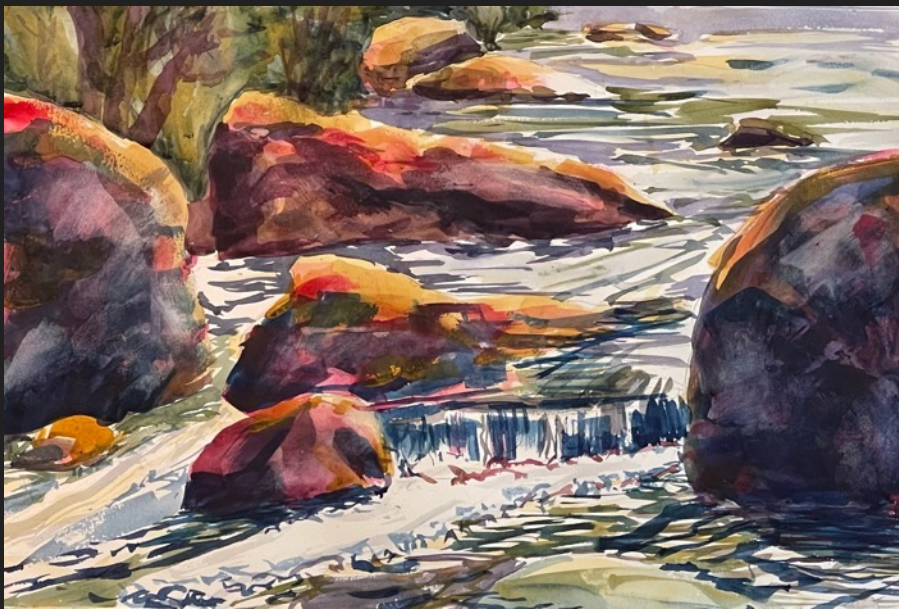
Color Triads, Feb. 10