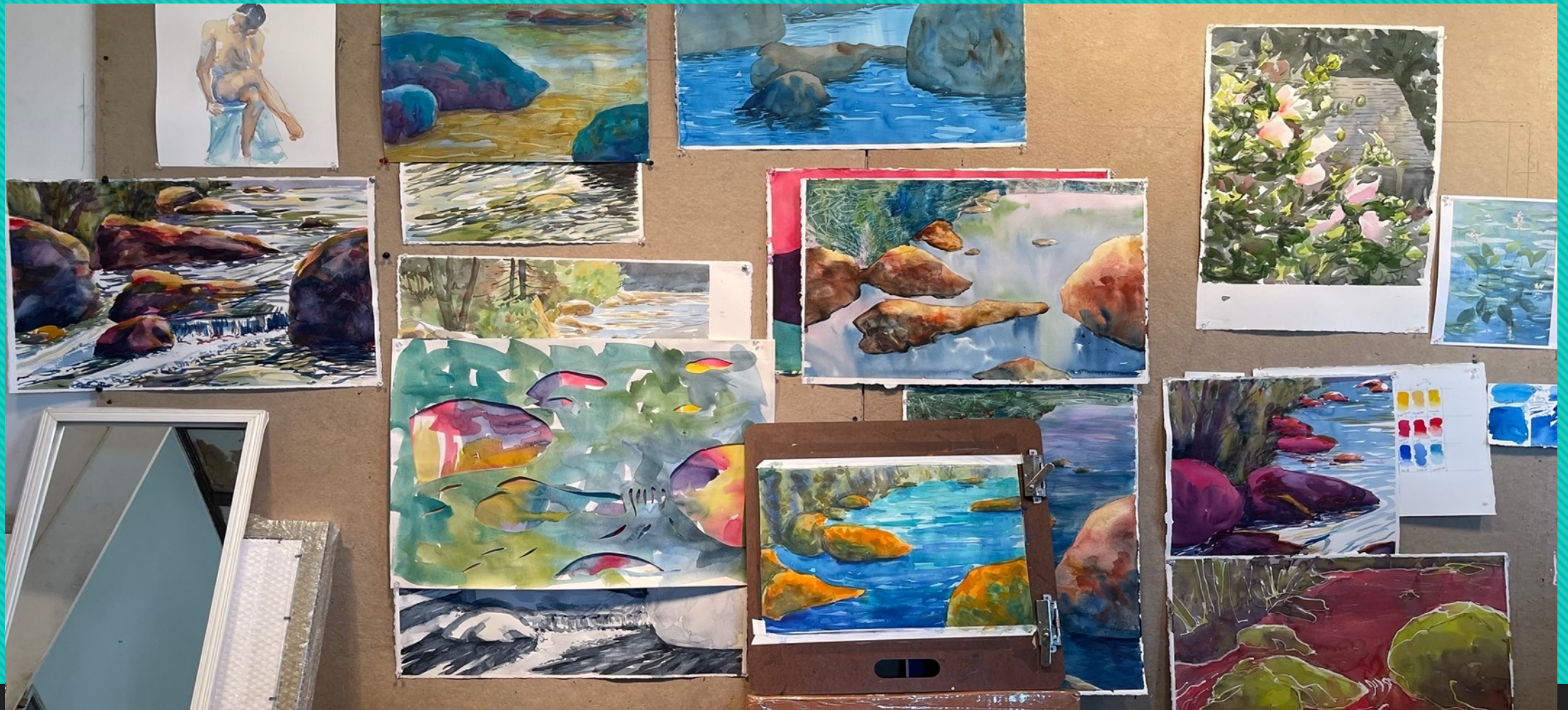
Snap shots from the series project.