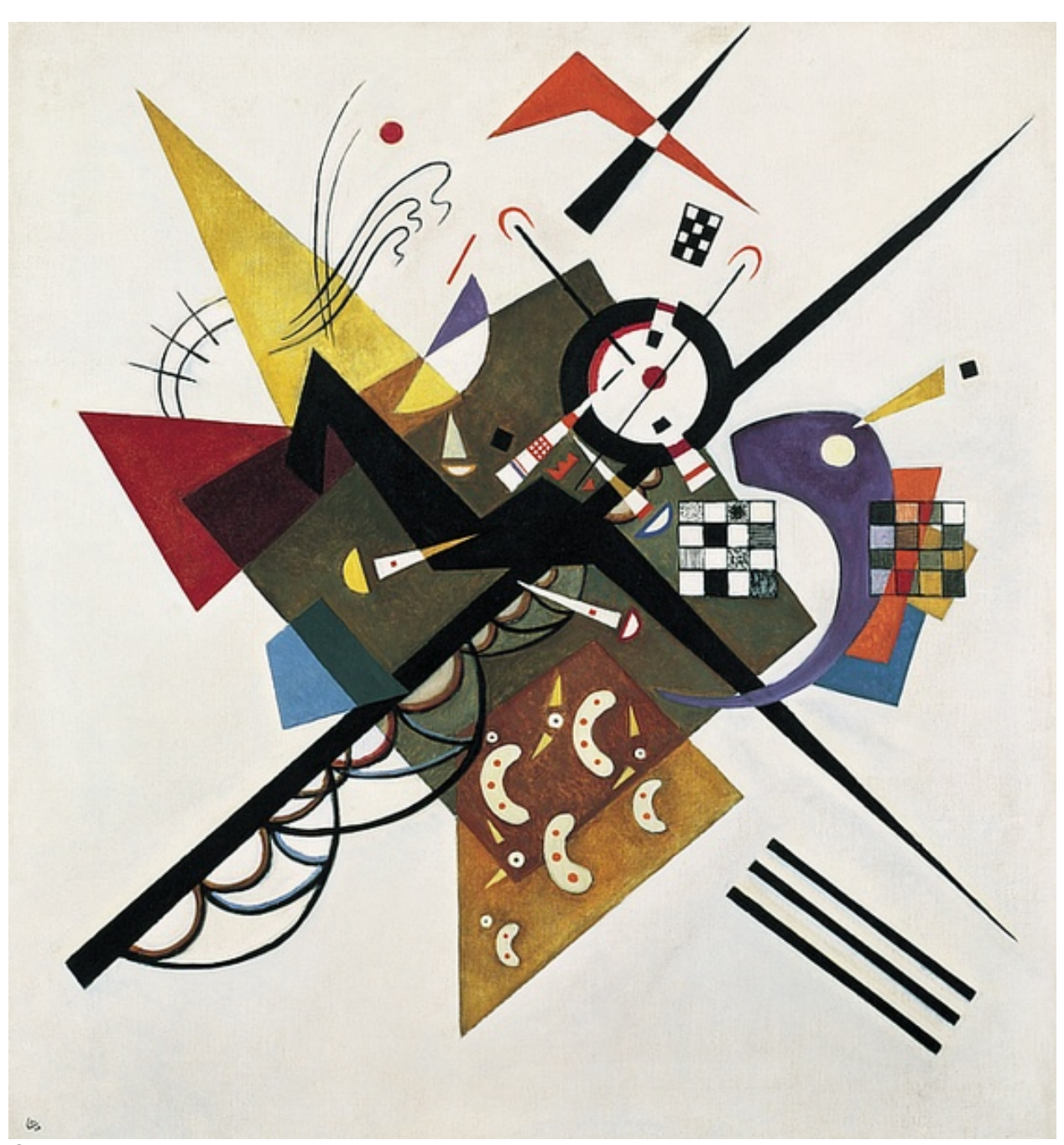
On White, 1923