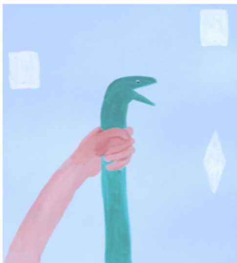
Jenn Smith, Untitled (Snake), (2016). Oil and acrylic on canvas.