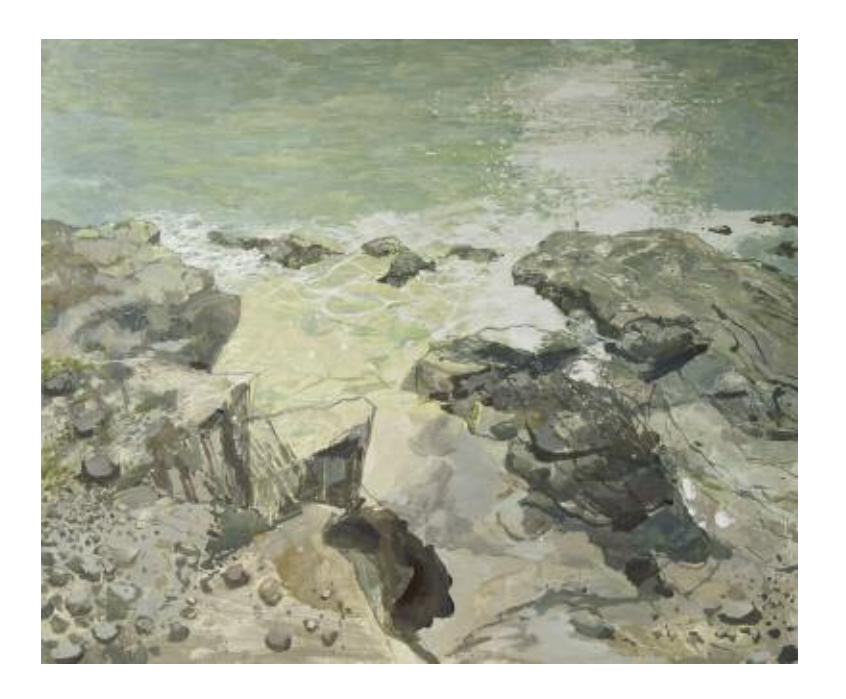
Figure on Rocky Shoreline 30 x 36 cm egg tempera on gesso board

Fossil Hunting, Whitby 31 x 36 cm egg tempera on gesso board