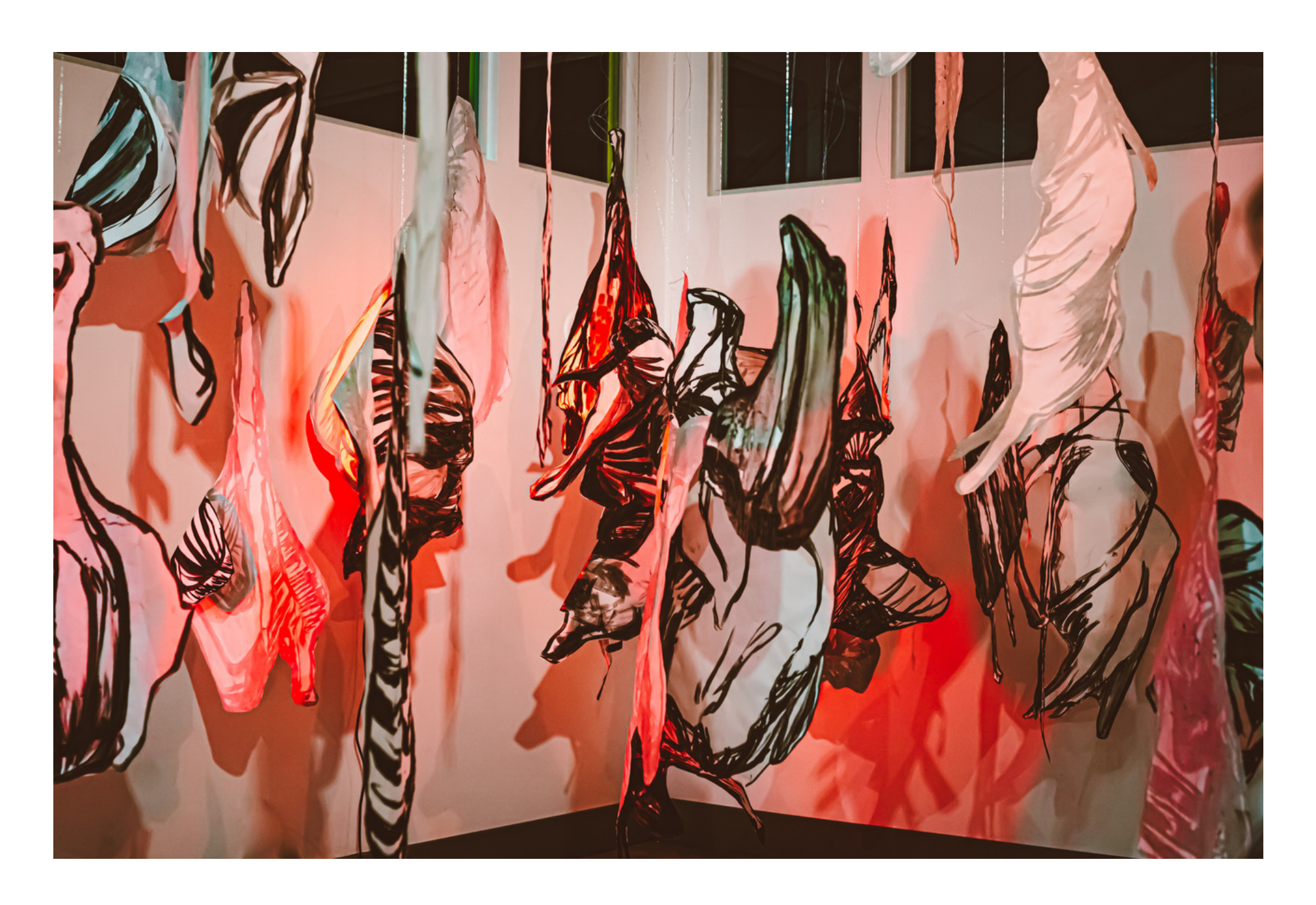
Aging & Maturing (Installation)

Dimensions vary. Powdered Graphite on Vellum. 2022. Inquire for Pricing