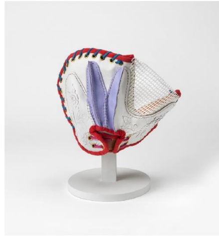
Betsy Odom Bulldog 10: Mitt, 2018 Tooled leather, paint, fabric, webbing, grommets 12 x 12 x 7"