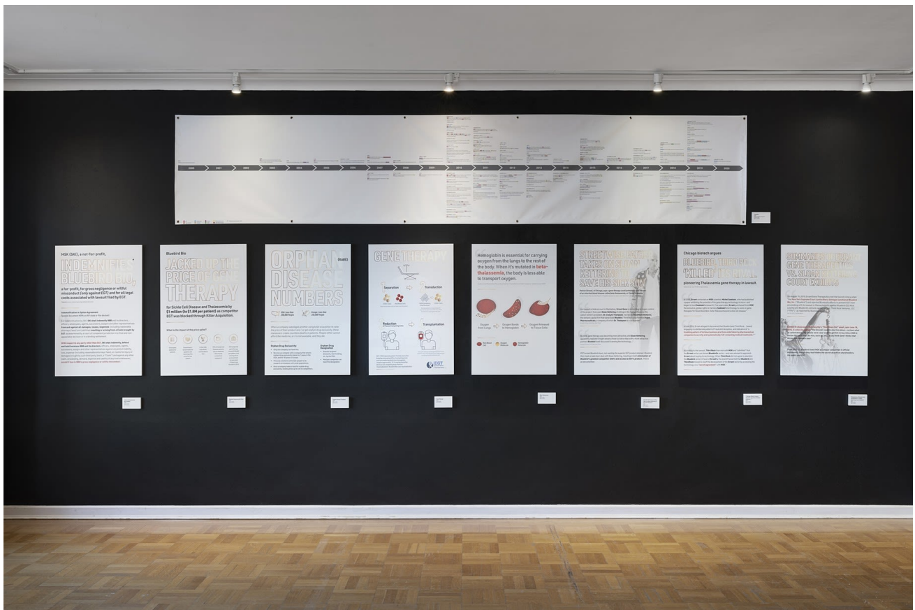
Timeline and Case Graphics (full view), installation at The International Museum of Surgical Science (4294), 2020, prints on PVC, print on vinyl