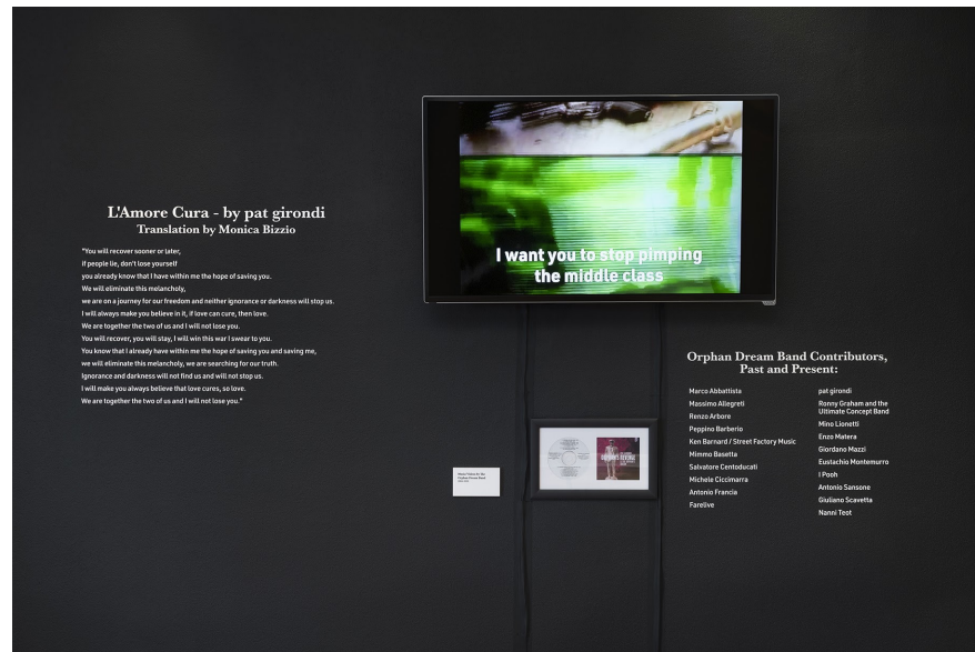
Orphan Dream Band wall (I want you to stop pimping the middle class): Installation at The International Museum of Surgical Science (4257), music videos, vinyl lettering, cd and case, 2020