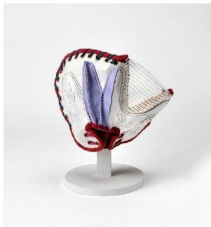
Betsy Odom Bulldog 10: Mitt, 2018