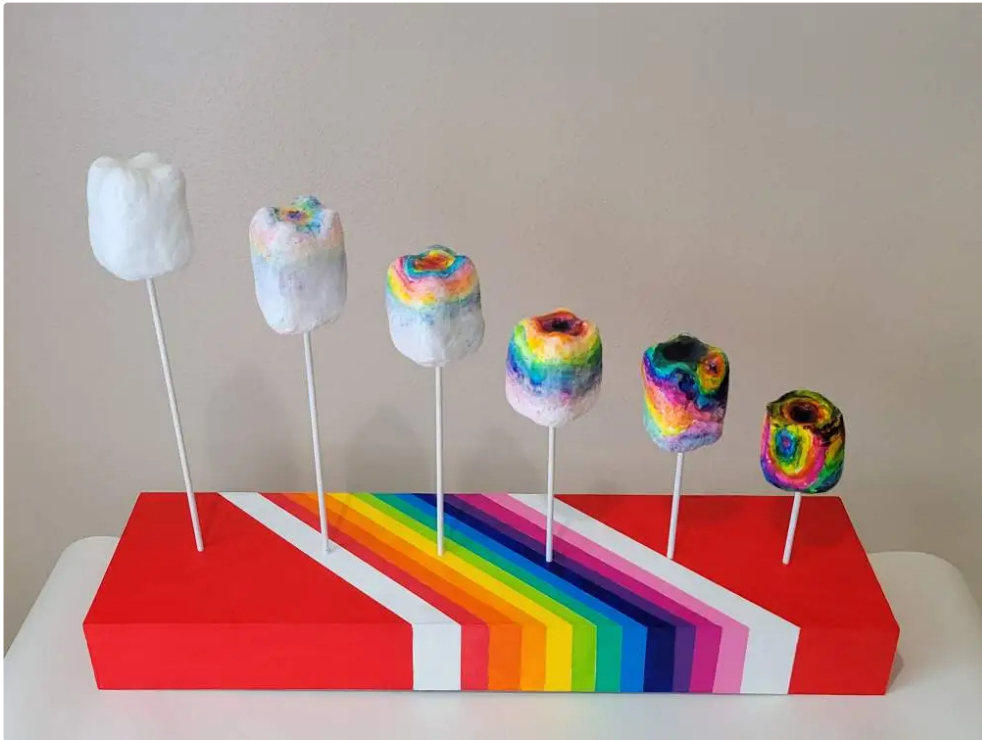
ERIN ELLIOTT, SUGAR DECAY, USF (TAMPA, USA)