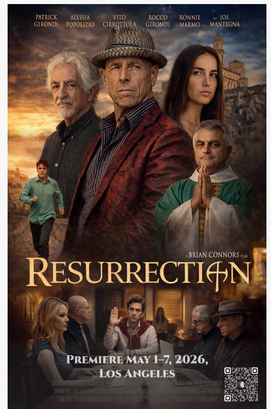
Resurrection premiere poster