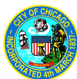
Lori E. Lightfoot Mayor of Chicago

This project is partially supported by a CityArts Grant from the City of Chicago Department of Cultural Affairs & Special Events.