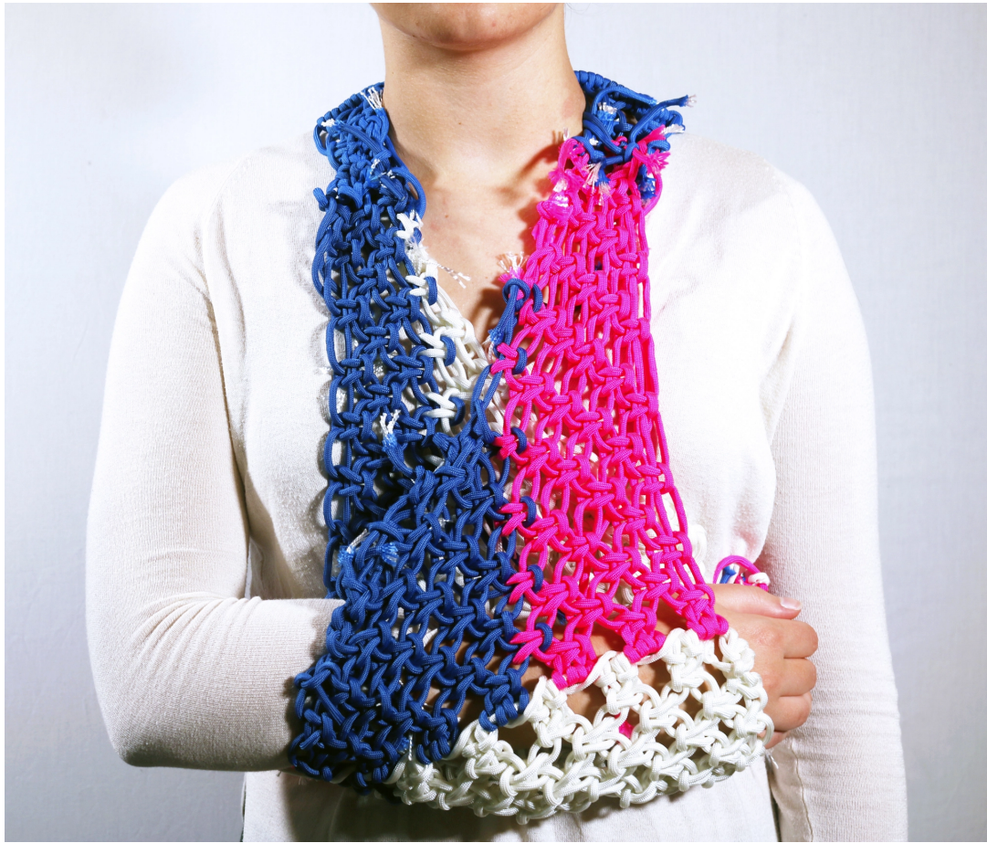
Dara Oramas | Macrame Arm Sling Prototype | 2017 | Paracord