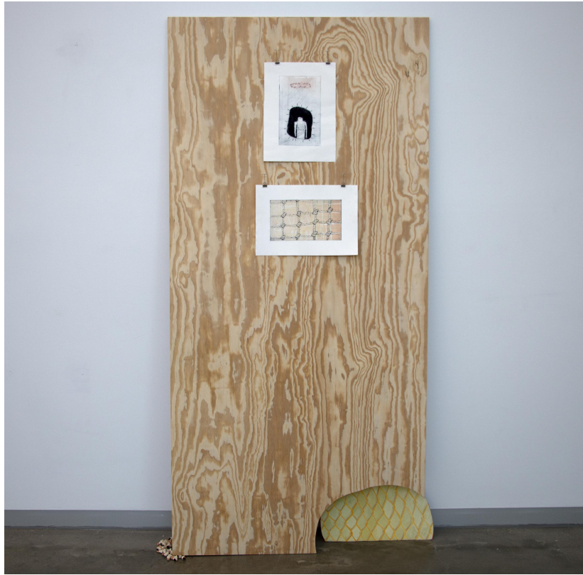
Two Prints on Ply , Intaglio, Plywood, Stoneware, Oil Paint, Polymer Clay, Acrylic Paint, 2017

Two Prints on Ply is a study of objectification, restriction, repetition, and physical boundaries. During the creation of this piece I was thinking about the glass ceiling and how to pass through it. I was considering how we must try over and over again to get through and what might be on the other side, just out of reach.