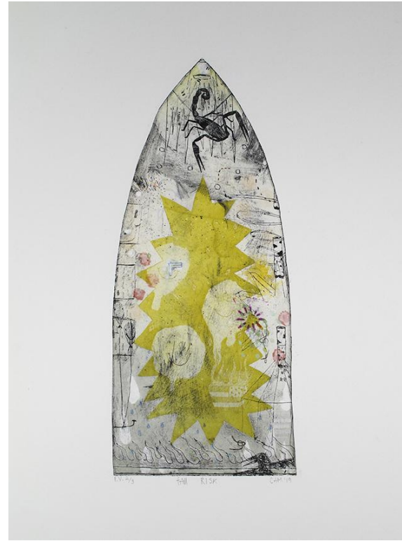
Fall Risk 1&2 , Intaglio and mixed media, 20x16", 2019

For this series of prints I wanted to capture more visual history so I used a plate from a previous print. I cut the shape of the plate by hand and scraped past imagery off the surface. I then used a second plate for the central imagery. I added a transparent rainbow roll, trace monotype, and hand working to my print. The scorpion imagery comes from a Greek myth where Orion bragged that he would kill every animal on the earth. The goddess Artemis and her mother, Leto, dispatched a scorpion to kill Orion, thus saving all animals.