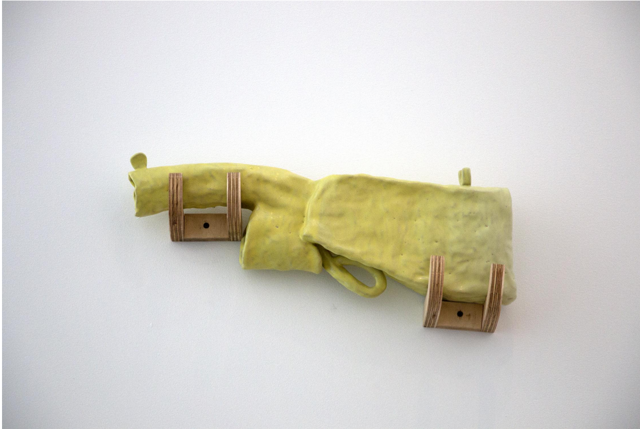
Detail Yellow Gun, Stoneware and Plywood