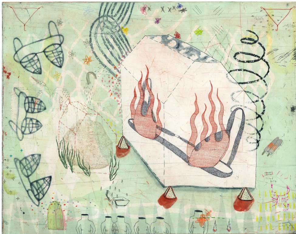
Rocks and Glass Ceilings , Intaglio and mixed media, 10x12", 2017

Rocks and Glass Ceilings is a print about being a woman and feeling frustrated when I am viewed as an object. This is a 5 plate print that I began after Kathryn Polk challenged me print all my line work rather than add details by hand. I wasn't able to keep myself from adding drawn elements, but this challenge showed me that the immediacy of drawing is something I value in my work, and it also showed me what can be done with layering plates.