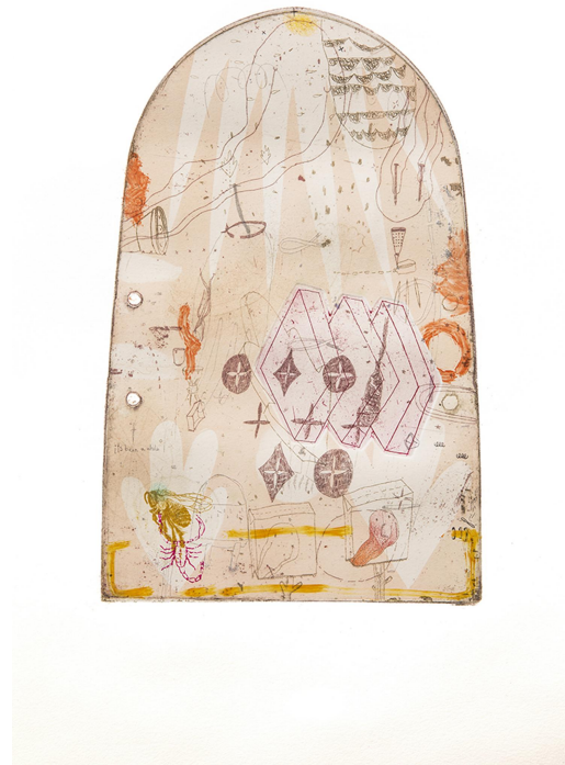
Slick and Slippery 1 & 2 , Intaglio and mixed media, 12x6", 2017

Drawing in my sketchbook is the foundation of my entire artistic practice, so I figured I might as well bind my copper plates into a sketchbook and draw on both sides of the plates freely. I utilized both new and reclaimed copper and used a plasma cutter to uniformly cut them to resemble the classic gravestone shape. When it came time to print I inked up and wiped my plates simultaneously, layering my line work randomly in each print, creating a myriad of different outcomes.