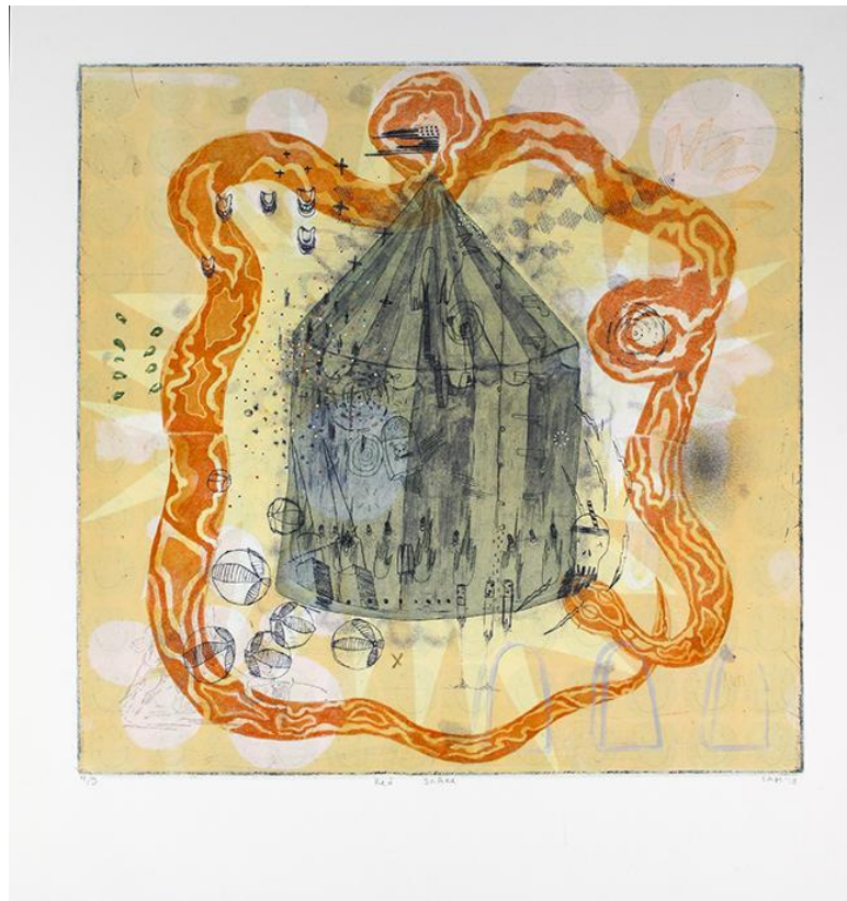
Red Snake , Intaglio and mixed media, 20x20", 2018

This series was born from the panic I was feeling about the current state of politics in the United States. This print is comprised of 5 different plates, assembled to represent a circus. There are several monotype layers and elements of handworking present in this final print.