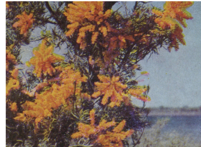
CARLY LYNCH, The Log , December 1965 (detail), 2017, scanned publication courtesy of Heathcote Hospital Collection, City of Melville, dimensions variable.