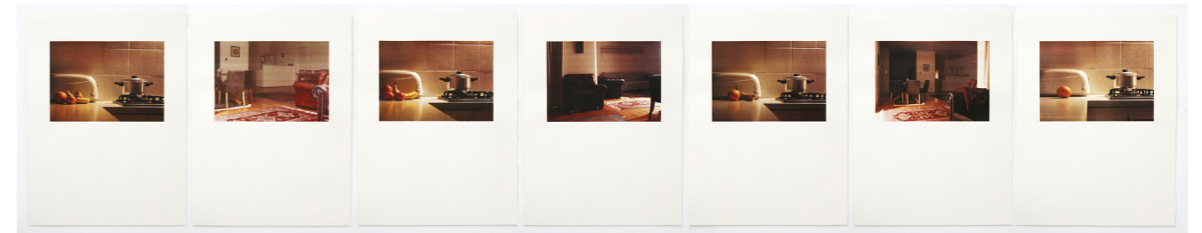
LAYLI RAKHSHA, Study of home , 2015, colour separation silk screen print on paper, 76 x 404 cm.