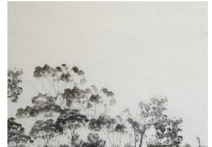
MONIKA LUKOWSKA, Encountering the unfamiliar (detail), 2016, lithography, 64 x 97 cm.