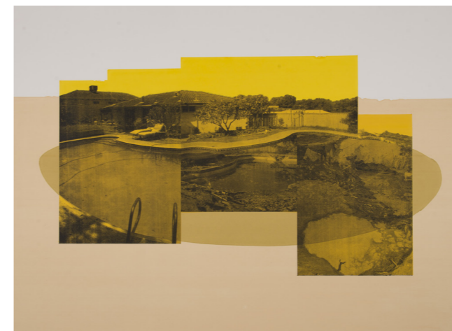
EMMA JOLLEY, Swim Swam Swum , 2015, stencil and silk screen print on BFK, 107 x 80 cm.