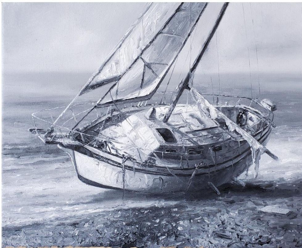
In search of .... (nr. 19) | oil on canvas | 20 x 25 cm | 2024