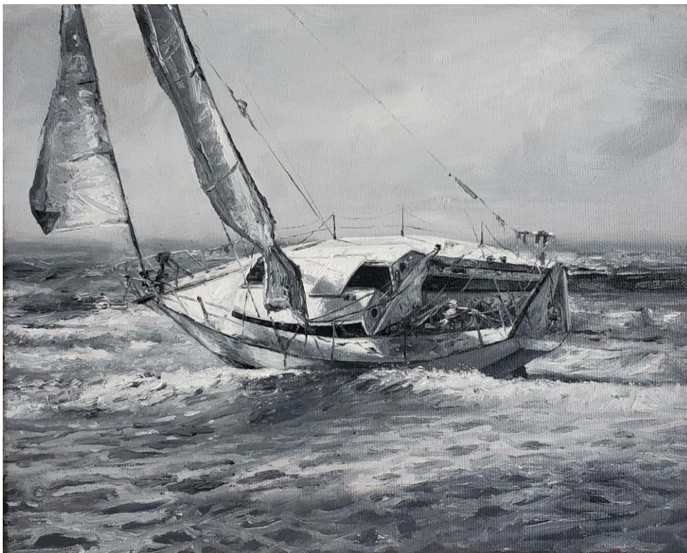
In search of .... (nr. 11) | oil on canvas | 20 x 25 cm | 2024