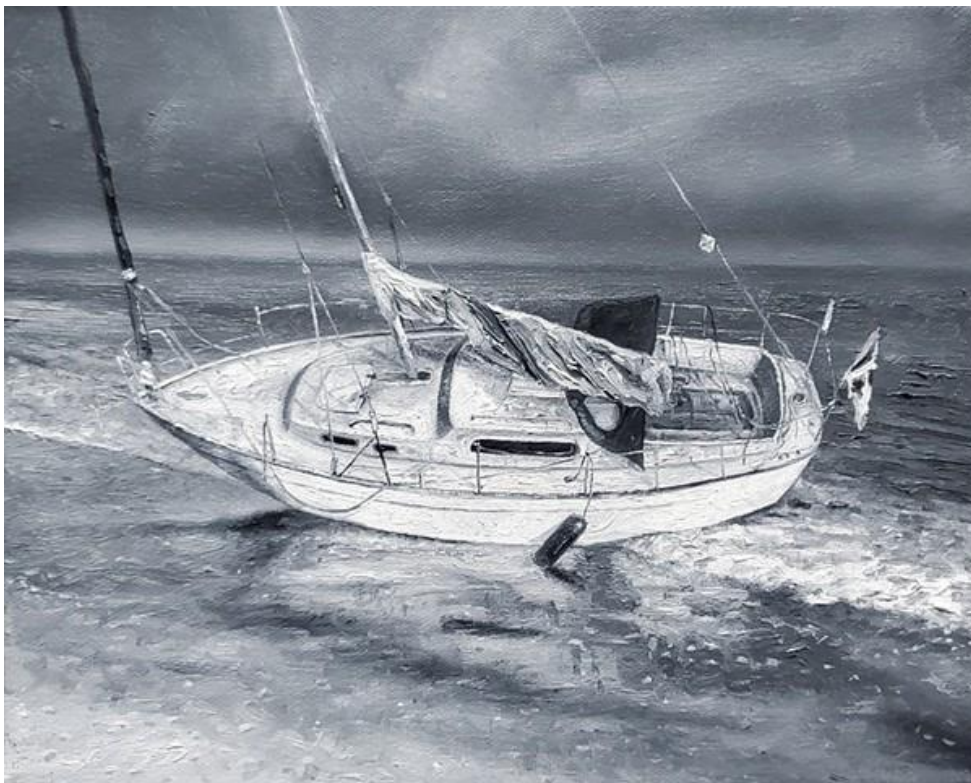
In search of .... (nr. 15) | oil on canvas | 20 x 25 cm | 2024