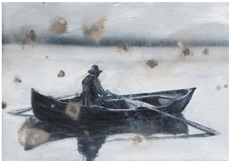
person in row boat | oil on canvas | 10x 15 cm | 2023