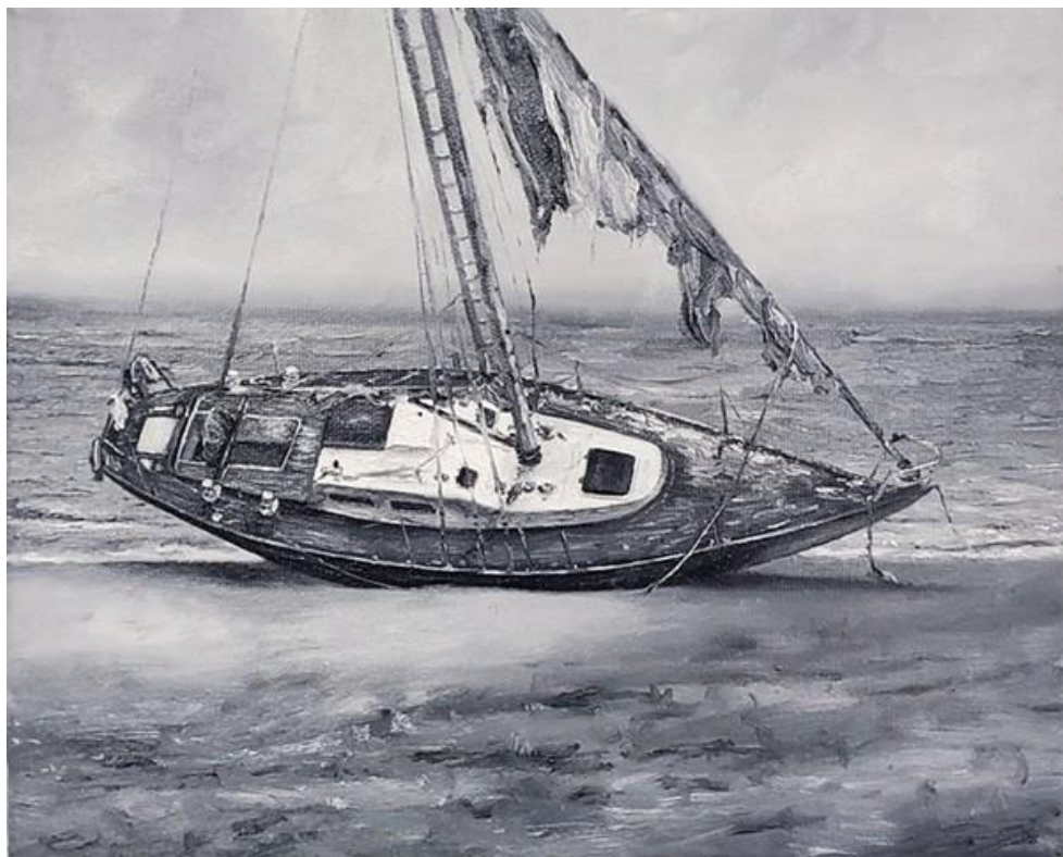
In search of .... (nr. 13) | oil on canvas | 20 x 25 cm | 2024