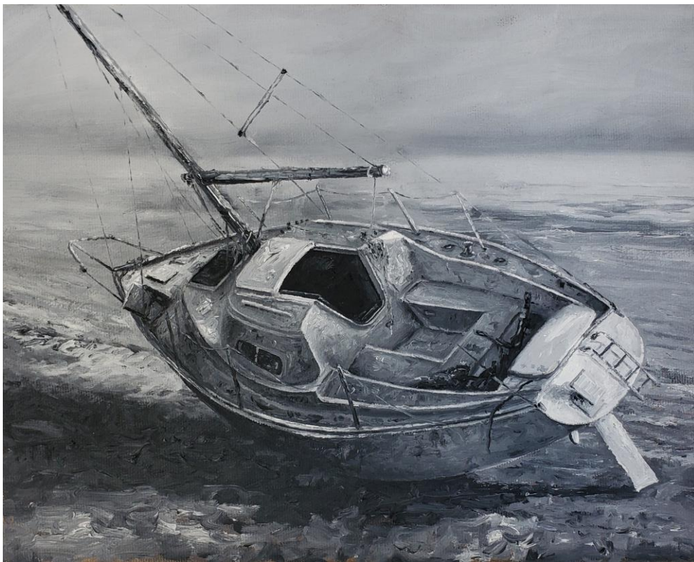
In search of .... (nr. 8) | oil on canvas | 20 x 25 cm | 2024