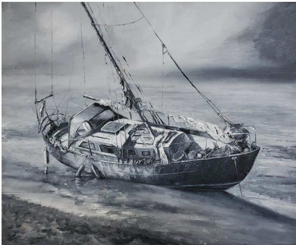
In search of ... (nr. 7) | oil on canvas | 20 x 25 cm | 2024