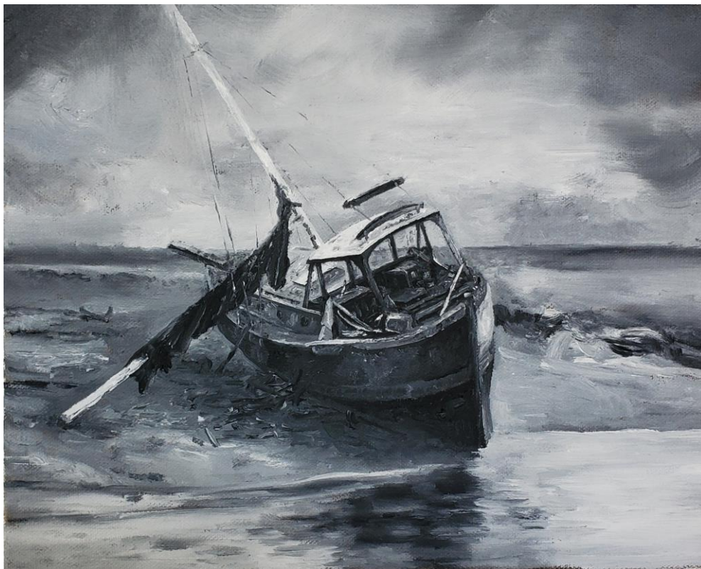
In search of .... (nr. 5) | oil on canvas | 20 x 25 cm | 2024