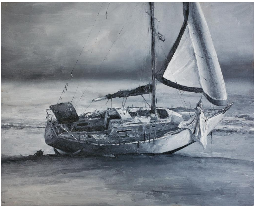
In search of .... (nr. 4) | oil on canvas | 20 x 25 cm | 2024