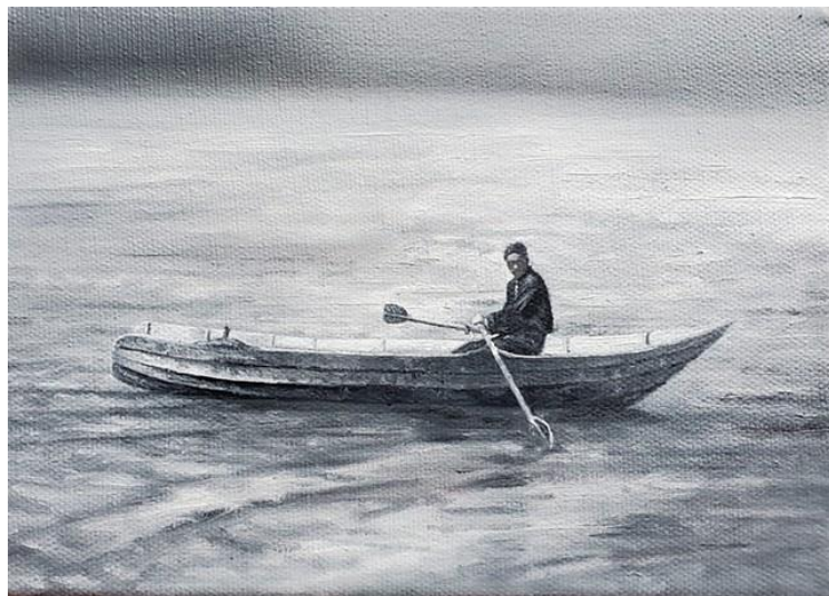
young man in row boat | oil on canvas | 10x 15 cm | 2023