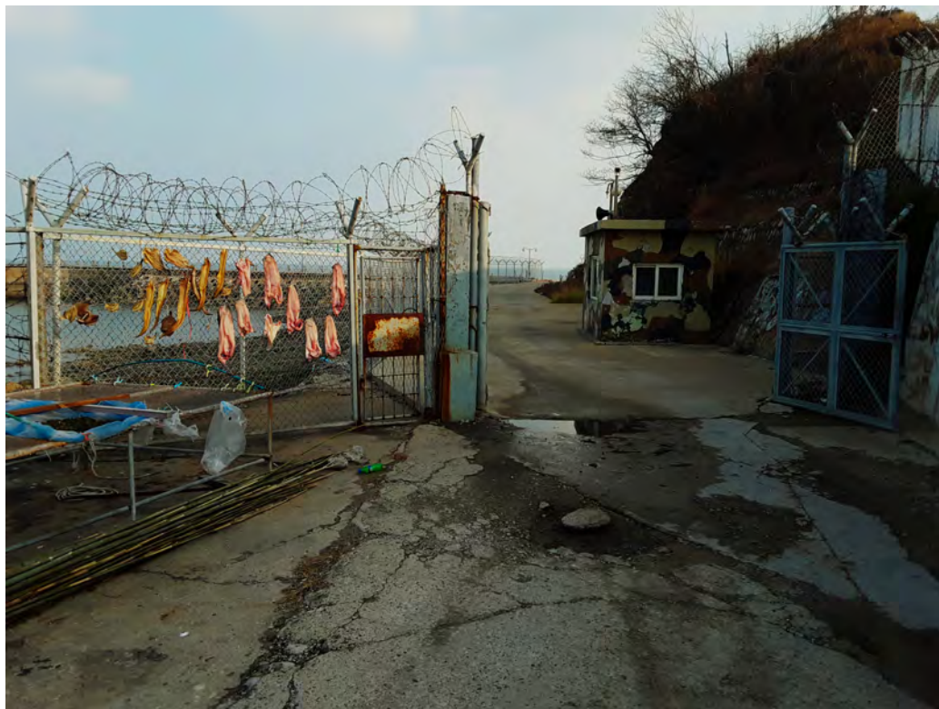
Necessities over fence, 2018