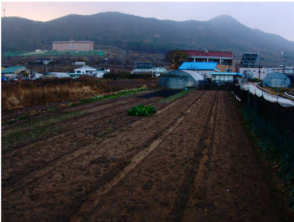
Holding center, 2018