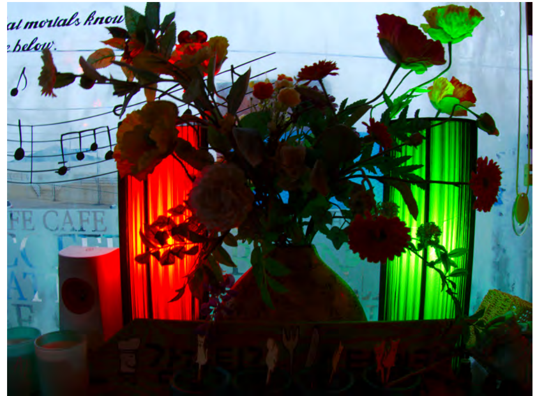
Mortals know, 2018