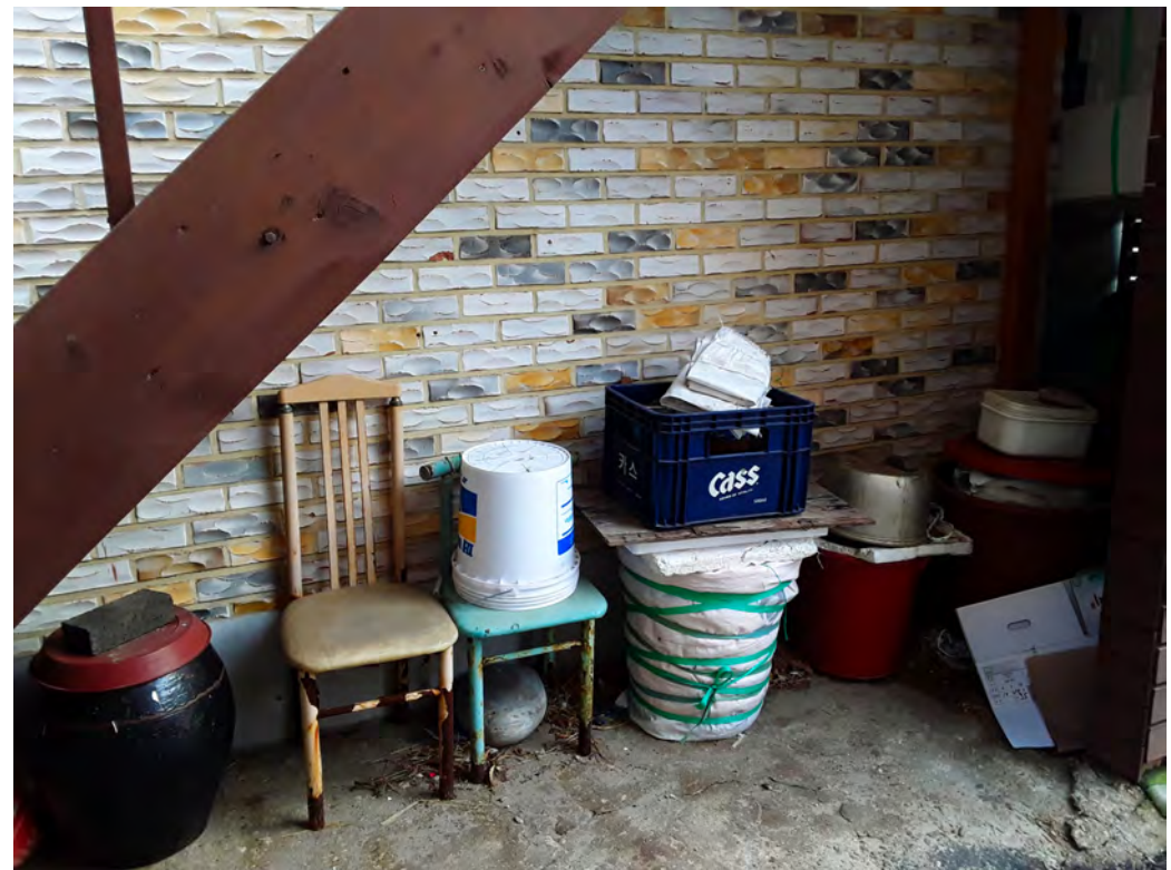
Under the stairs, 2018