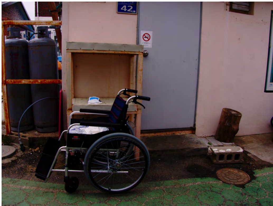
Tanks and chair, 2018