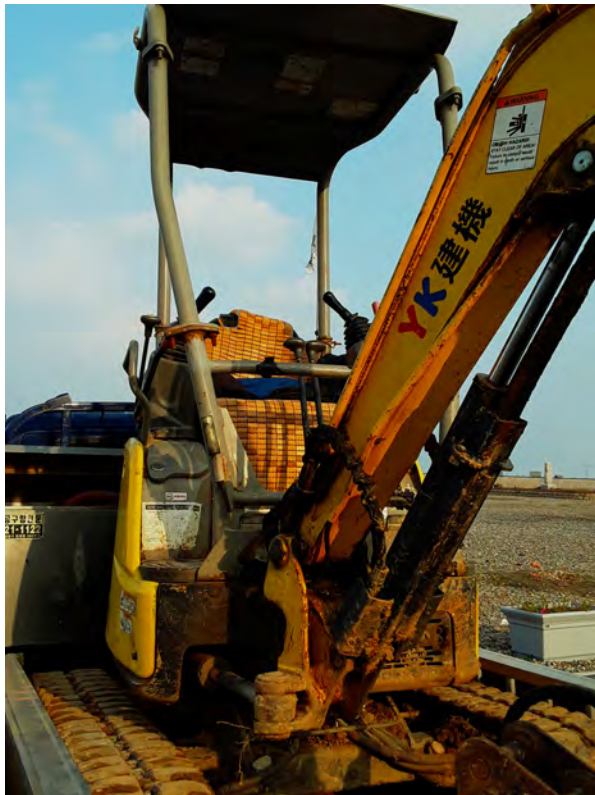
A view of the sea from all sides, 2018