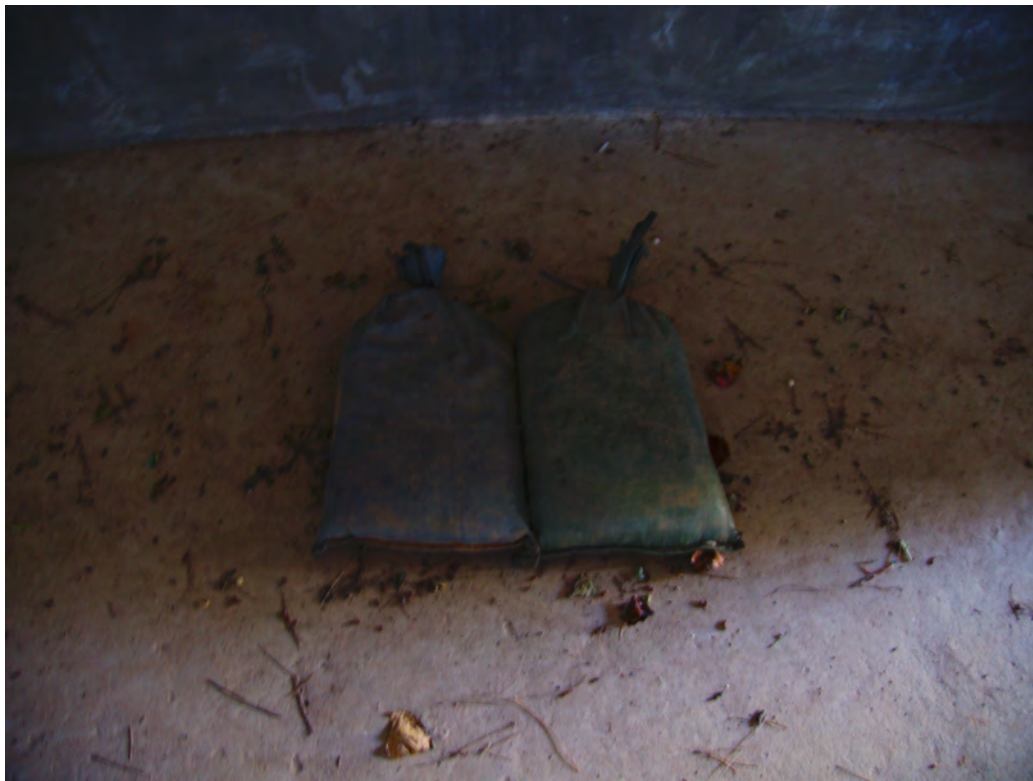
One blue one green, 2018