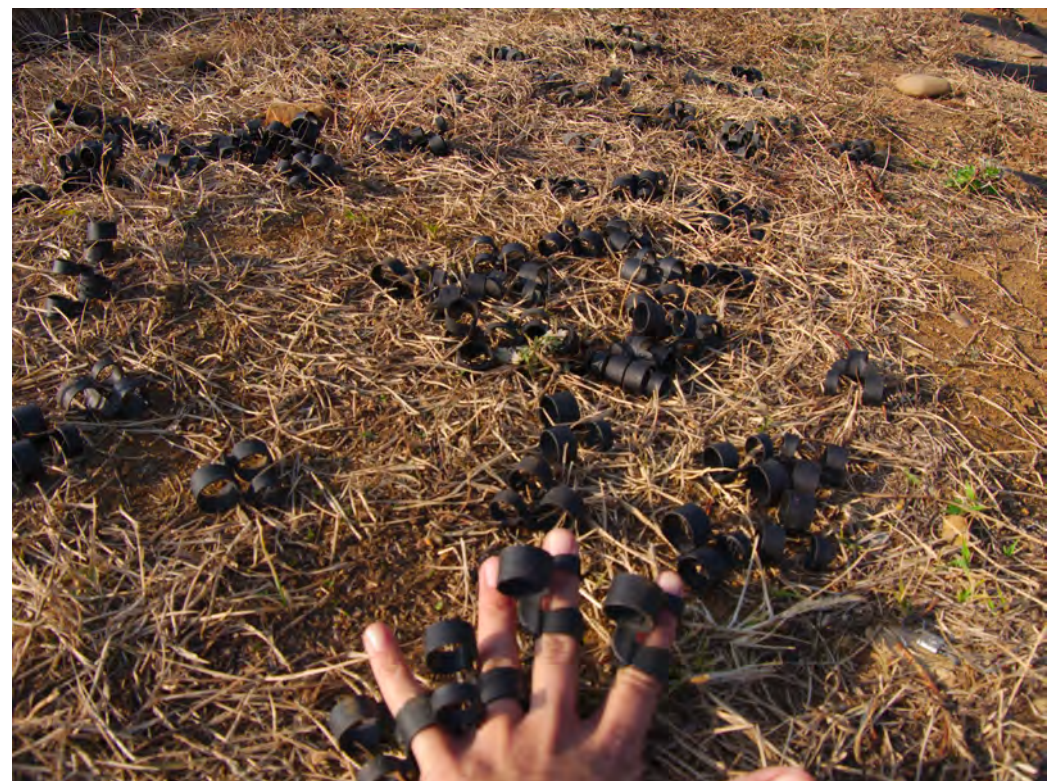
Rifle scope rings, 2018