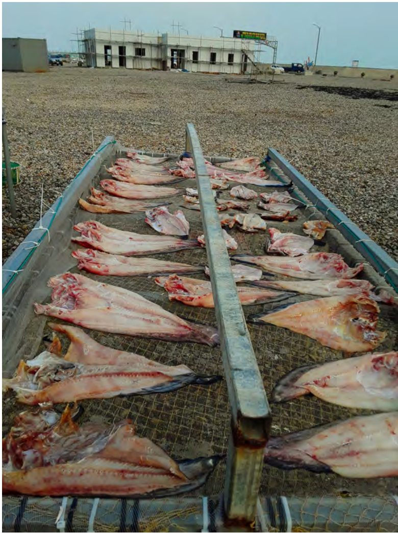
Drying fish, new real estate, 2018