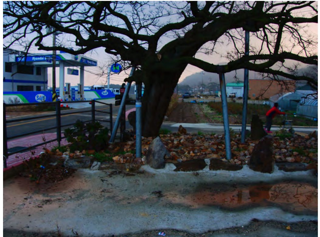
Holding a tree, 2018