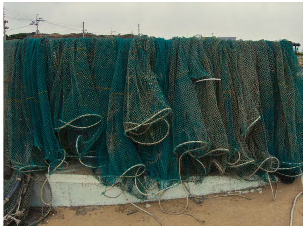
Nets without wind, 2018