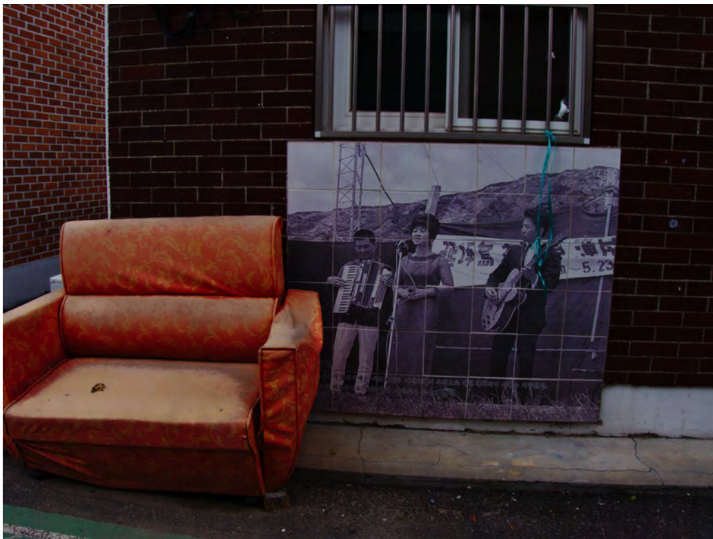
An armchair with memories, 2018