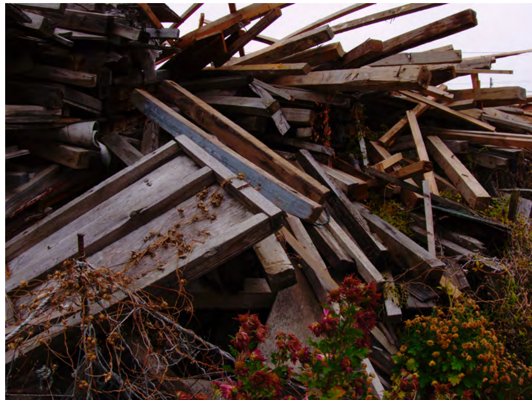
Wood from houses, 2018