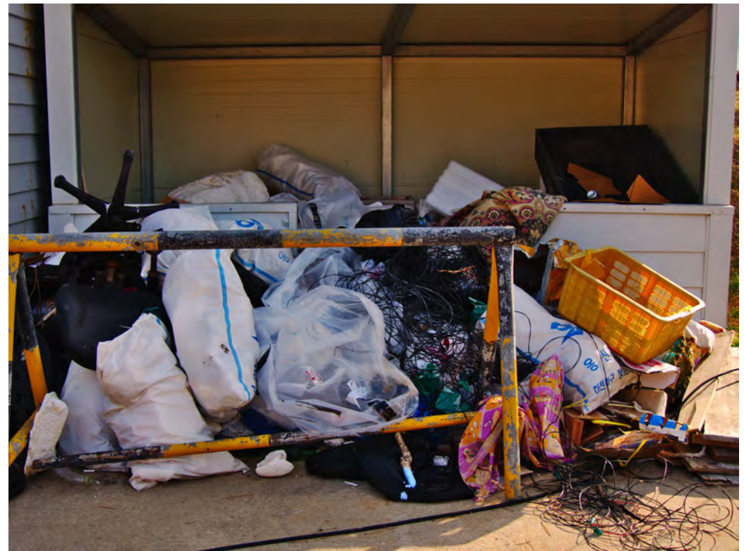
Things wanting to be forgotten, 2018