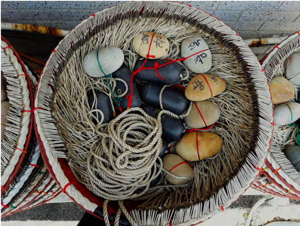
Basket with rocks, 2018