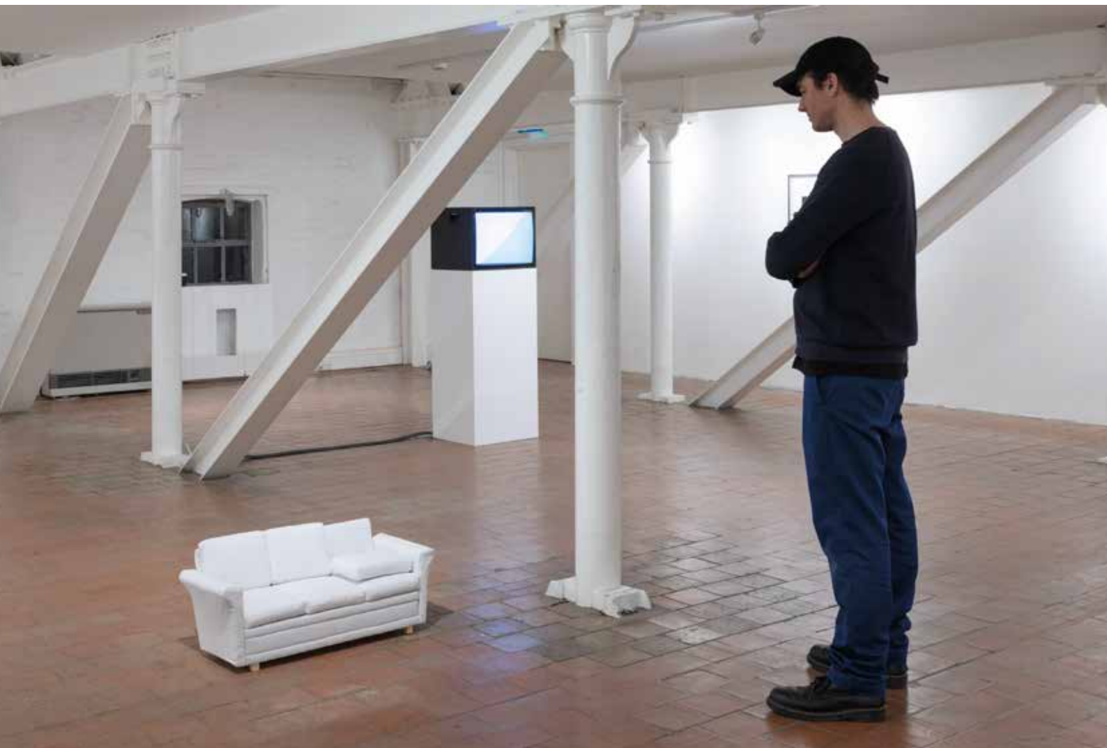
Skull, 2024 Cotton, wadding, timber 28 x 61 x 29cm

In 'Skull', a sofa constructed in perfect miniature sits placidly on the gallery floor. Another very familiar object, this time transformed only in terms of scale. There is something quite serene about this form, inviting us to rest, whilst transforming its surroundings into something gigantic by contrast.