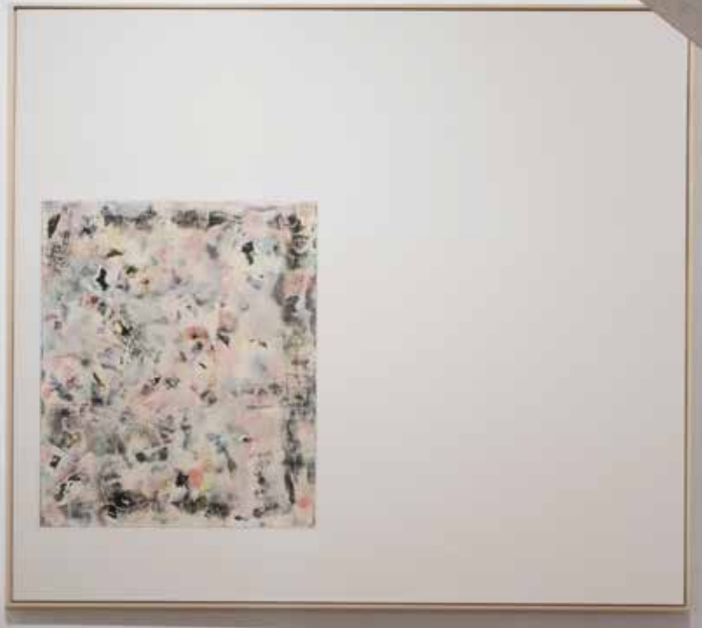
St Michael (XL), 2024 Sugar paper, coloured sand, acrylic paint, acrylic composite 91 x 103cm