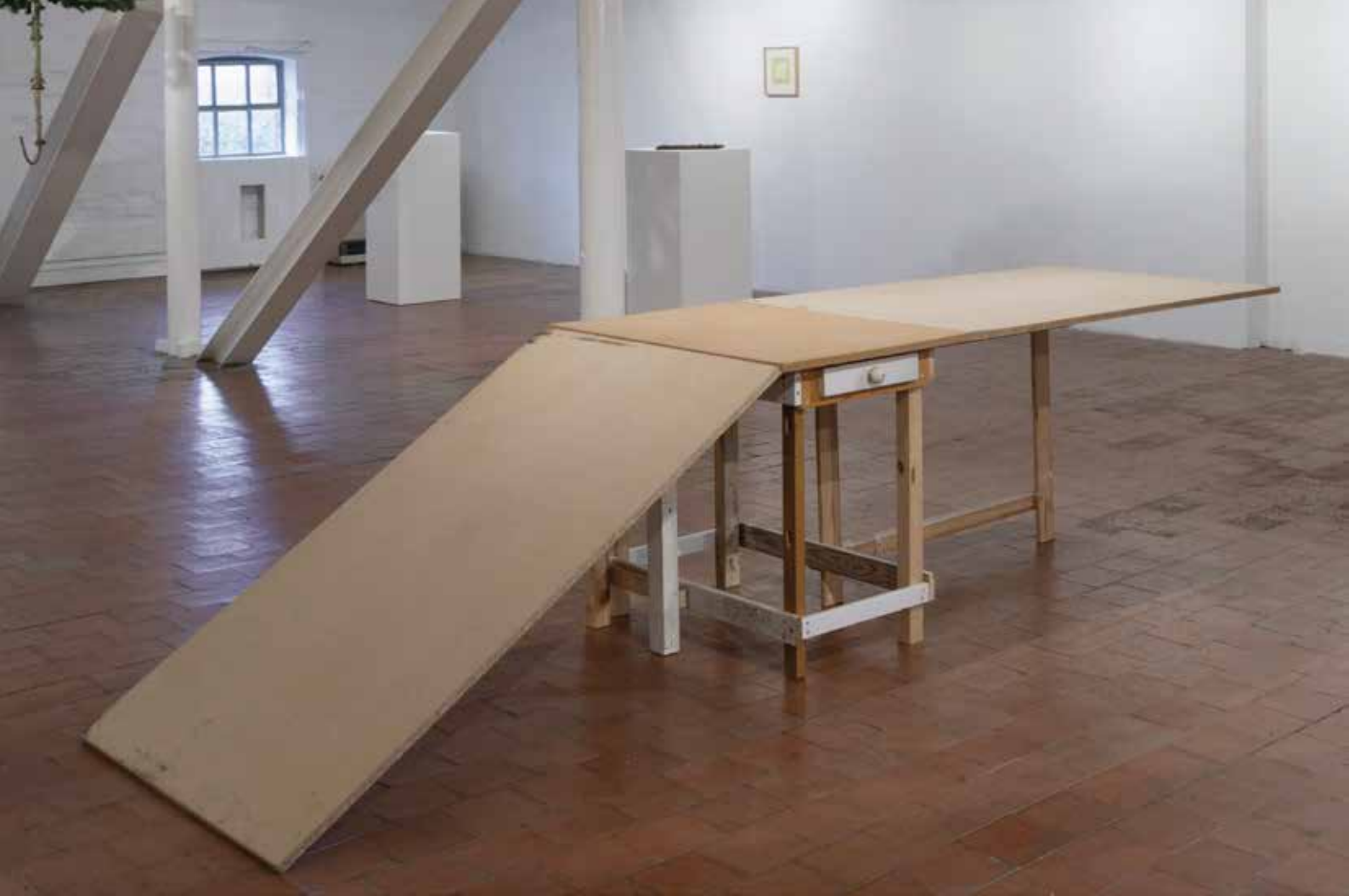
People are Strange, 2024 Chipboard, MDF, plywood, timber, ping pong balls, hardware 74 x 264 x 98cm

In 'People are strange', the familiar form of a classic folding table is stretched somewhat beyond typical dimensions. One side drags absurdly on the floor, like a bird with a broken wing. The eye might at first accept the ping-pong ball as a drawer handle on the side of the table, before we realise that this is an object appropriated from another context, like a stage prop or clown's nose filling in for the real thing. These distortions of a familiar piece of furniture suggest an object recalled through a dream, giving something amusing or disturbing to our perceptions. There is a comedy of estrangement here, producing a distrust of the familiar form, and a demand to look again at the everyday.