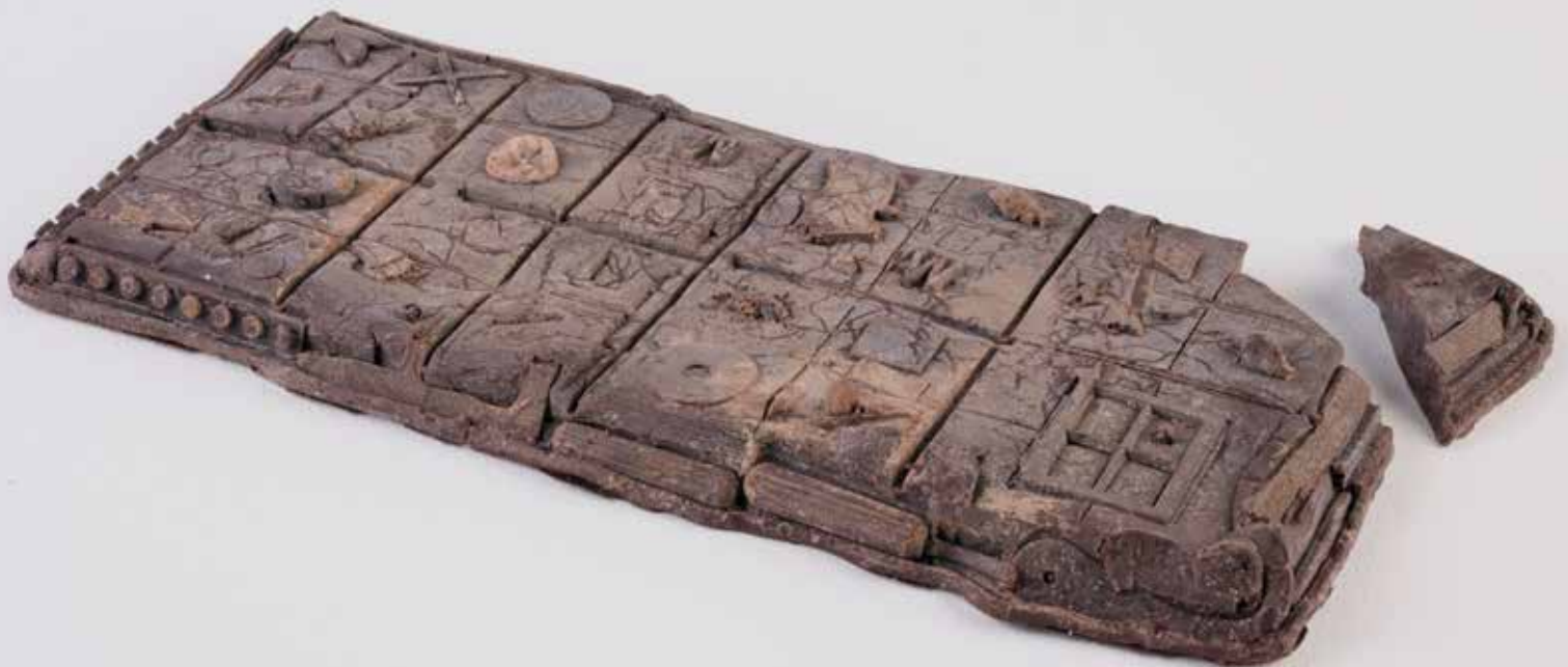
MW, 2024 Chocolate 2.5 x 29 x 13cm

'Cloak, plug, grip, night, chip, ride', presents us with another snack, a bowl of nuts, the bowl itself now absent. These are monkey nuts, walnuts, almonds and brazil nuts in their cases. The colours make it clear that these are replicas formed out of modelling clay. Another form of 'mould' is expressed here, as the nuts are formed into the interior of a container, as though still cradled by its shape.