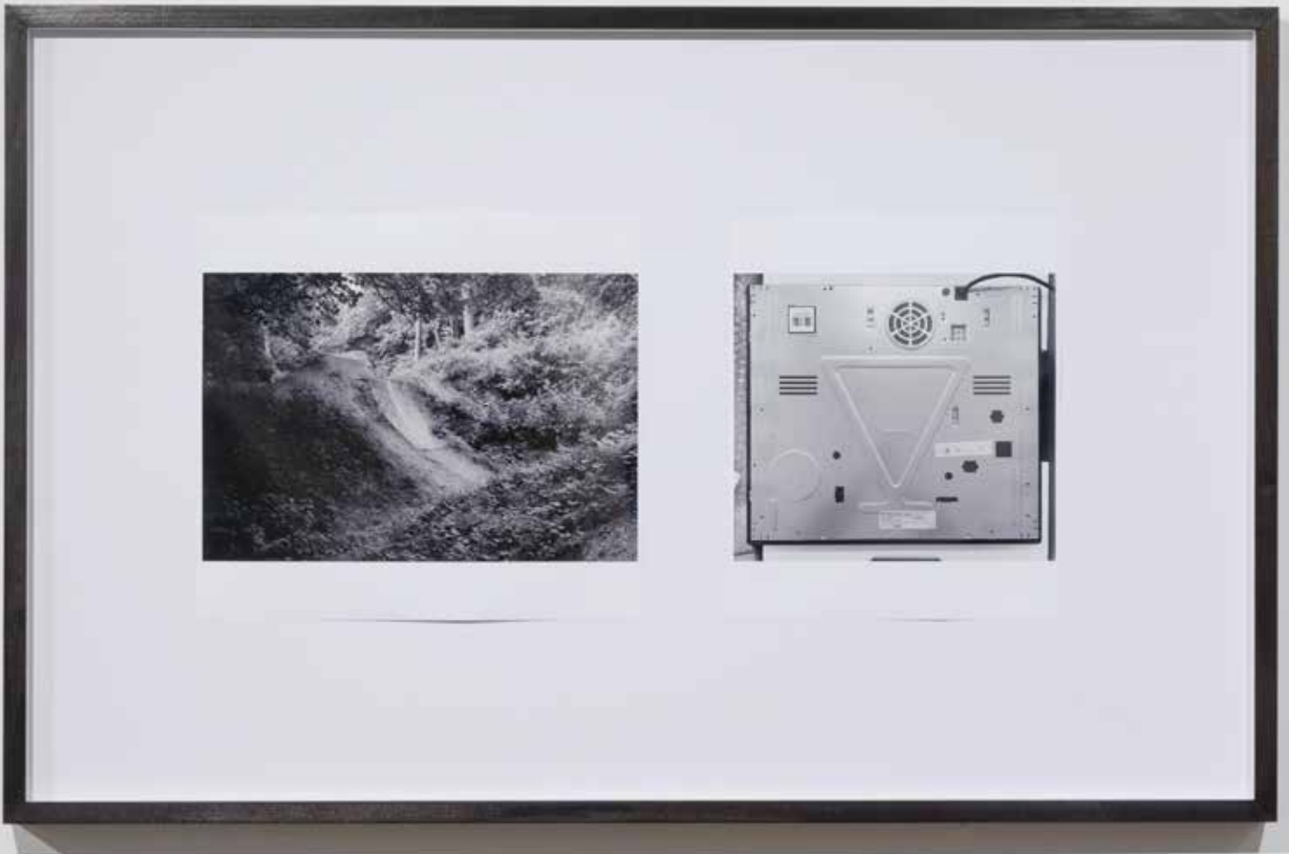
Pictures of Sculptures, 2024 C-type print 51 x 78cm Edition of 1 plus 1 AP

'Pictures of Sculptures', consists of a pair of black and white photographs. In one, the underside of an induction hob is presented as a readymade composition. Vents, screws holes and mild protrusions in an otherwise flat form perhaps again bring to mind the genre of trompe l'oil painting. This sits alongside another photograph, this time a makeshift bike ramp in the woods. This steep form scooped out of the ground and covered with old carpet has clearly been constructed for a particular adrenaline-fueled sport. But here the structure appears outside of this function, as a calm and static form in its own right.