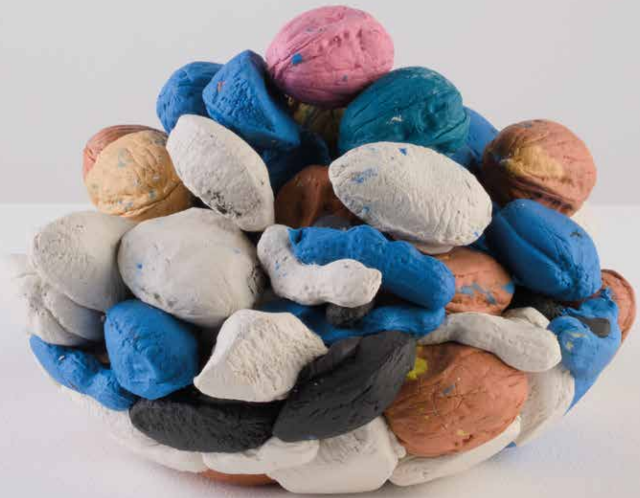
Cloak, plug, grip, night, chip, ride, 2024 Modeling clay 12 x 19 x 19cm