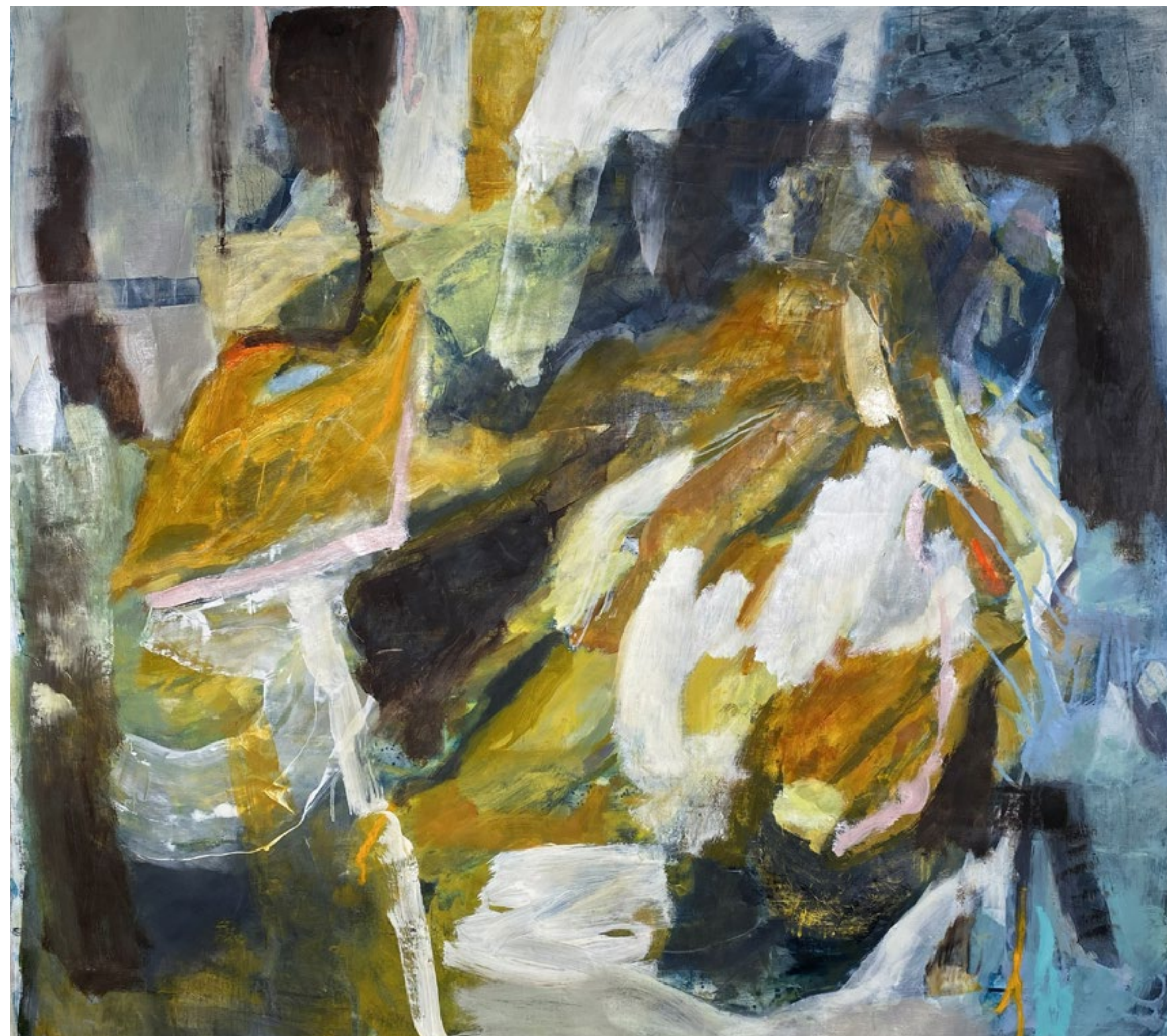
Surface Drift oil on canvas 90 x 70cm 2026