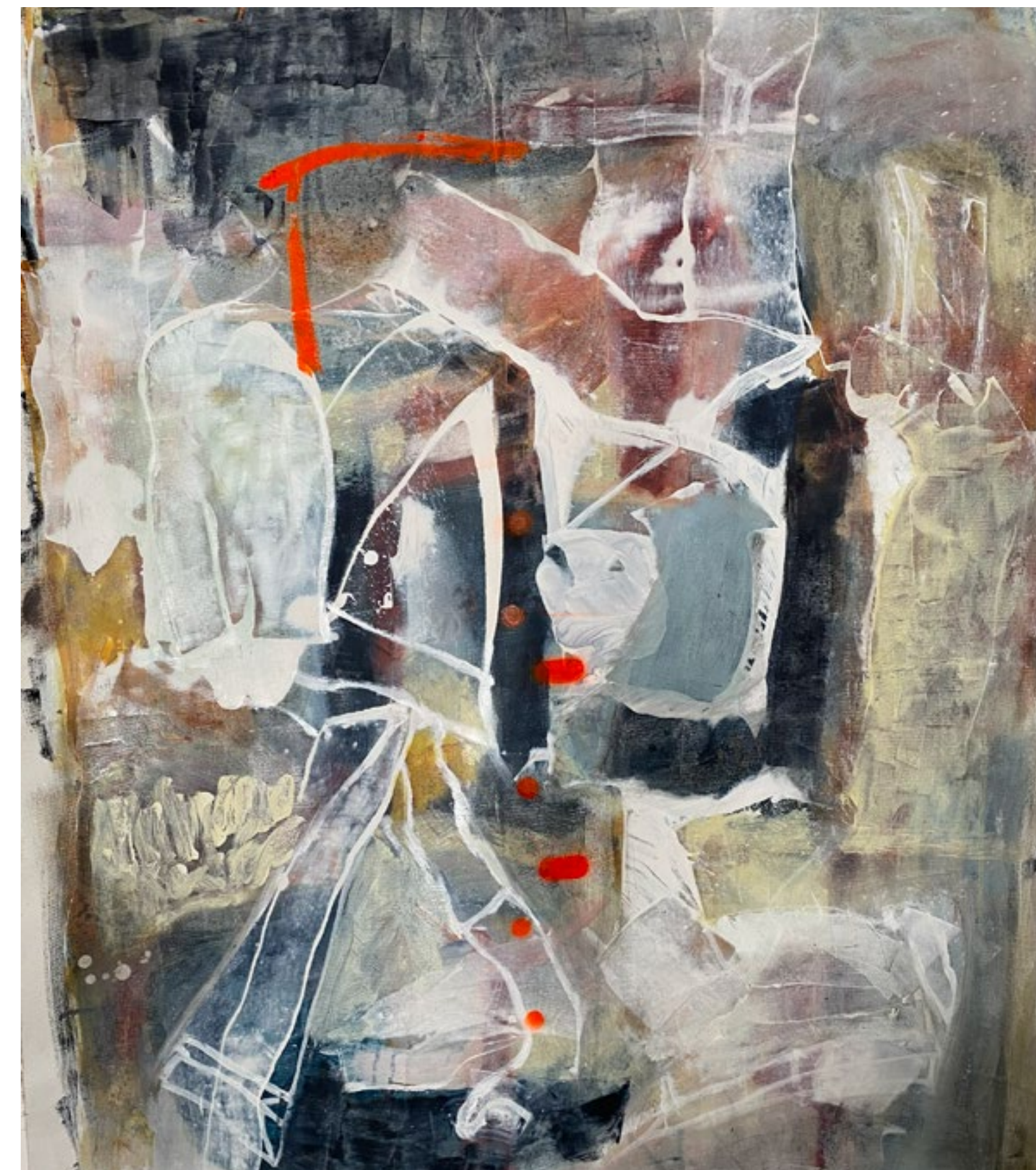
Held in Layer oil on canvas 90 x 70cm 2026