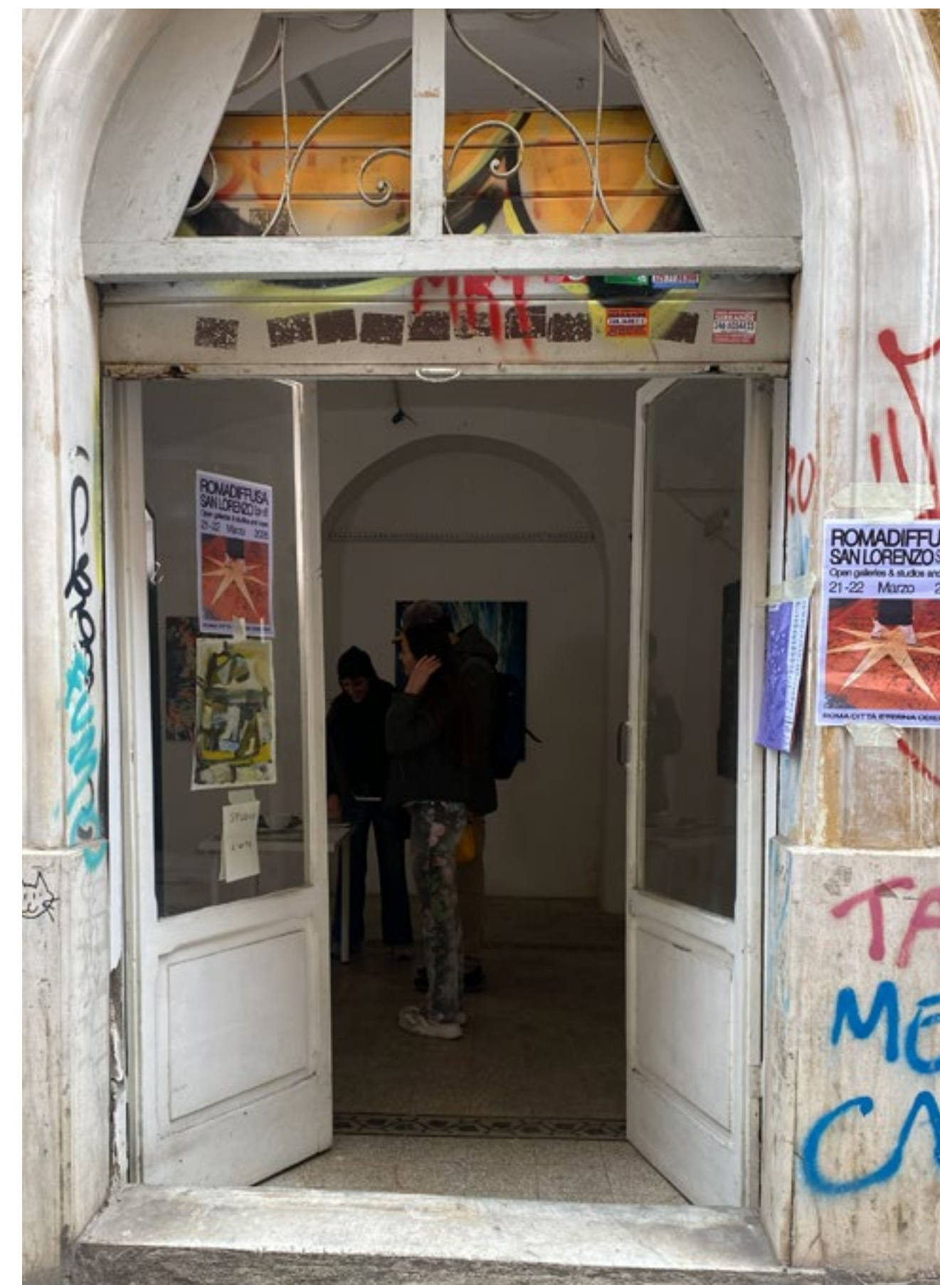
Roma diffusa open studio San Lorenzo