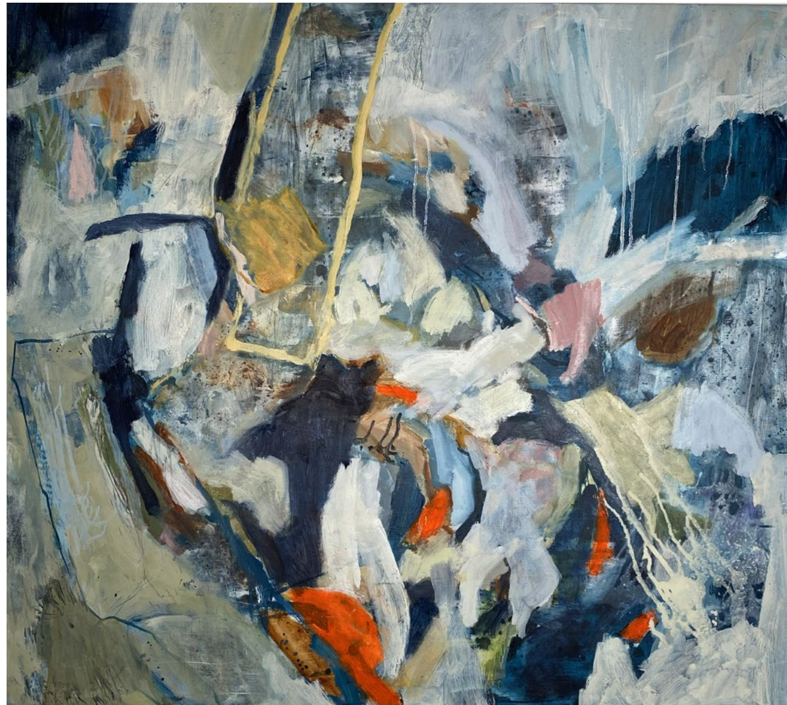
Near Ruin oil on linen 100 x 120cm 2026