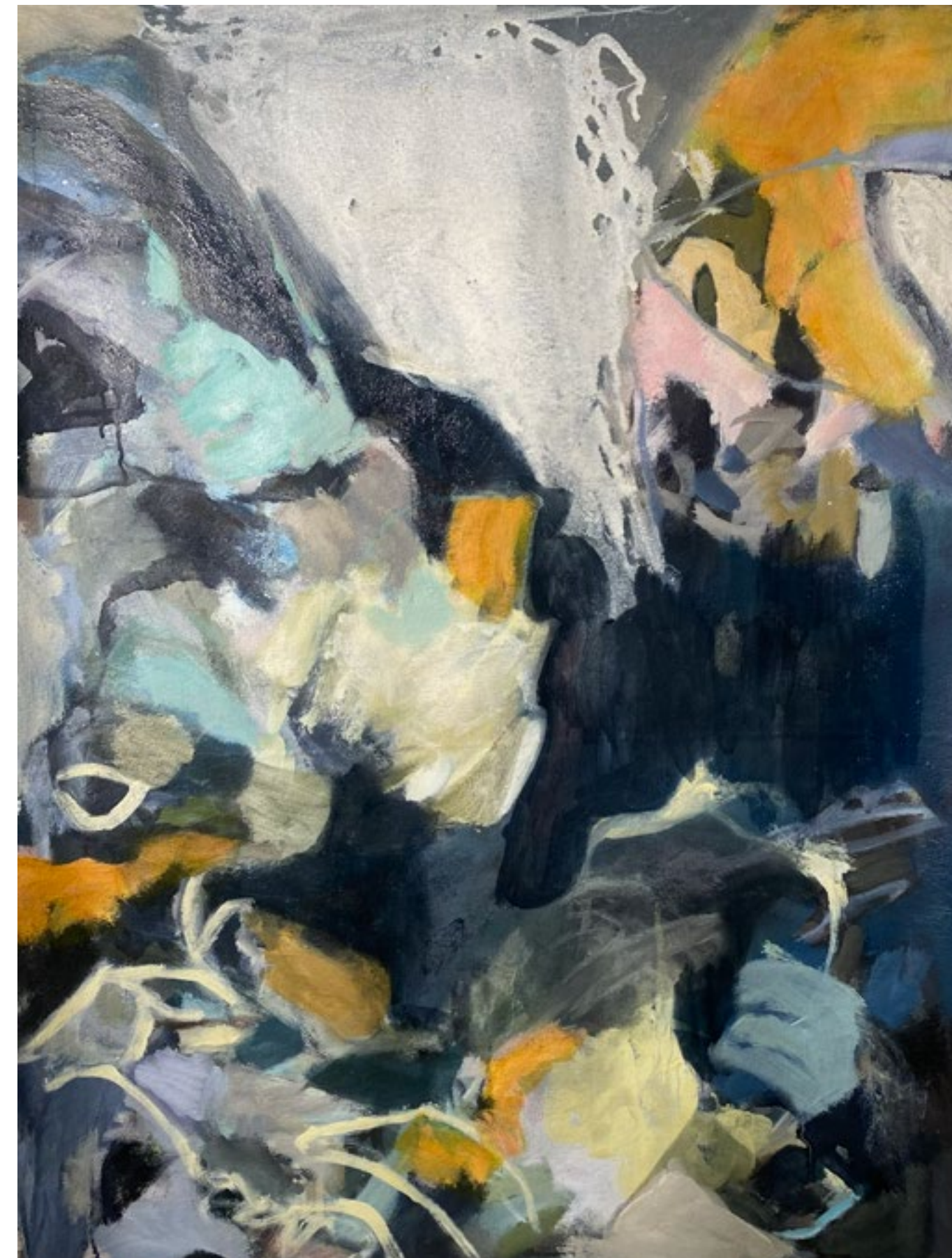
Worn into Place oil on canvas 90 x 70 cm 2025