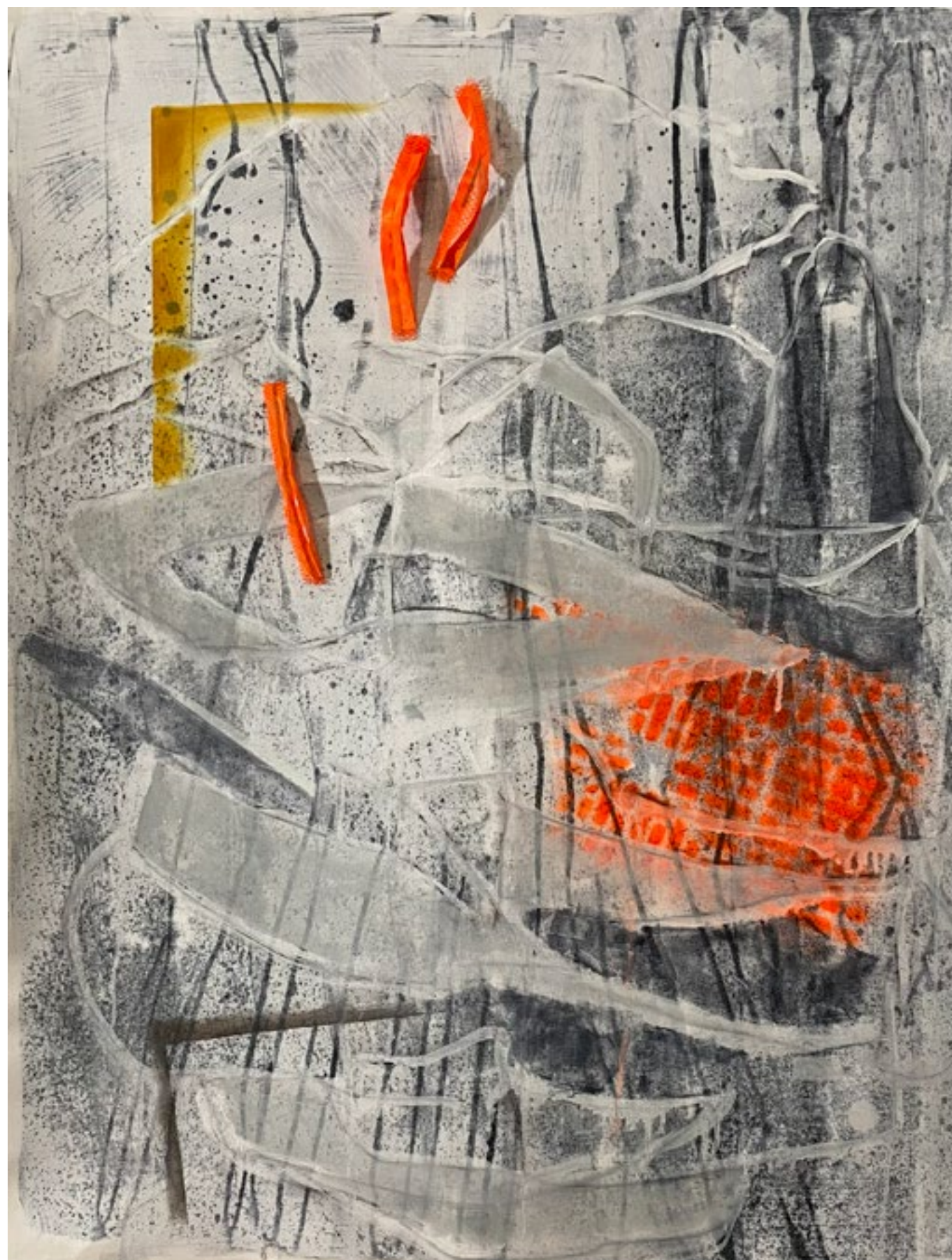
Between Things oil on canvas 90 x 70cm 2026