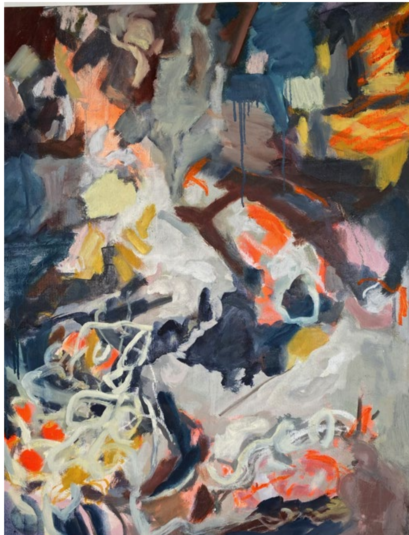
Left over light oil on canvas 90 x 70 cm 2025