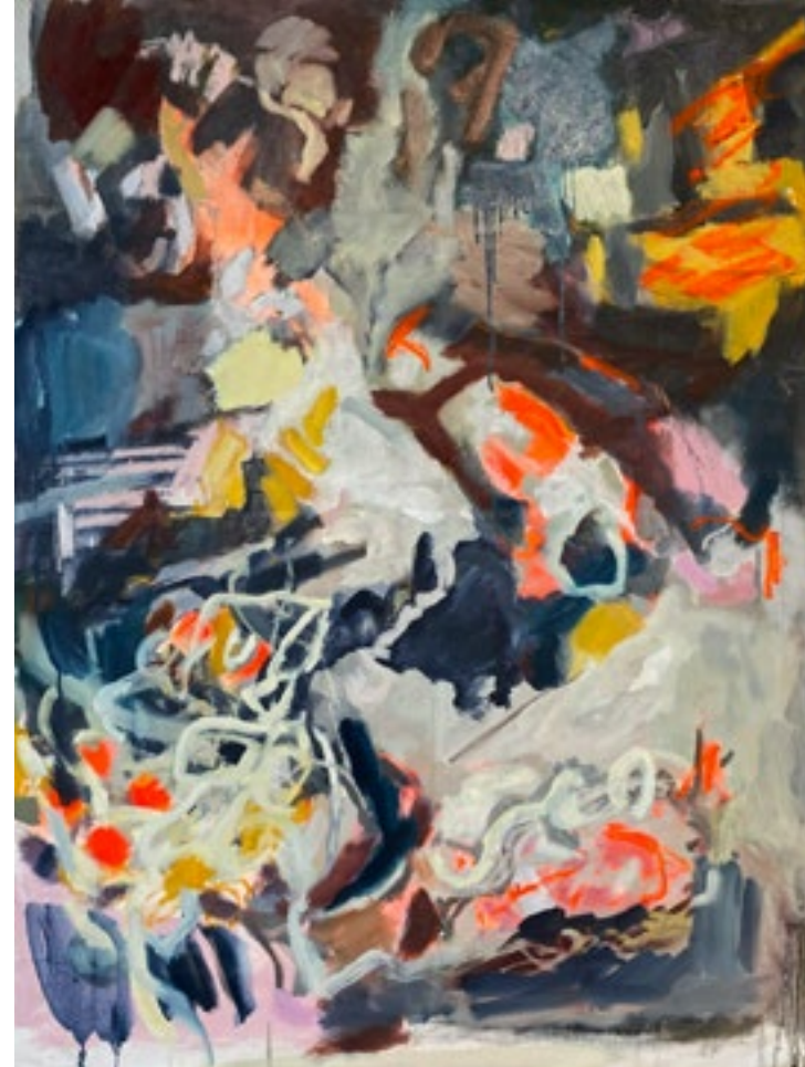
Oil on canvas