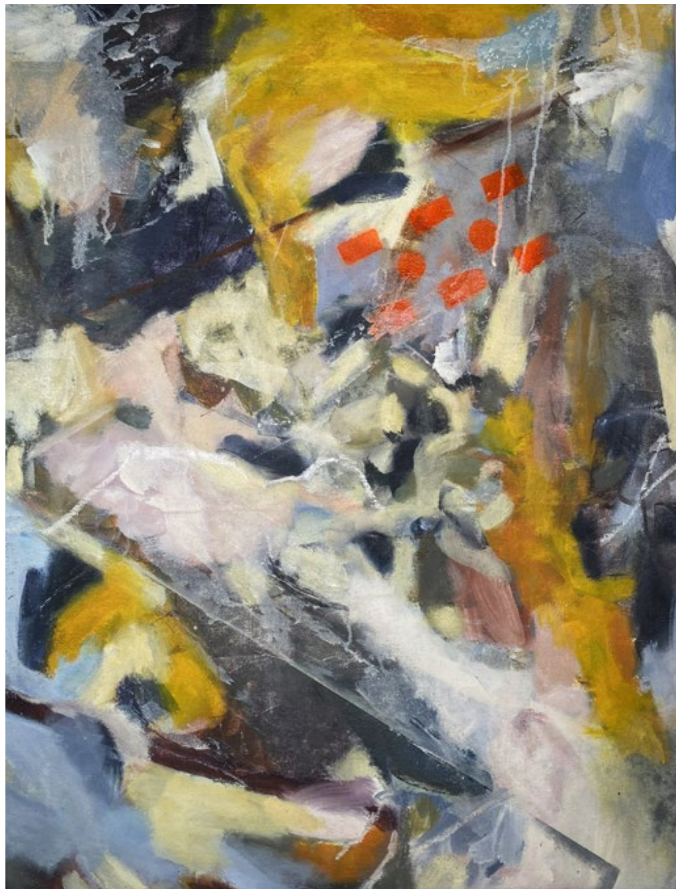
Held quietly oil on canvas 90 x 70cm 2025