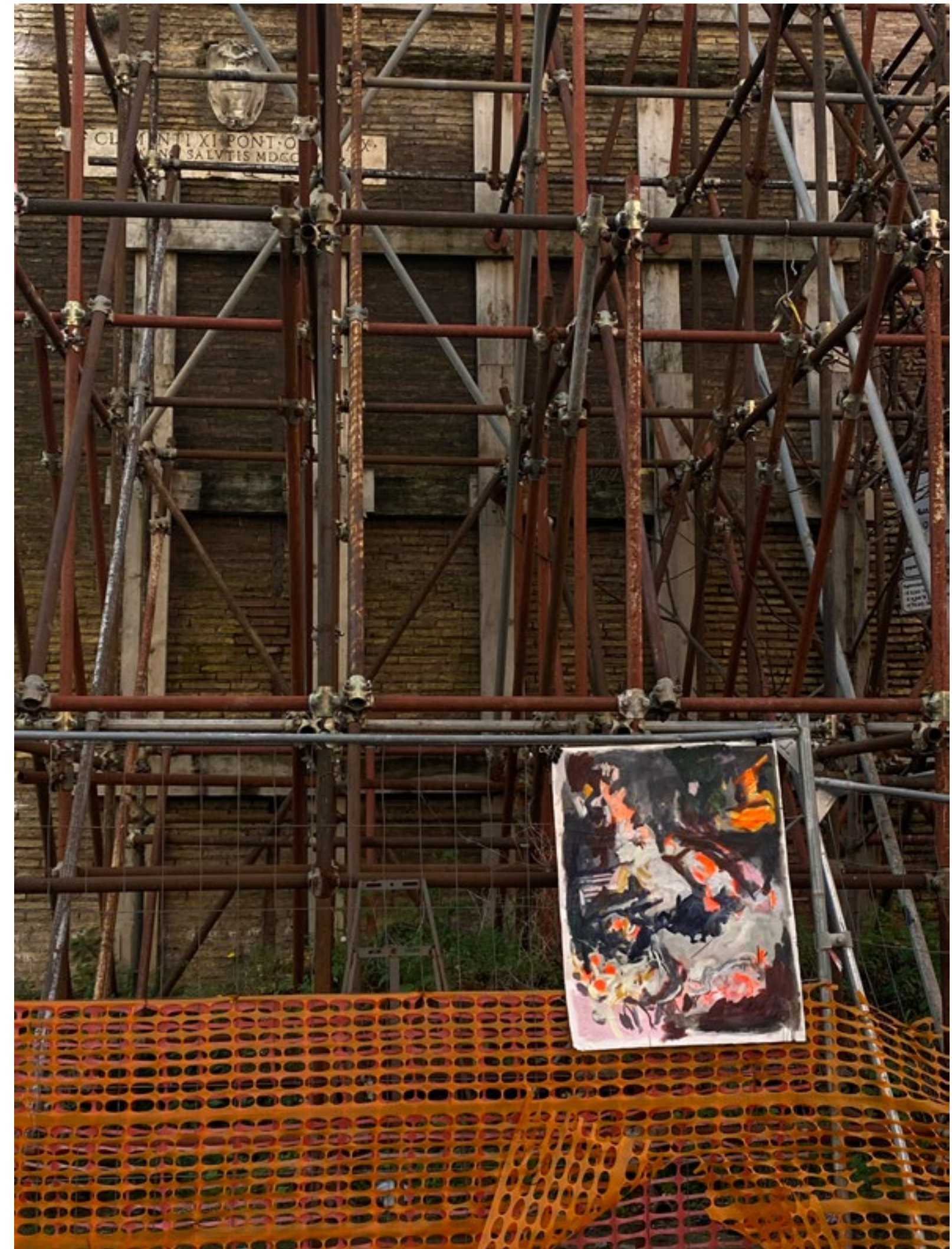
Painting in context