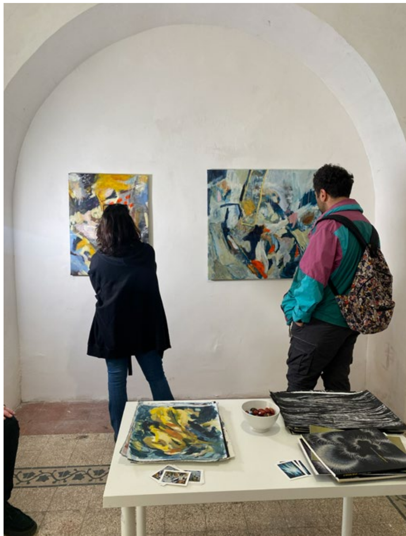
left wall install 2 paintings