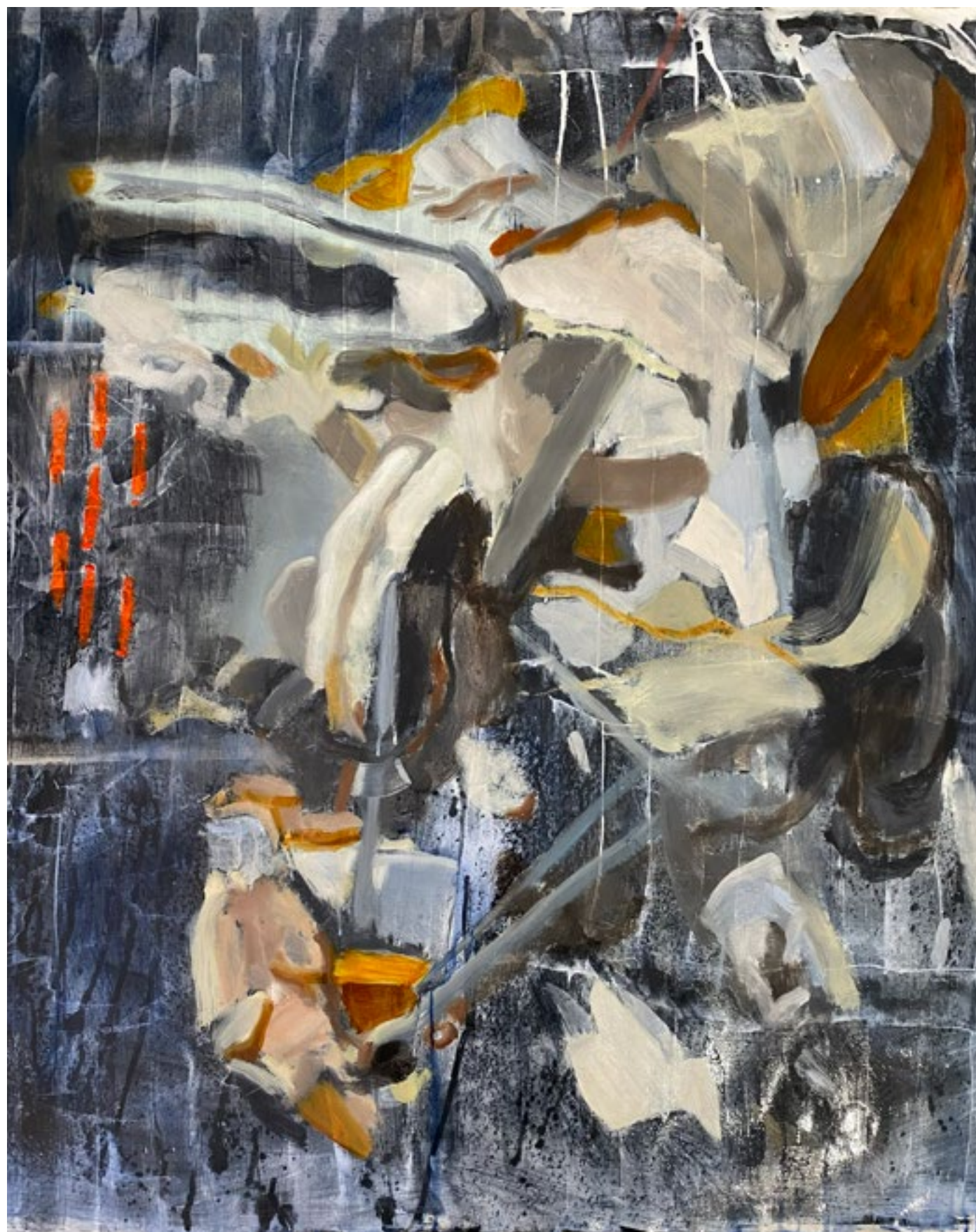
Passing Structure oil on canvas 90 x 70cm 2026