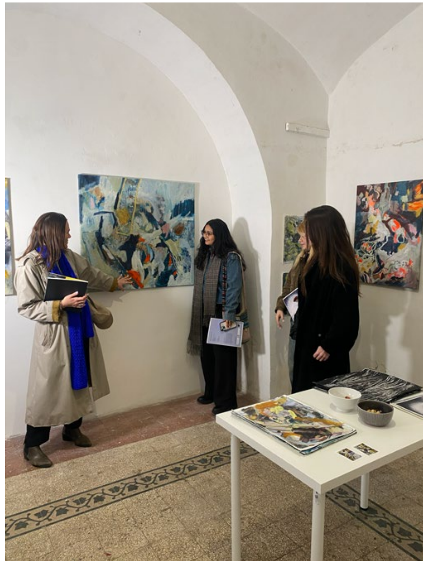
back wall install 1 painting (left)