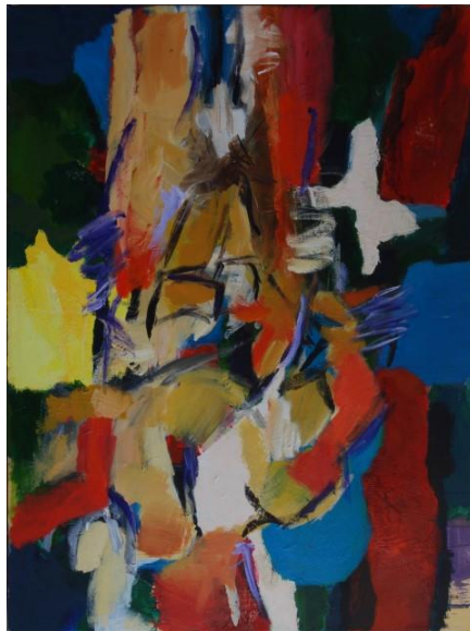
Soldier's Love Acrylic on canvas, 48" x 36", 2016