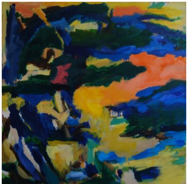
In Praise of Love Acrylic on canvas, 50" x 50", 2016