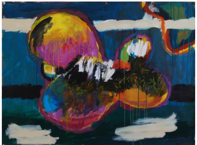
Les Fleurs du Mal 2 Acrylic on paper, 31" x 43", 2015