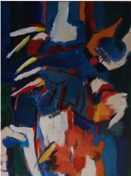
Orfeo Acrylic on canvas, 48"x 36", 2016