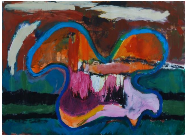
Les Fleurs du Mal 1 Acrylic on paper, 32" x 43" 2015