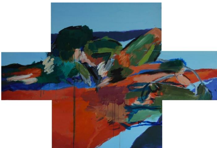
El Beso , acrylic on wood, 53" x 79", 2016