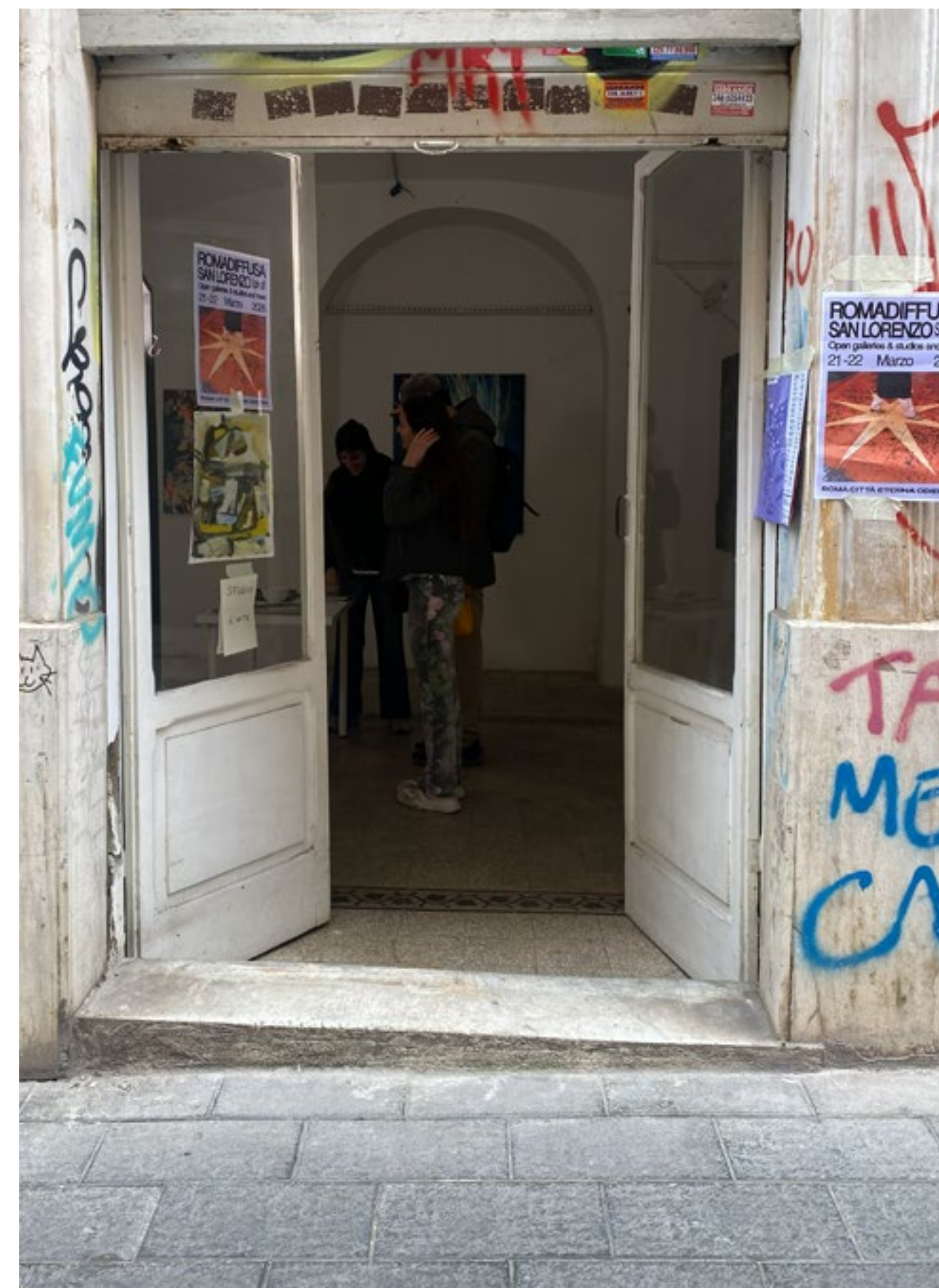
Roma diffusa open studio San Lorenzo