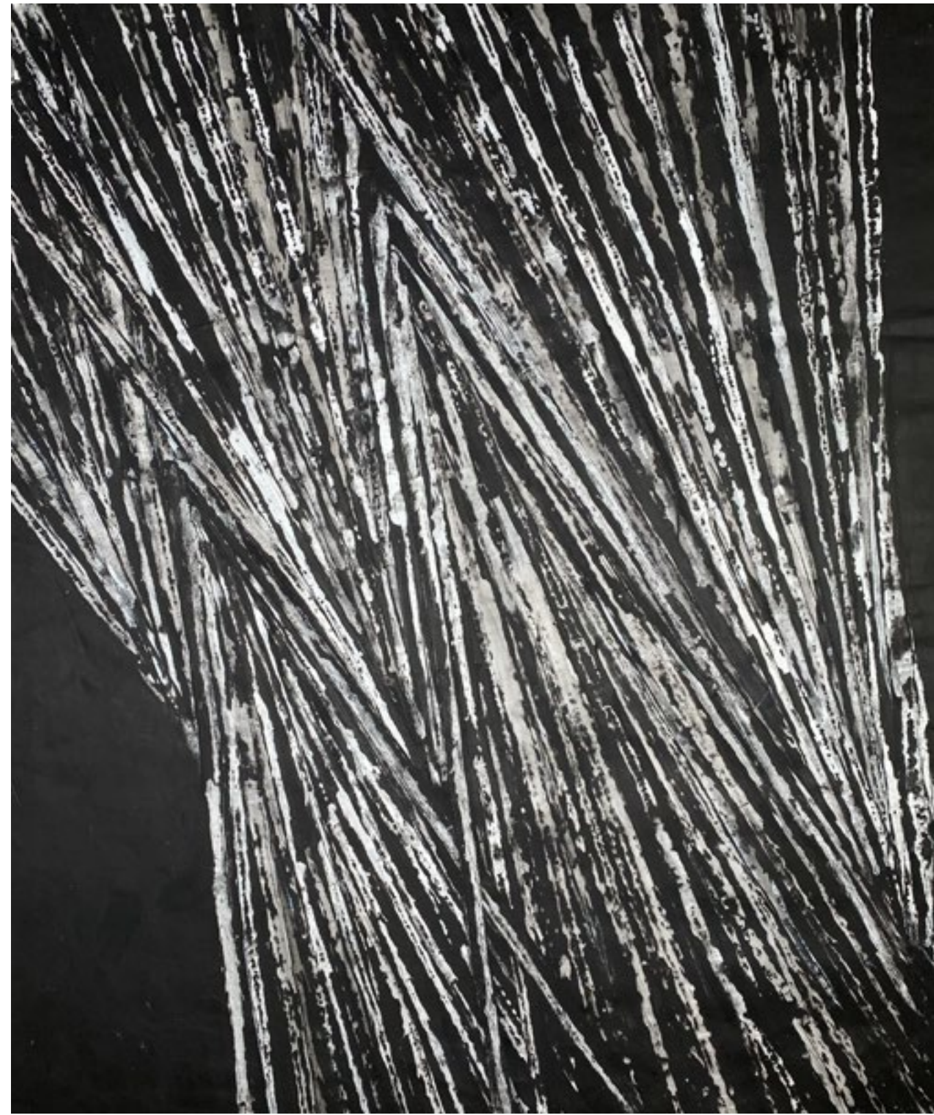
Untitled gesso on linen 111 x 100 cm 2026