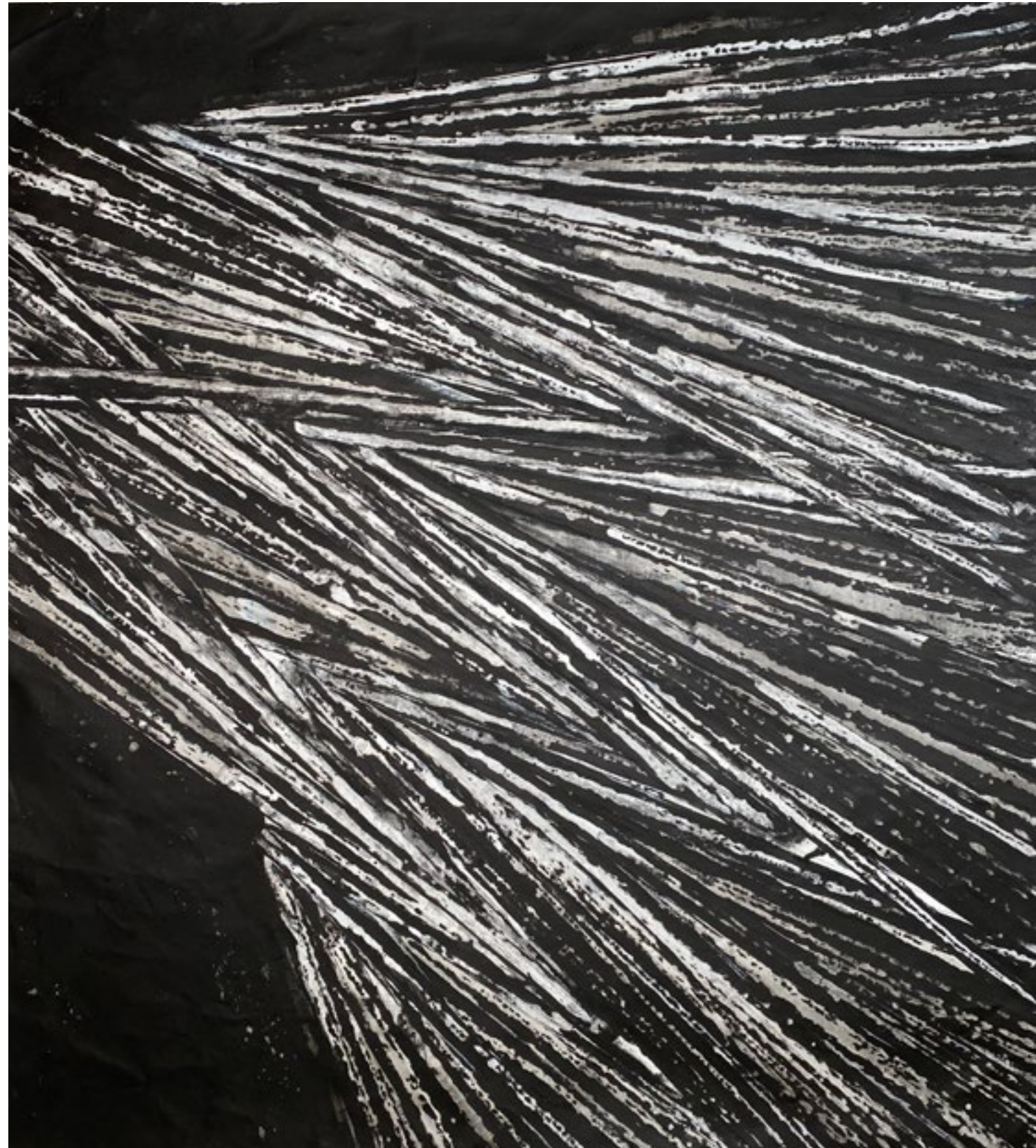
Untitled gesso on linen 120 x 100 cm 2026