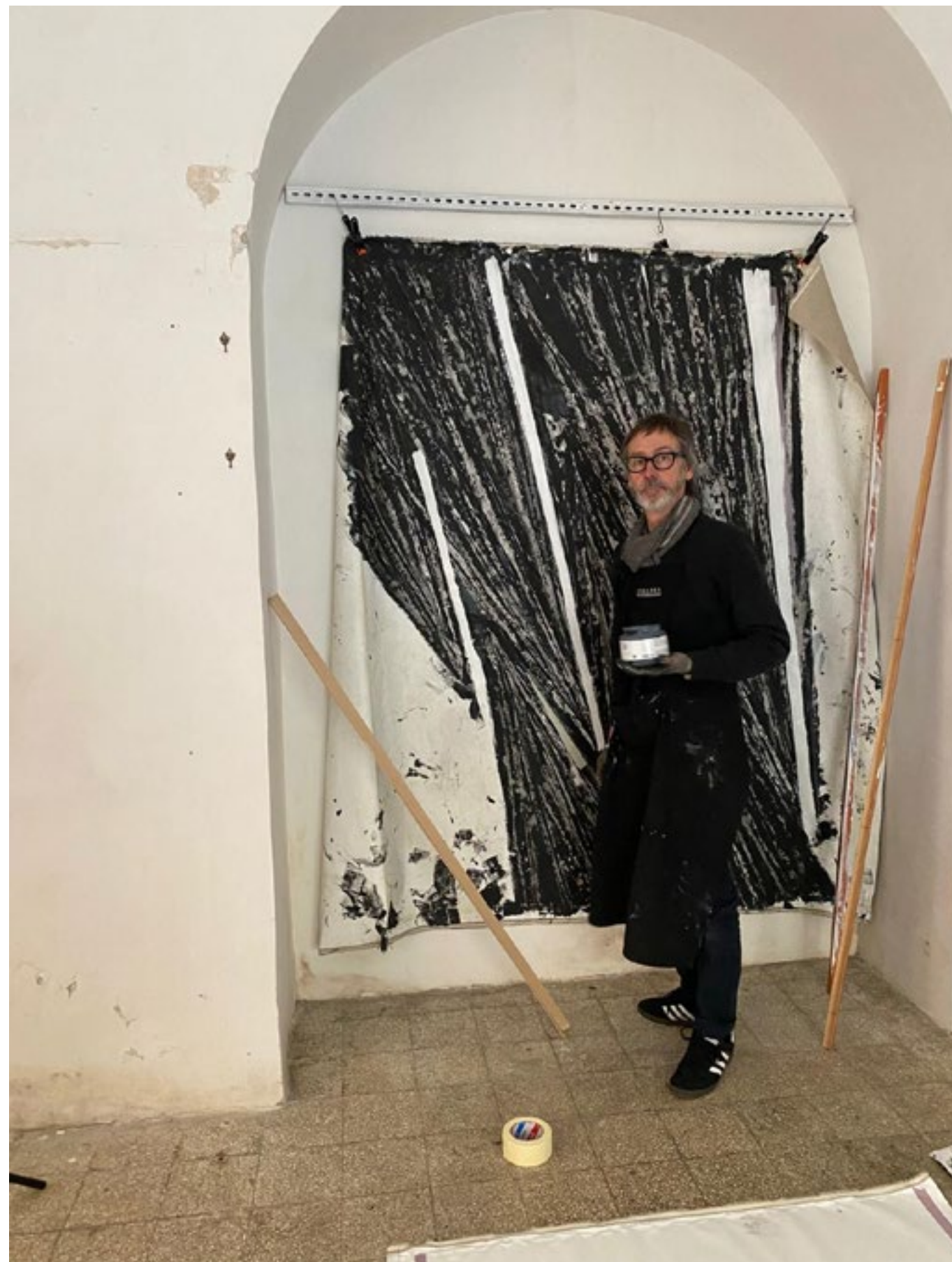
back wall install 1 painting