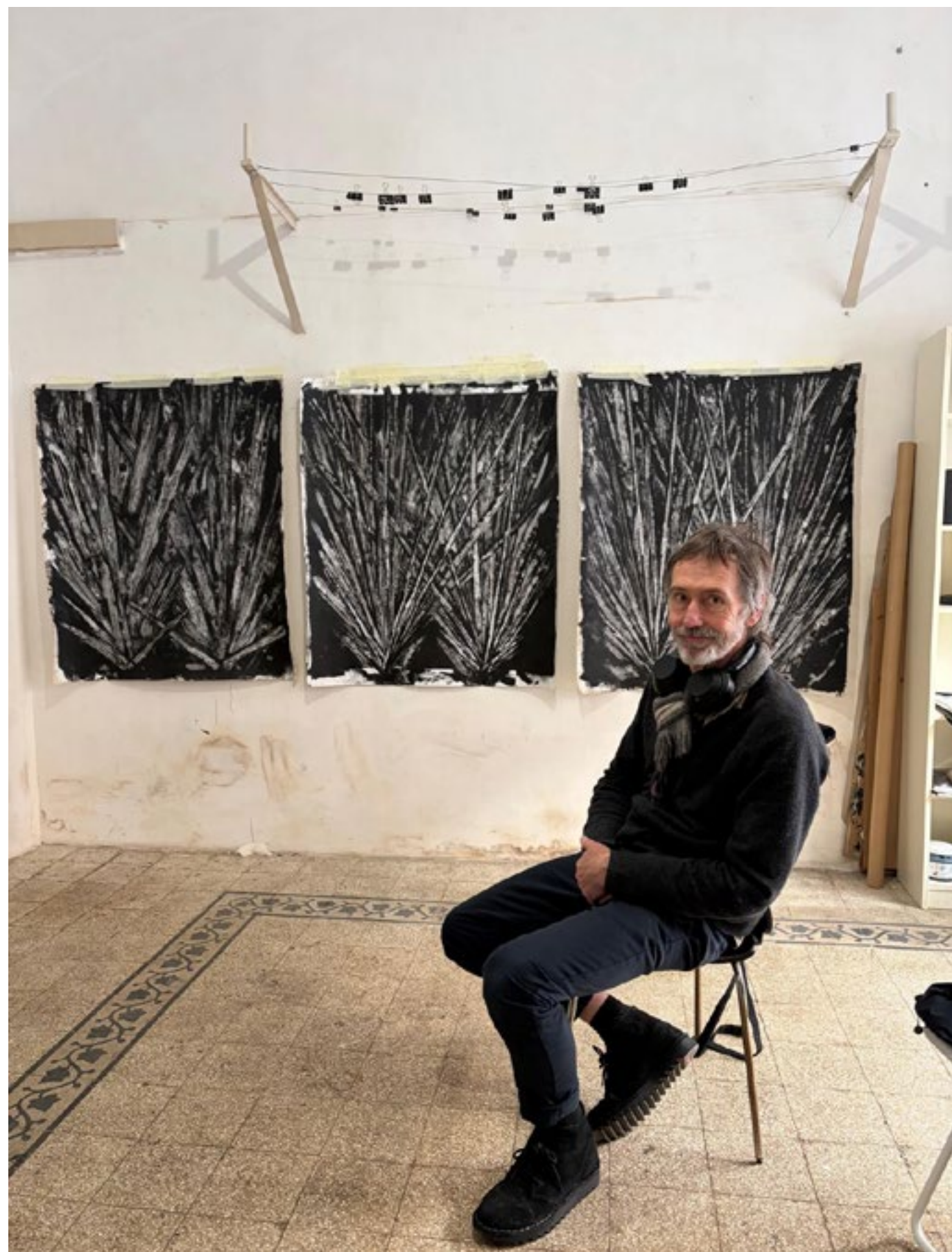
right wall 3 paintings