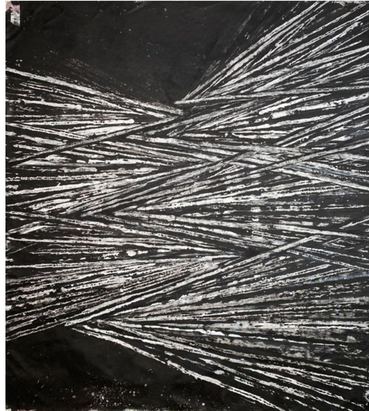
Untitled gesso on linen 120 x 100 cm 2026