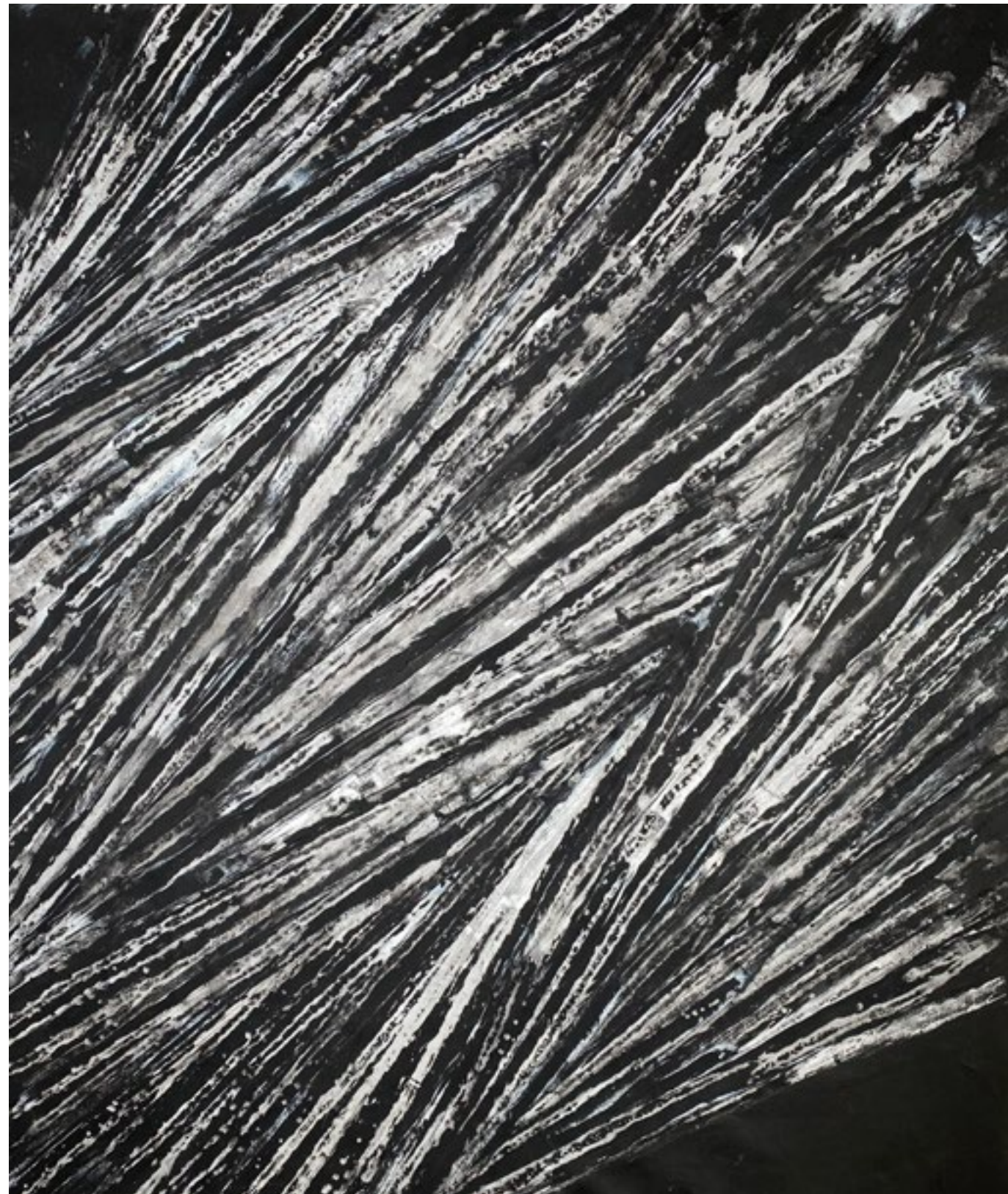
Untitled gesso on linen 111 x 100 cm 2026