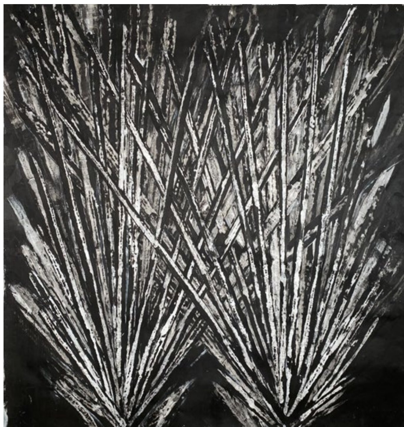
Untitled gesso on linen 120 x 100 cm 2025/26