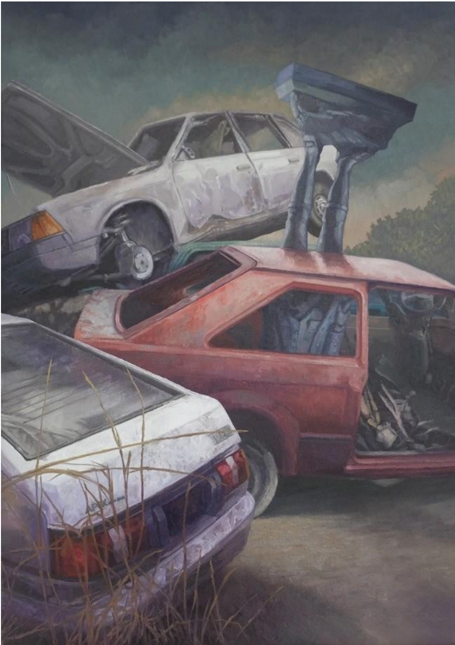
Jarrad Martyn, Narrative, 2021. Oil on canvas, 90 x 60 cm. $3000