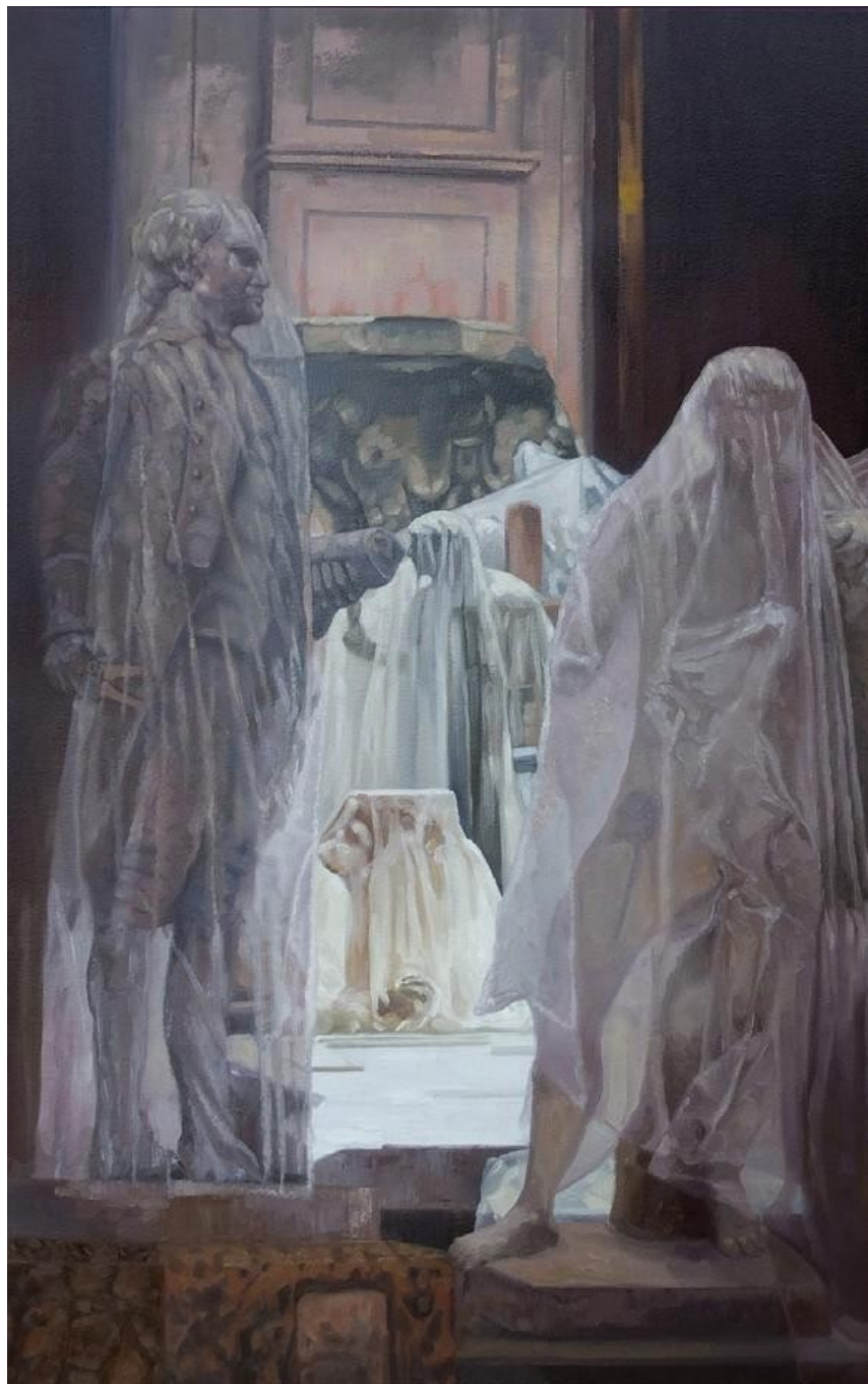
Jarrad Martyn, Storage, 2024. Oil on canvas, 86 x 56 cm. $3000