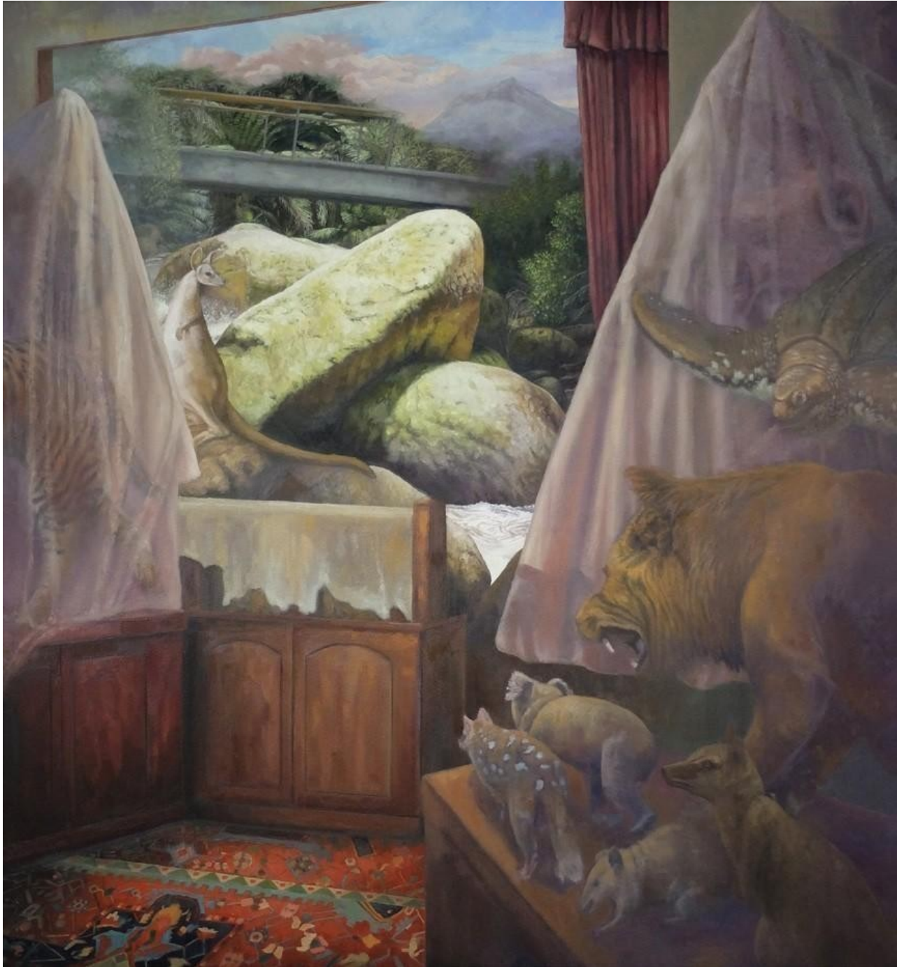
Jarrad Martyn, West, 2022. Oil on canvas, 89 x 93 cm. $4000