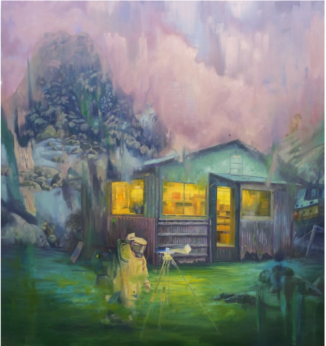
Jarrad Martyn, Endurance , 2024. Oil on canvas, 160 x 149 cm. $8000