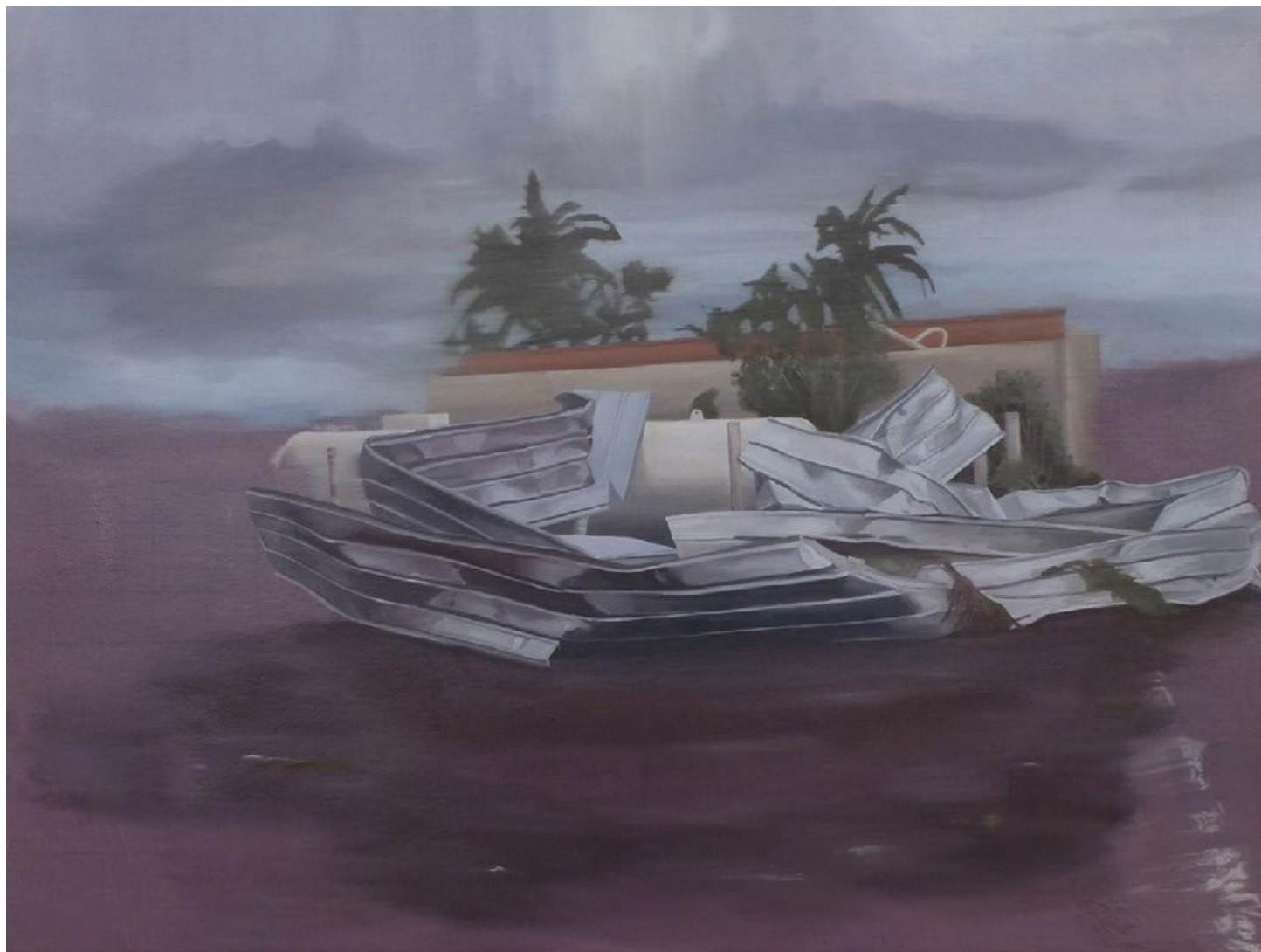
Jarrad Martyn, All Seasons , 2017. Oil on canvas, 57 x 78 cm. $3000