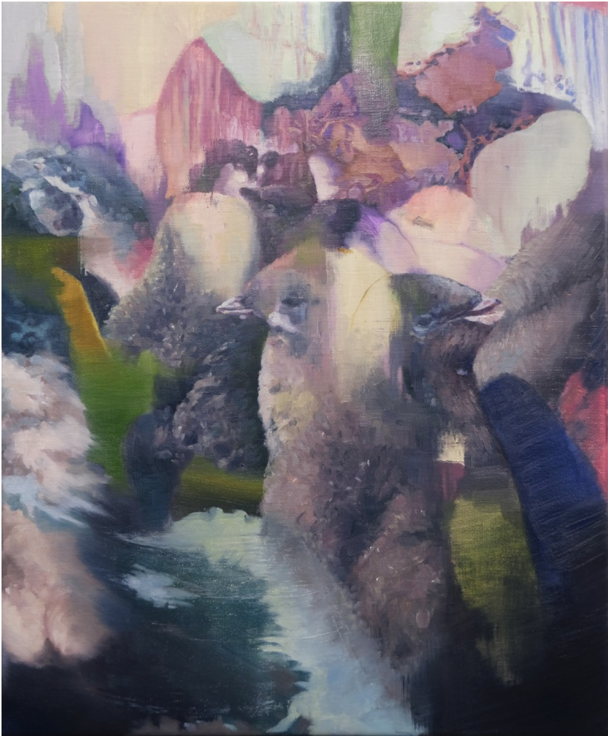
Jarrad Martyn, Sojourner , 2024, Oil on linen. 37 x 31 cm. $1650