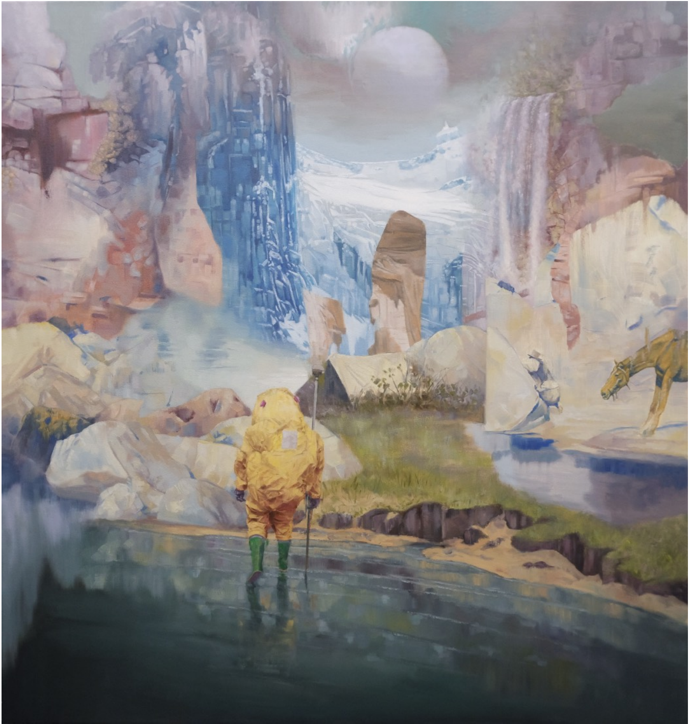
Jarrad Martyn, Parables & Paradoxes, 2024. Oil on canvas, 155 x 145 cm. $8000