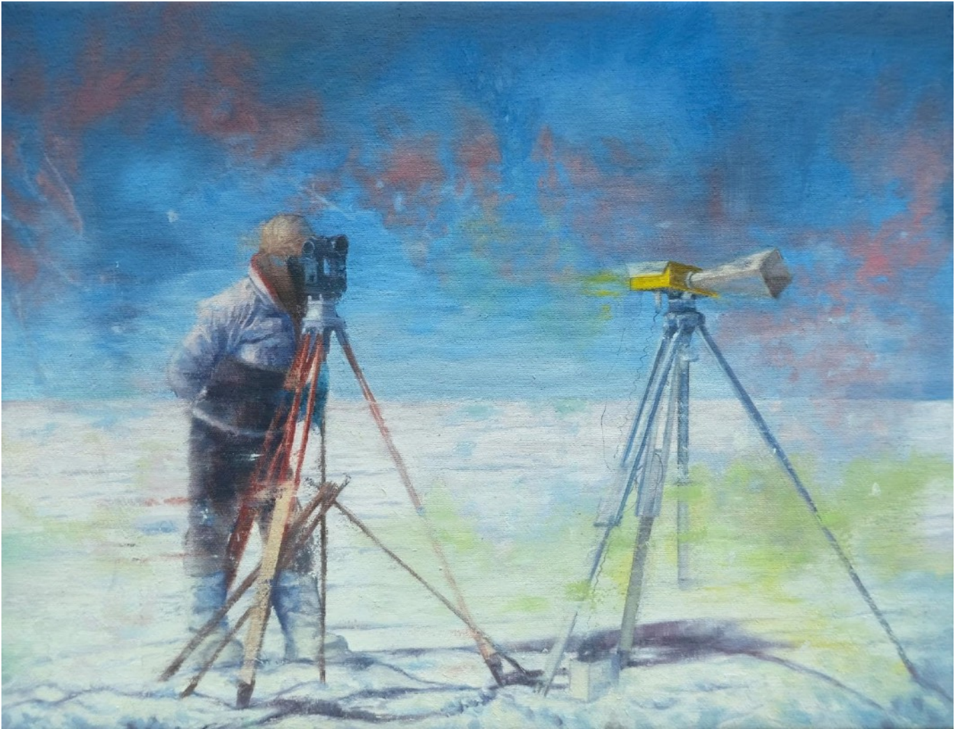
Jarrad Martyn, Conditions of Land , 2022. Oil on canvas, 31 x 41 cm. $1700