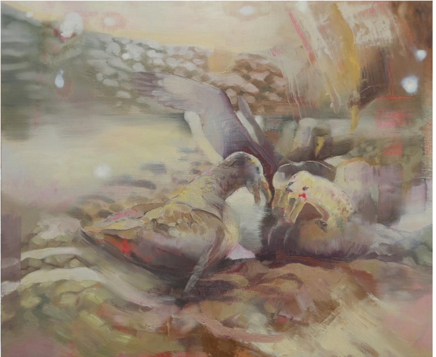
Jarrad Martyn, Bone-Shaker, 2024. Oil on board, 24 x 29 cm. $1300