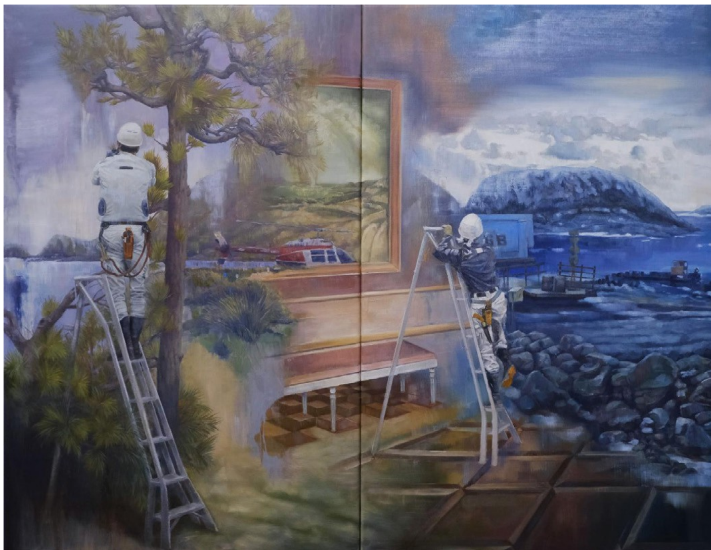
Tsukiyama, 2025. Oil on linen, 87 x 55 cm each 87 x 110 cm diptych SOLD