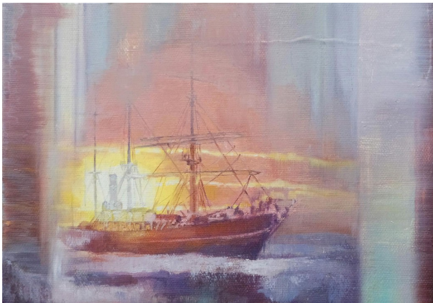
Hurley, 2025. Oil on linen, 16 x 23 cm $1500