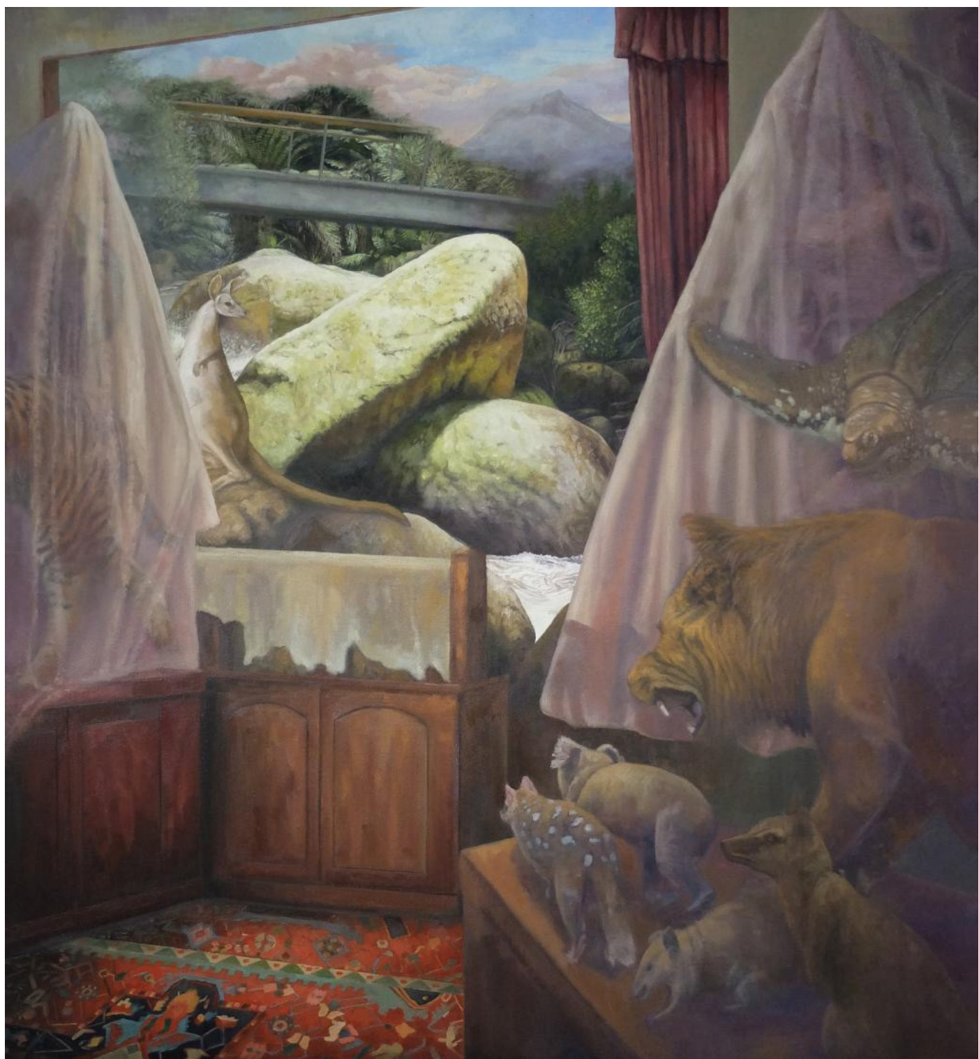
West, 2022. Oil on canvas, 93 x 89 cm SOLD