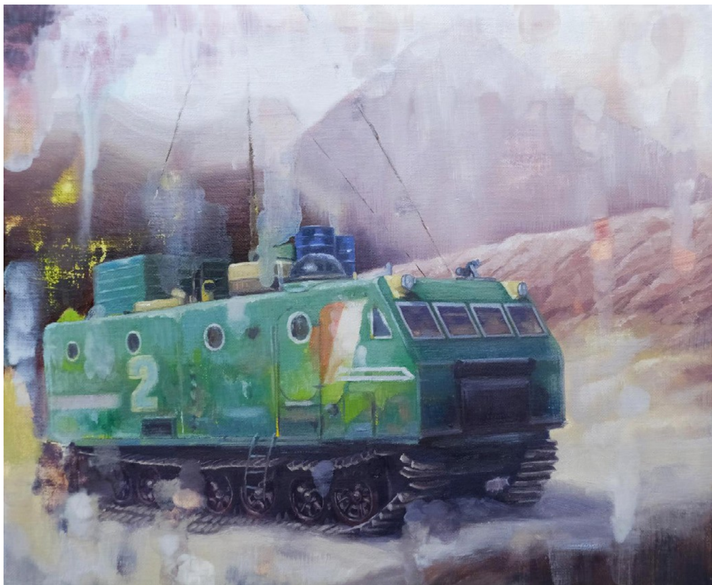
Auxiliary Power, 2025. Oil on linen, 26 x 31 cm $1800