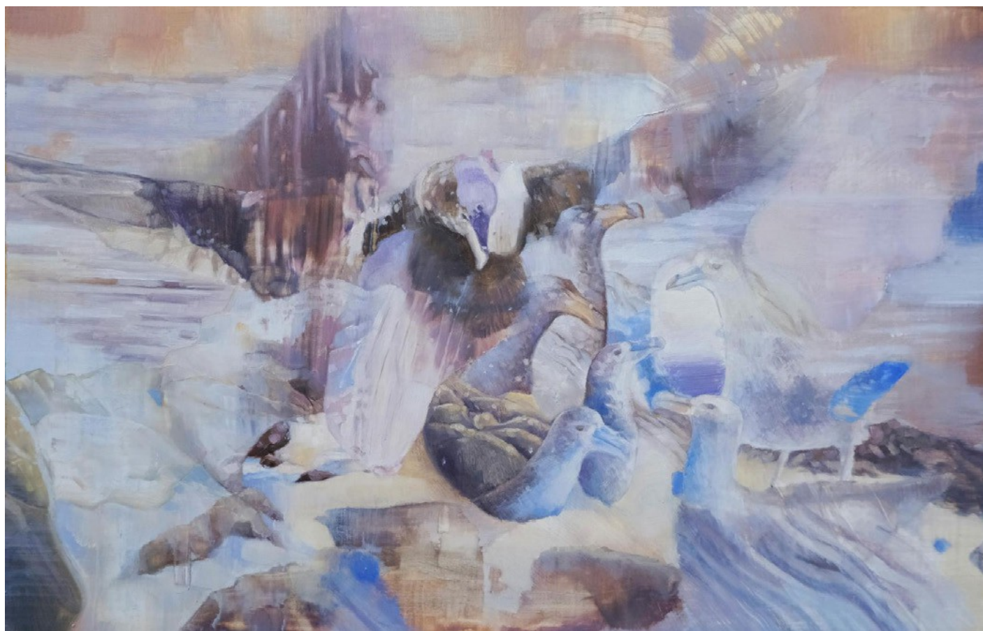
Plateau, 2024. Oil on board, 19 x 29 cm $1600