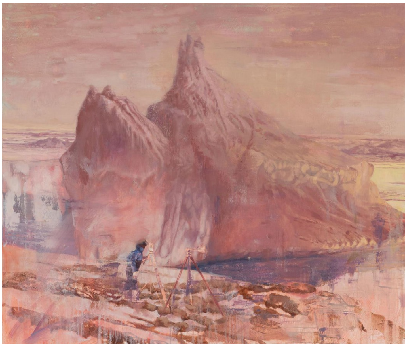
Celestial, 2024. Oil on canvas, 93 x 89 cm $4500