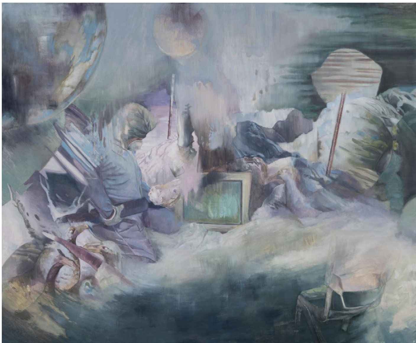
Surface, 2024. Oil on linen, 171 x 209 cm $10000