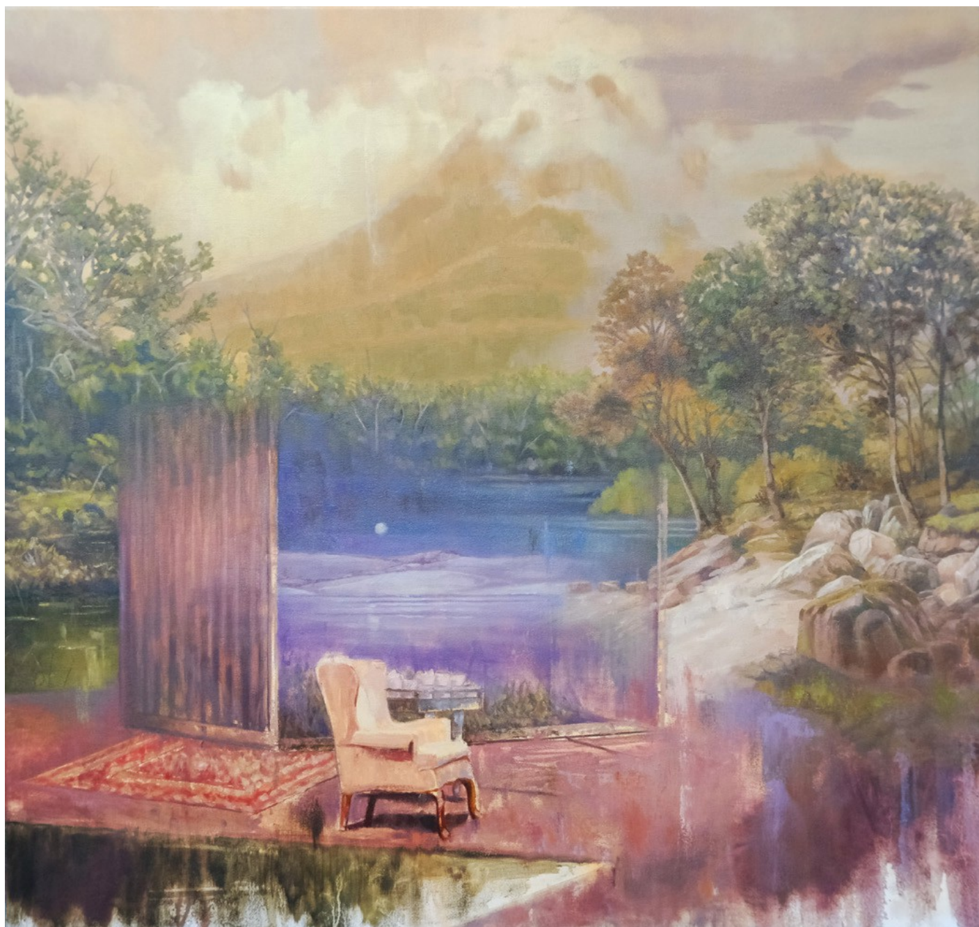
Landscape (After Forrest), 2025. Oil on canvas, 89 x 93 cm SOLD