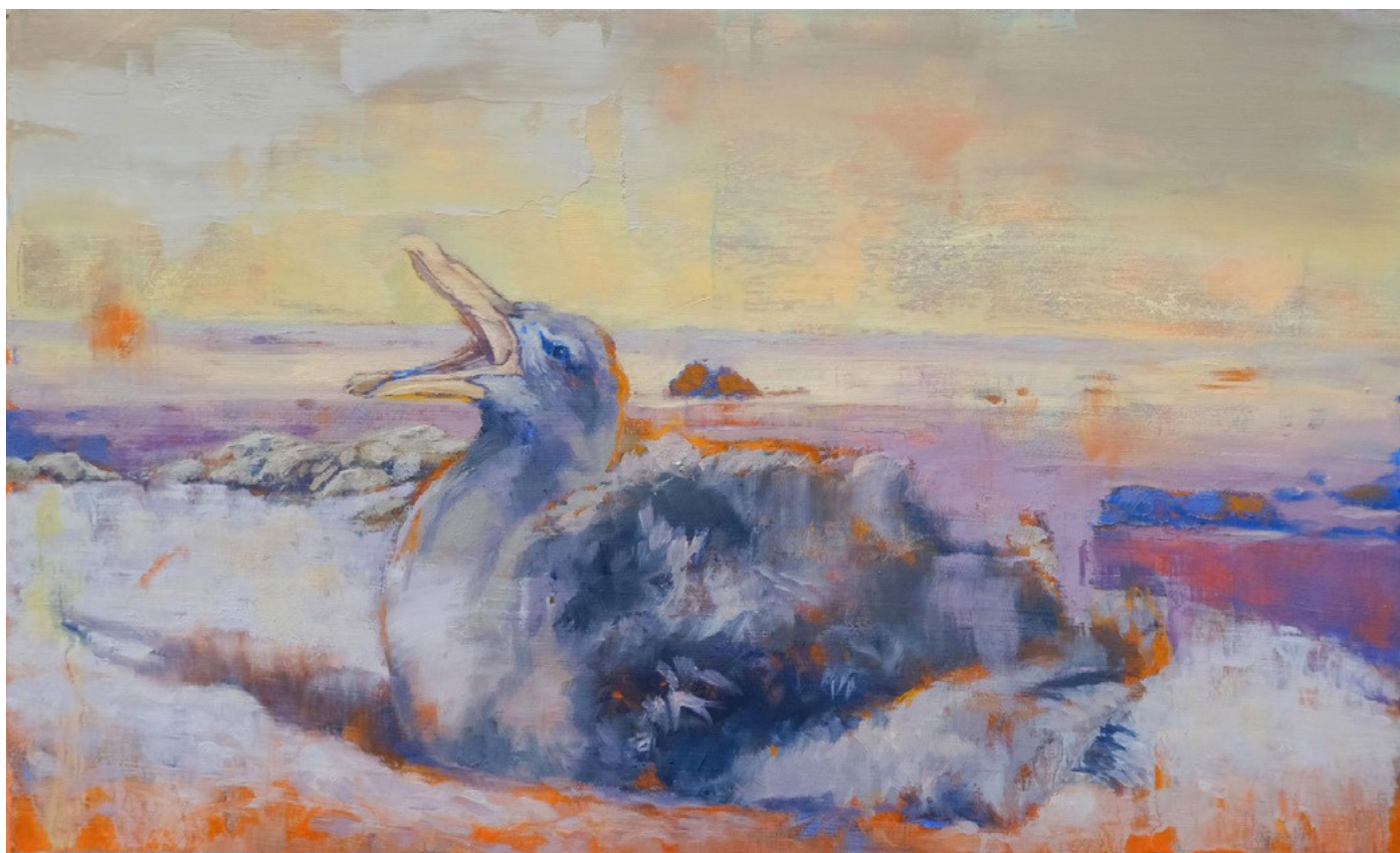
Dark Morph, 2023. Oil on board, 18 x 29 cm $1300