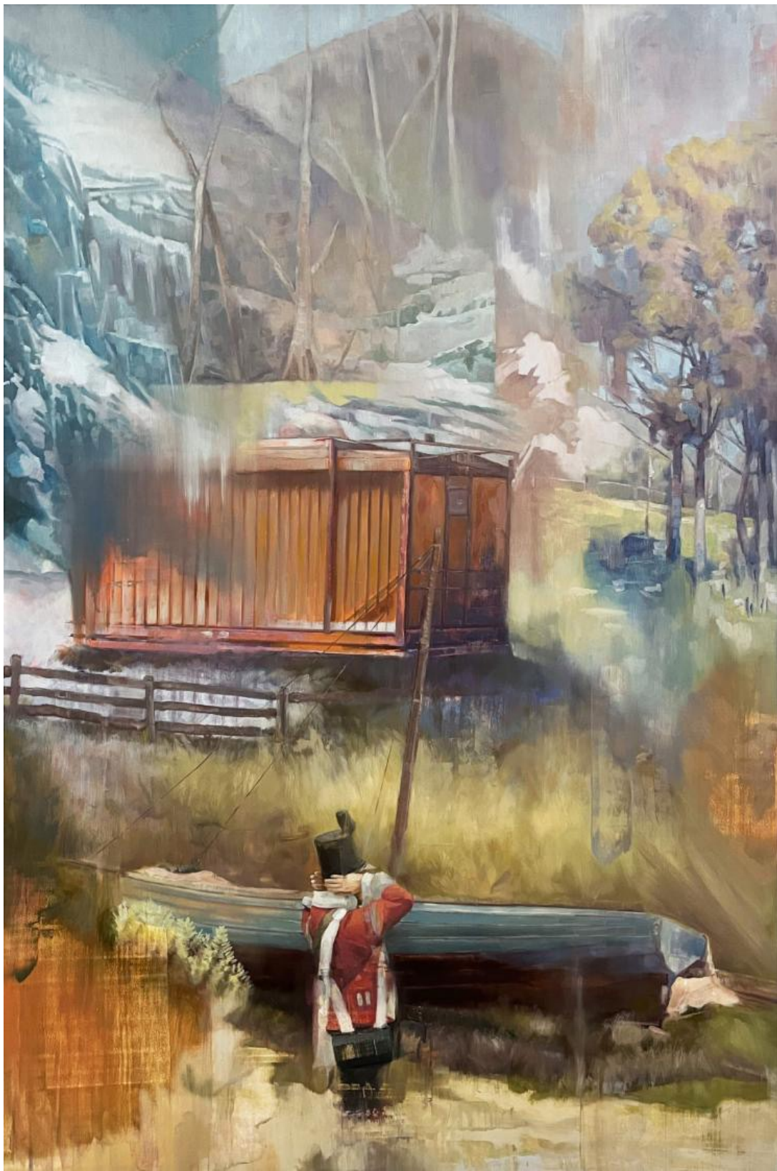
Home, 2025. Oil on board, 110 x 70 cm ON RESERVE