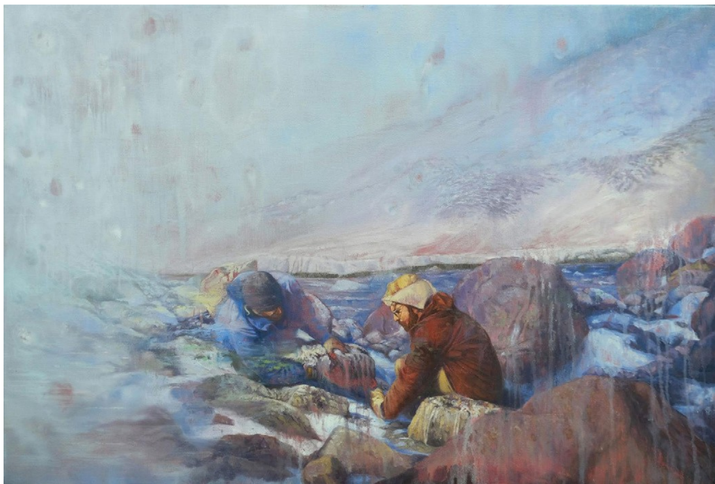
Flare, 2022-24. Oil on canvas, 62 x 91 cm SOLD