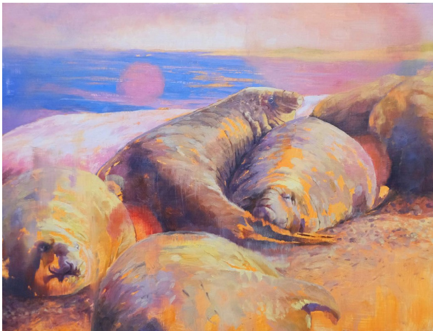
Mirounga, 2024. Oil on board, 27 x 35 cm $1800