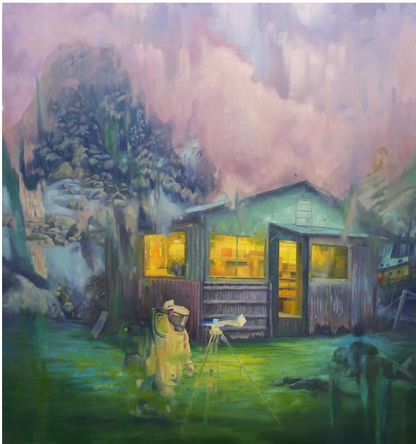
Endurance, 2024. Oil on canvas, 160 x 149 cm SOLD