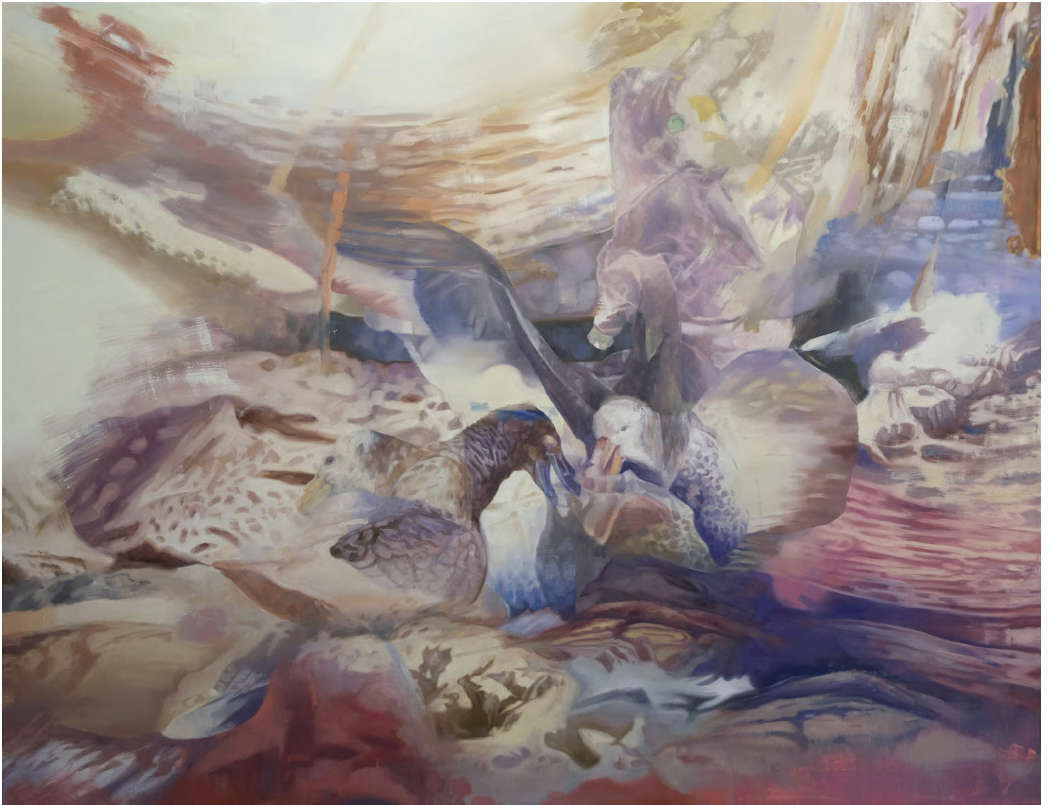
Jarrad Martyn, Light Morph , 2024. Oil on linen, 146 x 190 cm. $8000