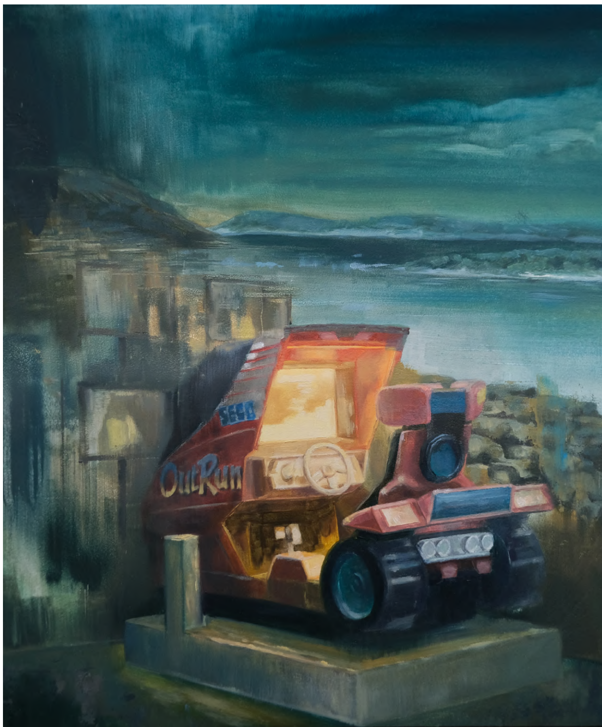
Jarrad Martyn, Halo, 2025, Oil on board, 30 x 25 cm. $1700