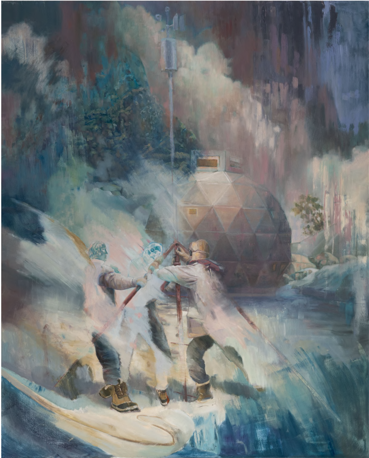
Jarrad Martyn, Tower , 2024 Oil on linen, 218 x 147 cm. $8000