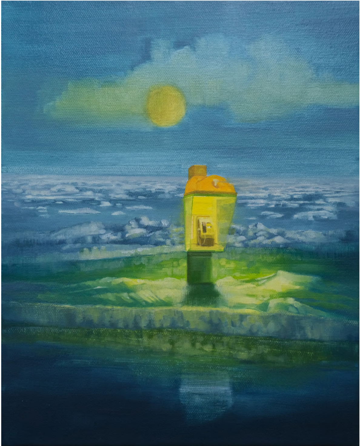
Jarrad Martyn, Cone, 2025, Oil on canvas, 28 x 22 cm. $1200