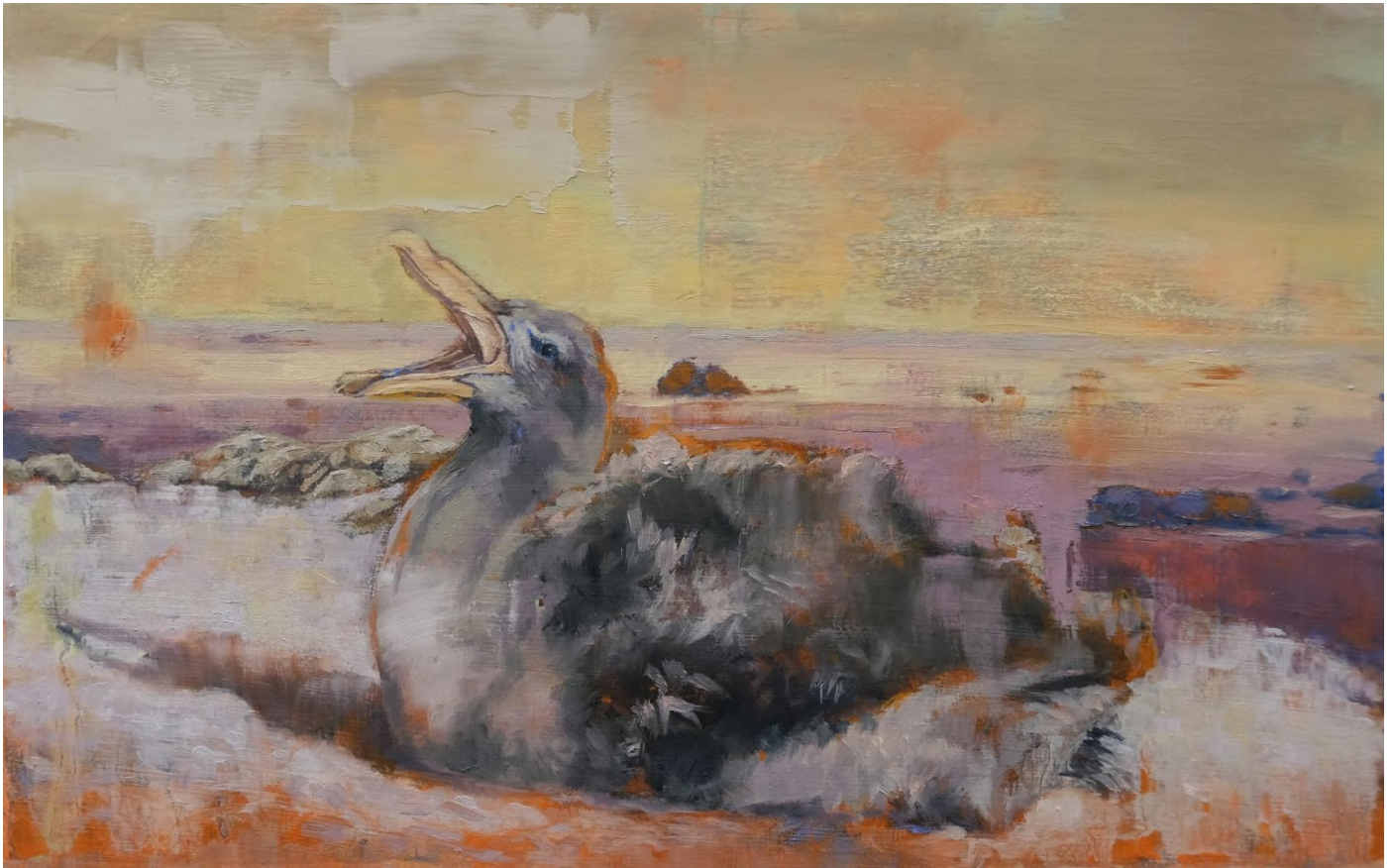
Jarrad Martyn, Dark Morph, 2023. Oil on board, 18 x 29 cm. $1200