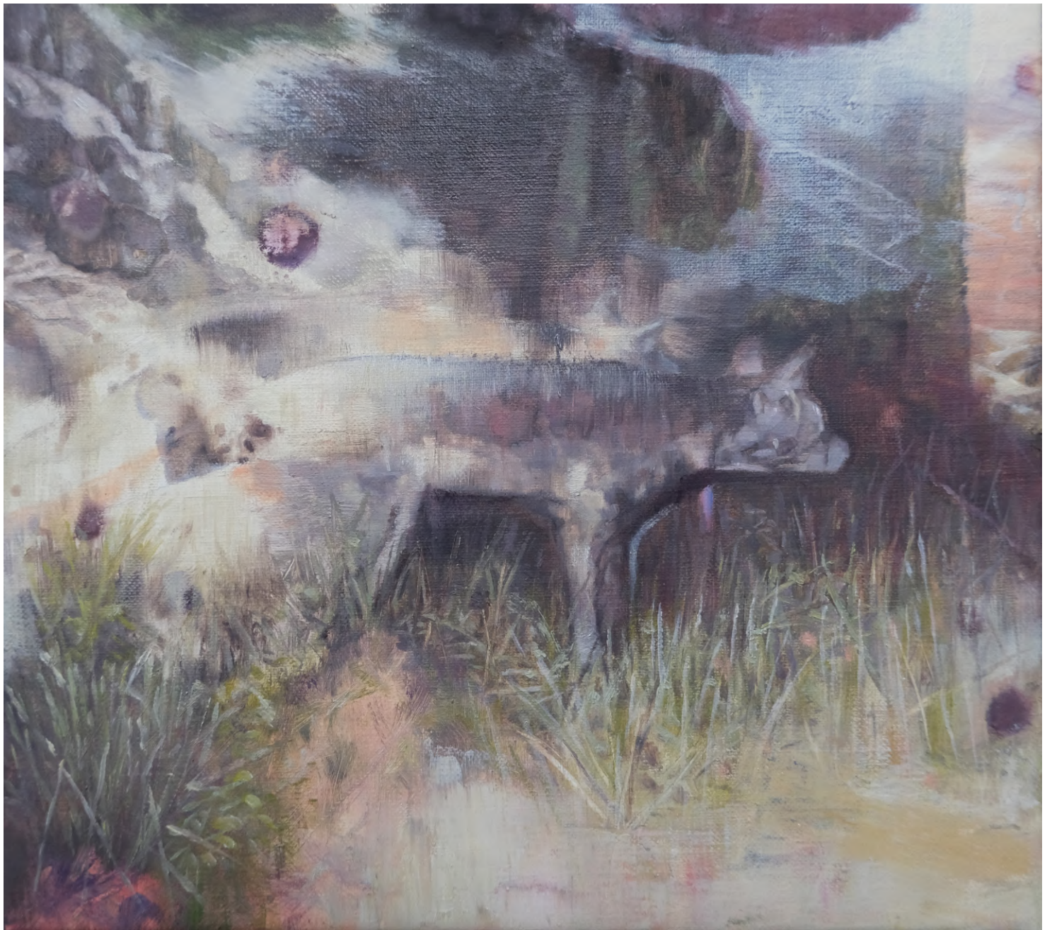
Jarrad Martyn, Basilisk, 2025, Oil on linen, 23 x 25 cm. $1100