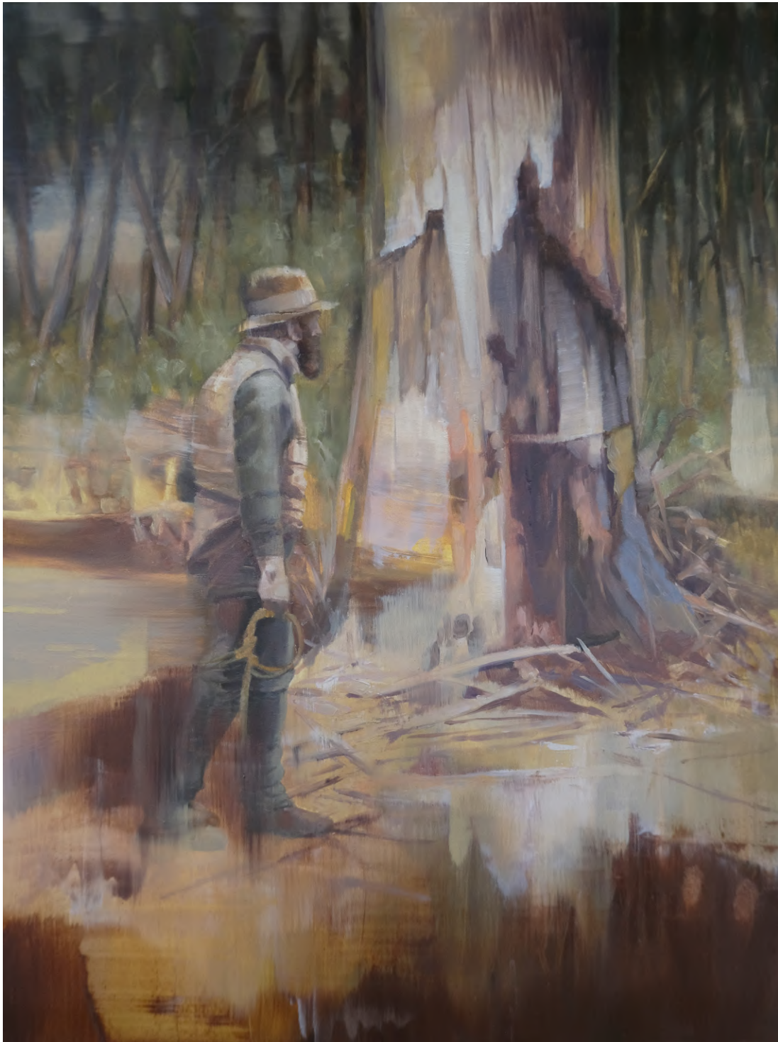
Jarrad Martyn, Stringybark, 2025, Oil on board, 34 x 20 cm. $1800