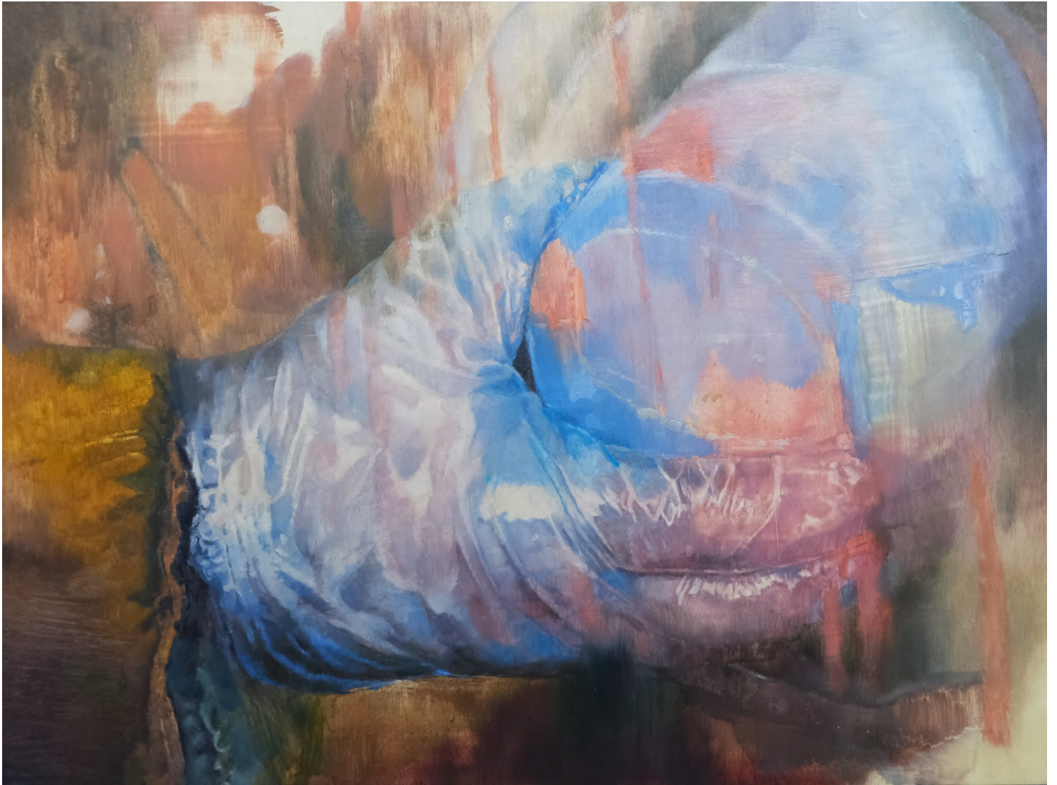
Jarrad Martyn, Bedrock , 2025. Oil on board, 25 x 34 cm. $1300