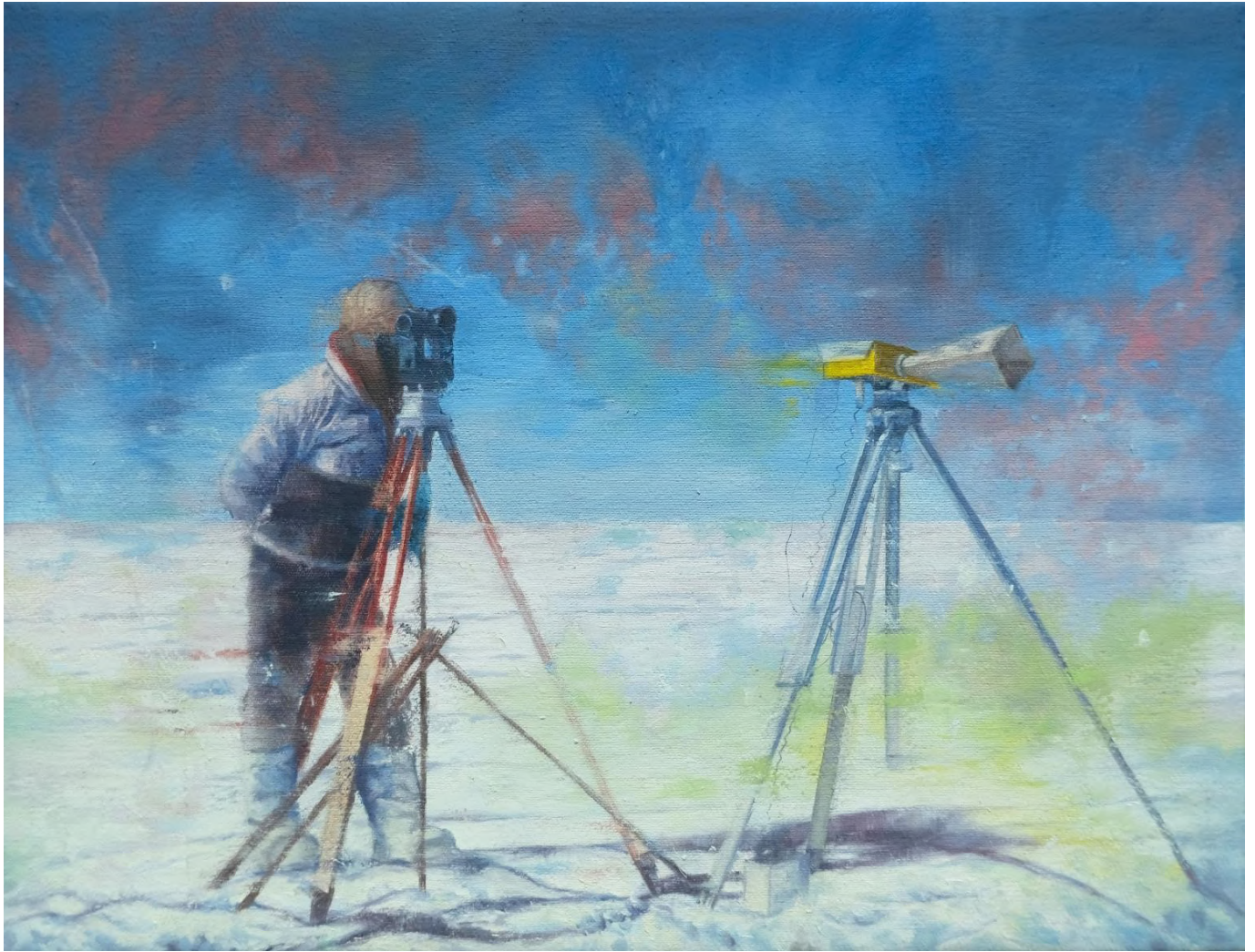
Jarrad Martyn, Conditions of Land, 2022. Oil on canvas, 31 x 41 cm. $1700