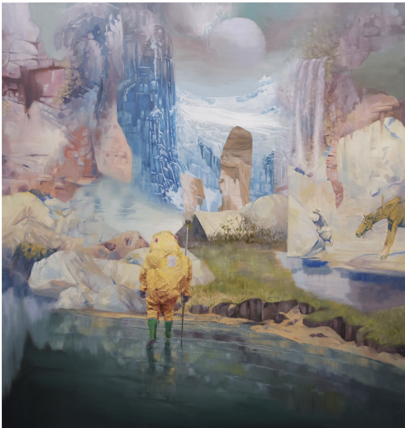
Jarrad Martyn, Parables & Paradoxes , 2024. Oil on canvas, 155 x 145 cm. $8000