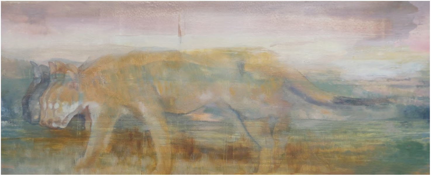
Jarrad Martyn, Beam, 2025, Oil on board, 17 x 40 cm. $2000