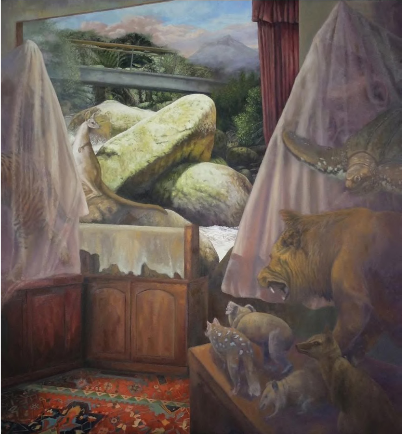
Jarrad Martyn, West, 2022. Oil on canvas, 89 x 93 cm. $4000