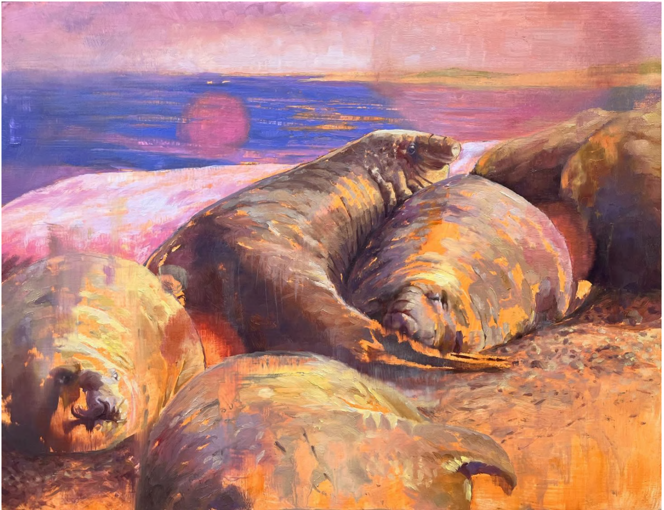
Jarrad Martyn, Mirounga , 2023. Oil on board, 27 x 35 cm. $1400