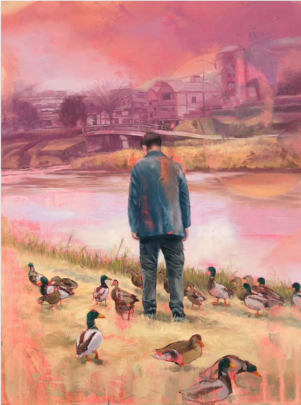
Jarrad Martyn, Katsura, 2023. Oil on board, 29 x 38 cm. $1600