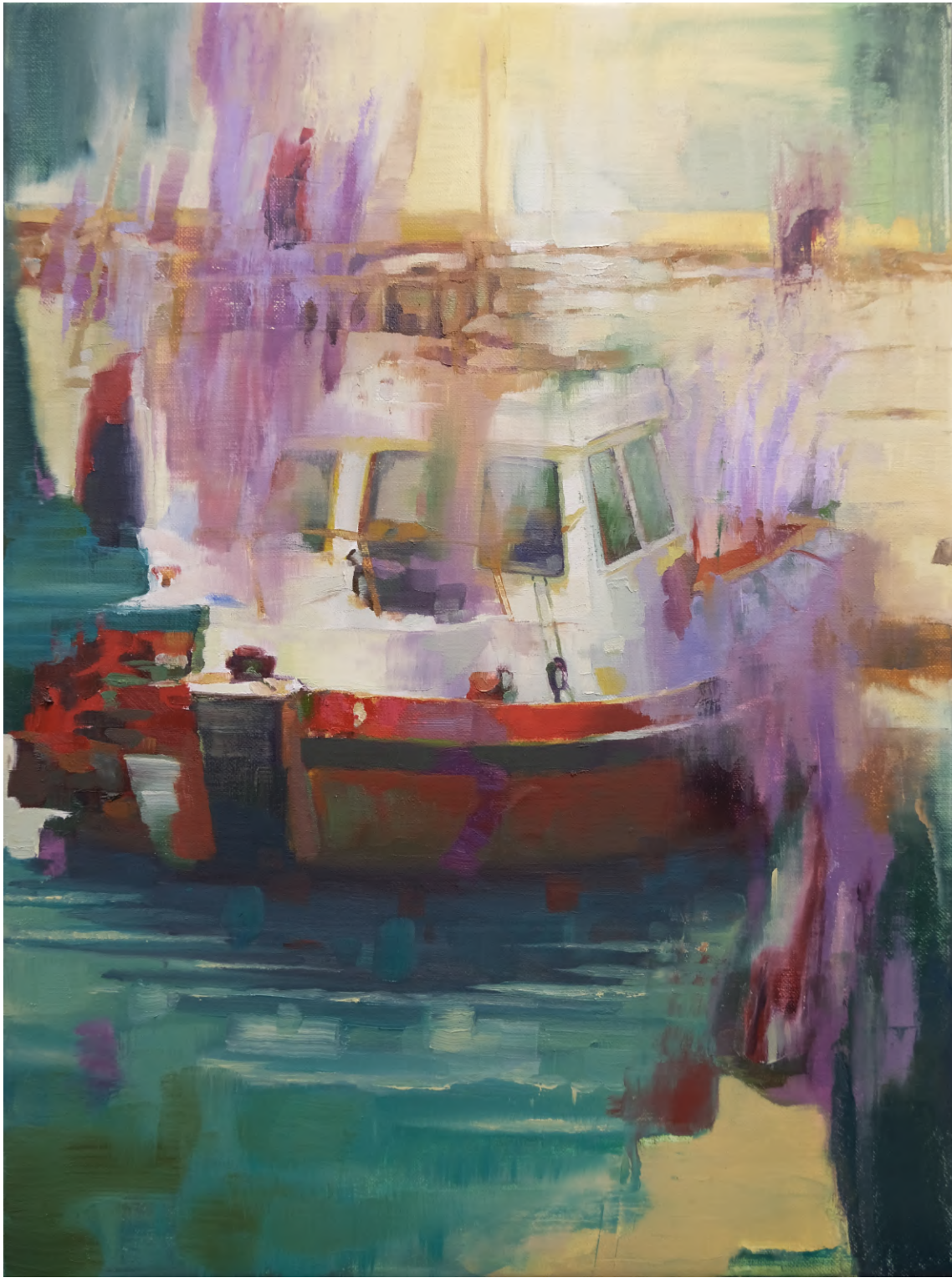
Jarrad Martyn, Curiosity, 2024 Oil on linen, 41 x 31 cm. $2000