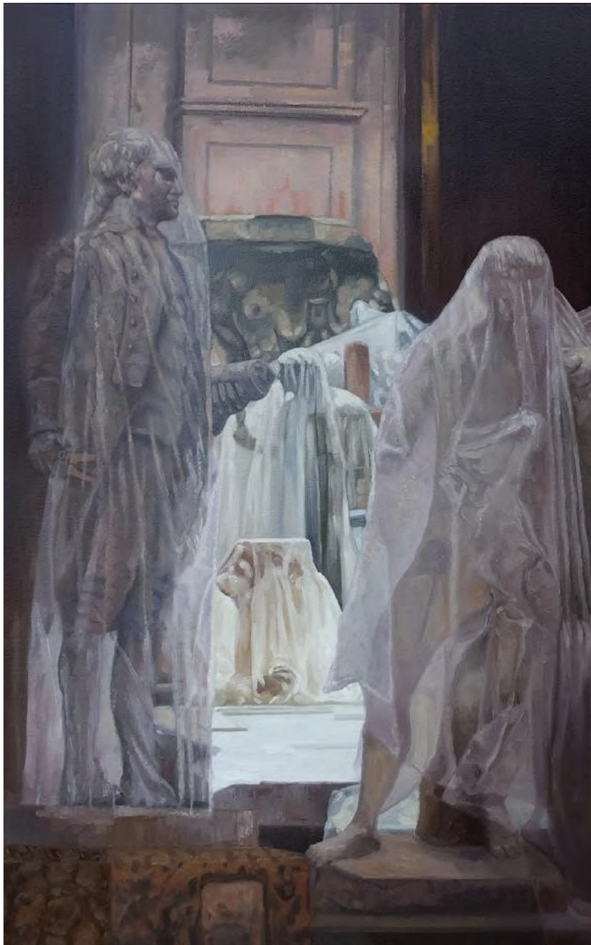
Jarrad Martyn, Storage, 2024. Oil on canvas, 86 x 56 cm. $3000