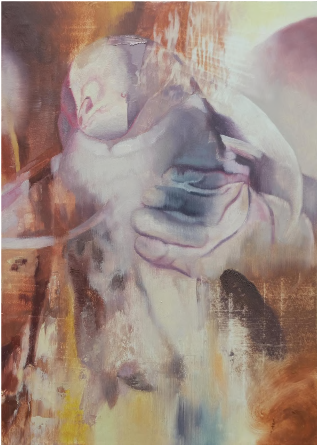
Jarrad Martyn, Tux, 2024. Oil on board, 30 x 24 cm. $1200