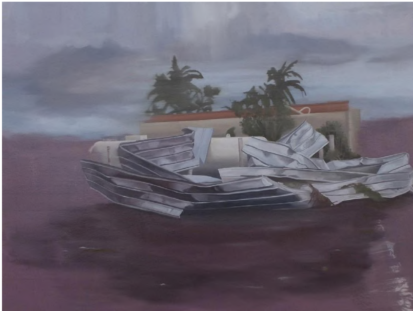
Jarrad Martyn, All Seasons , 2017. Oil on canvas, 57 x 78 cm. $3000