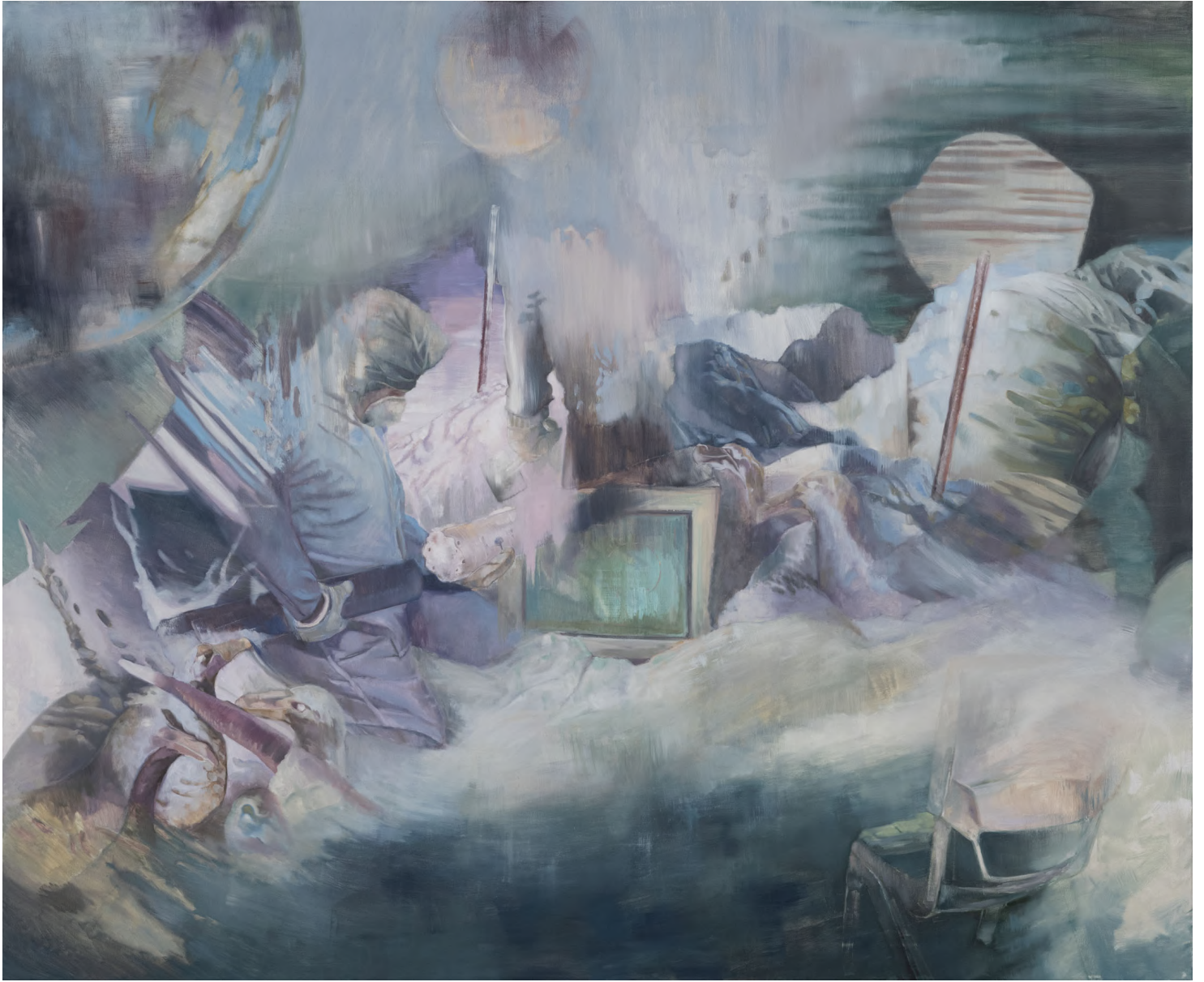
Jarrad Martyn, Surface , 2024. Oil on linen, 171 x 209 cm. $8000