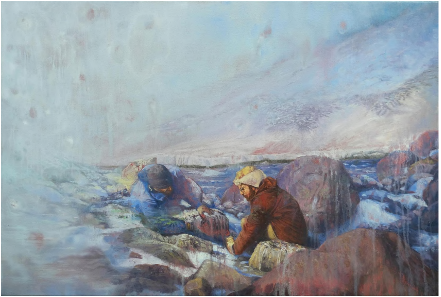
Jarrad Martyn, Flare, 2023. Oil on canvas, 62 x 91 cm. $3700