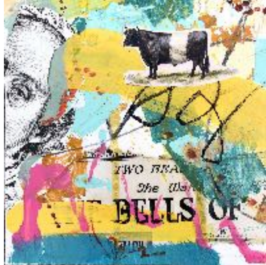
Original Little Painting Cards Acrylic & Mixed Media For sale at Gallery Los Olivos