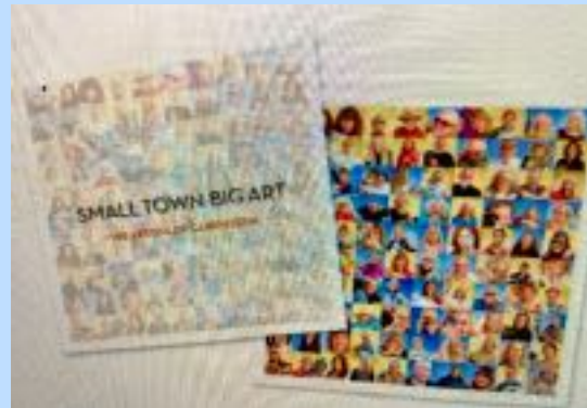
100 Local Artists