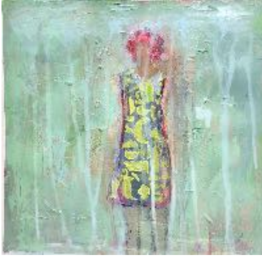
When the Rain Comes 11" x 11" Acrylic & Mixed Media