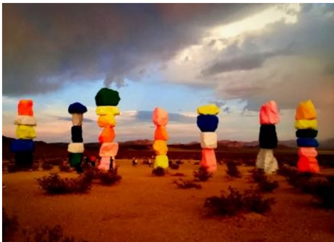
Ugo Rondinone's Seven Magic Mountains (2016)

tumbling with art inspiration and art invitations