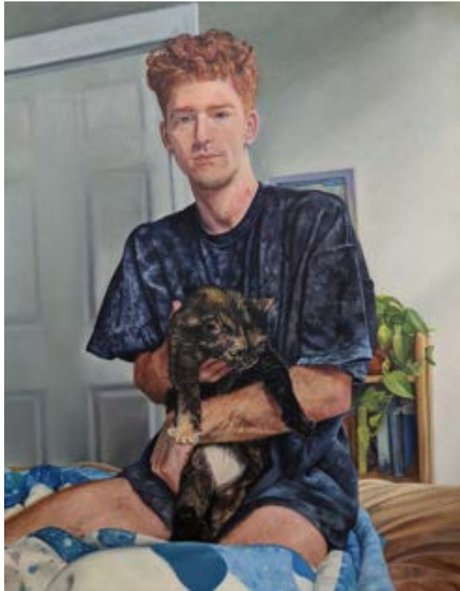
Aurora Abzug Philadelphia, PA Max & Babka , 2021 Oil on canvas