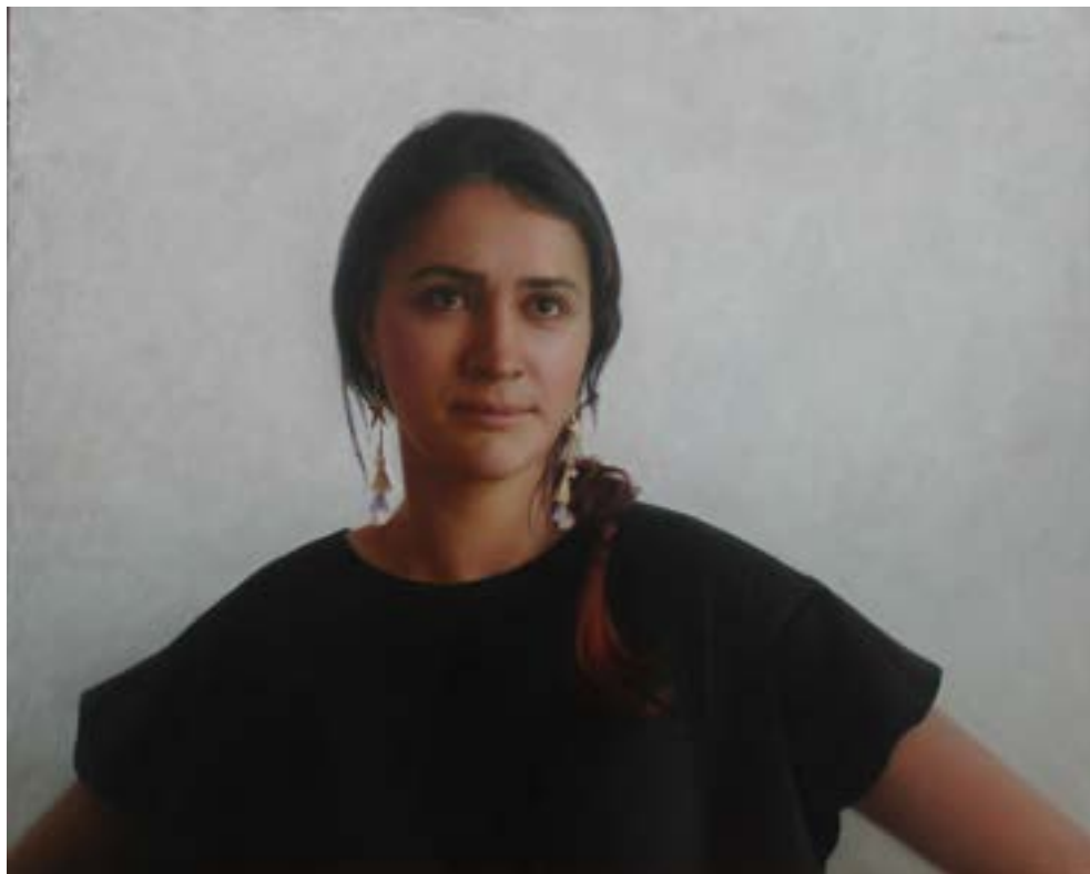
Lisa Kovvuri Durham, NH Ladybird , 2023 Oil on aluminum