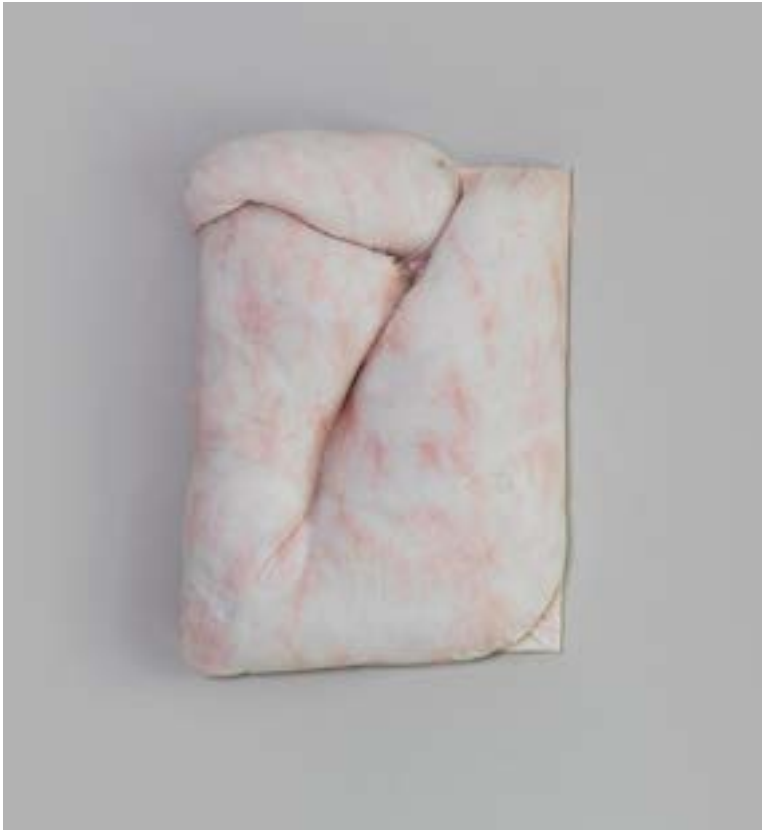
Polina Varlamova Cary, NC The Body Fragment , 2020 Soft sculpture