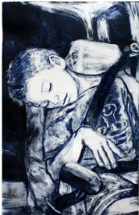
Rachel Mindrup Omaha, NE Long Day, 2023 Monotypes