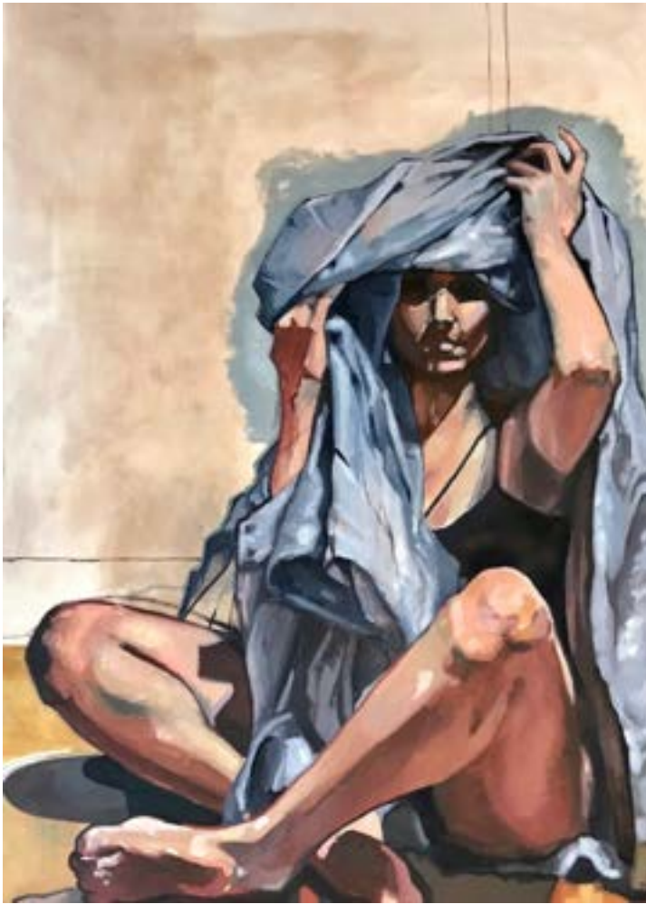
B. Hayden Brooklyn, NY Blue Sheet , 2019 Oil on canvas