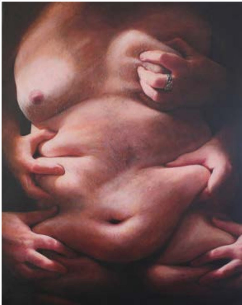
Fernando Carpaneda Freeport, NY Body Positivity , 2023 Acrylic on canvas