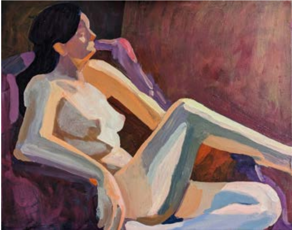
Kristen Moore Ardmore, PA Nude Figure , 2023 Oil on canvas