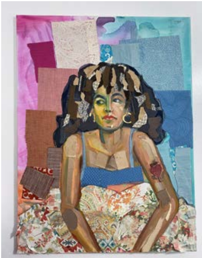
Marcellus Hammond Selinsgrove, PA Sunkissed Muse , 2023 Acrylic and textile