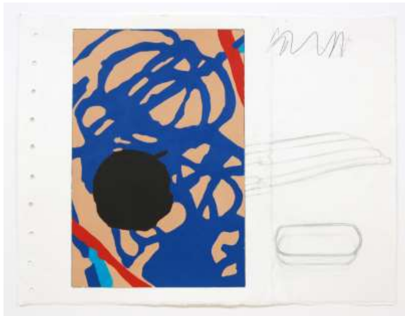
Figure 1 Steven Pearson, Sketchbook Revisions: Woodwing and Scribble , 2014, graphite and acrylic on Rives BFK, 12 x 9 in.

together aspects of the past and possibilities of the future into a boundless present. Sketchbook Revisions (2014–2015), a series of mixed-media paintings, represents my attempt to communicate the ways in which I experience my contemporary moment constructed from multiple temporalities excavated from my past. This body of work combines fragments of representational paintings created between 1995 and 2003 and nonrepresentational renderings produced between 2003 and 2014. Using traditional tracing paper and graphic color, I randomly select moments of my previous work to transfer and layer over selected areas of already-filled pages of a sketchbook I used from 2003 to 2004. These sketches depict objects I encountered in studio art classrooms and iconic architecture on the campus of McDaniel College, and often incorporate teaching notes. The final renditions of fragmented and layered histories enact the ways that we collectively experience multiple temporalities in the present. Quoting my various bodies of work, Sketchbook Revisions challenges both material and conceptual boundaries that determine fixed notions of artistic identity.