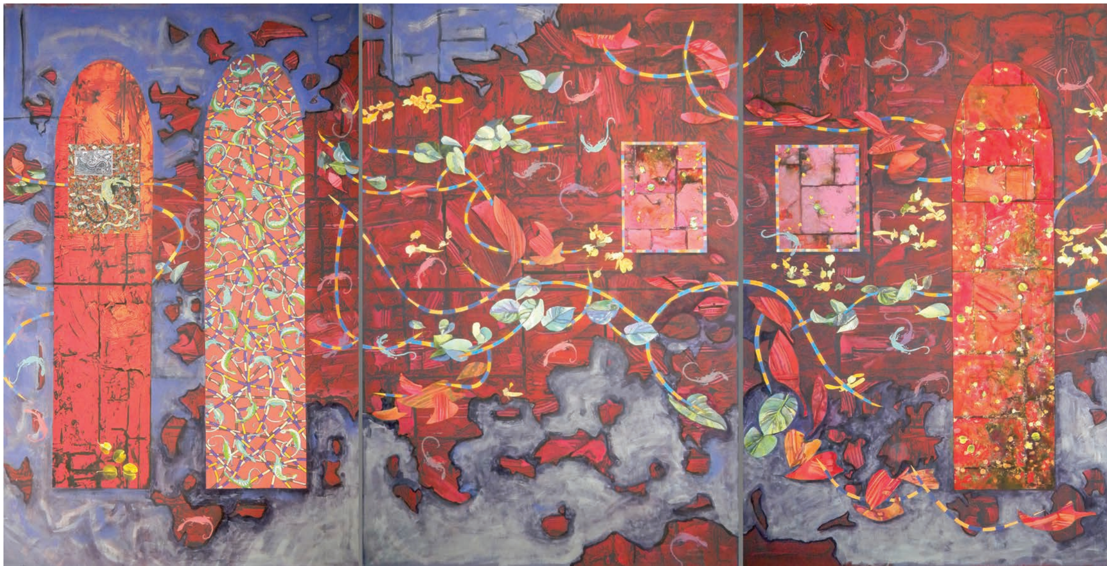
Red Triptych 2021

Relief collograph, silkscreen, oil crayons, rubber stamps, collage 60 x 120 inches