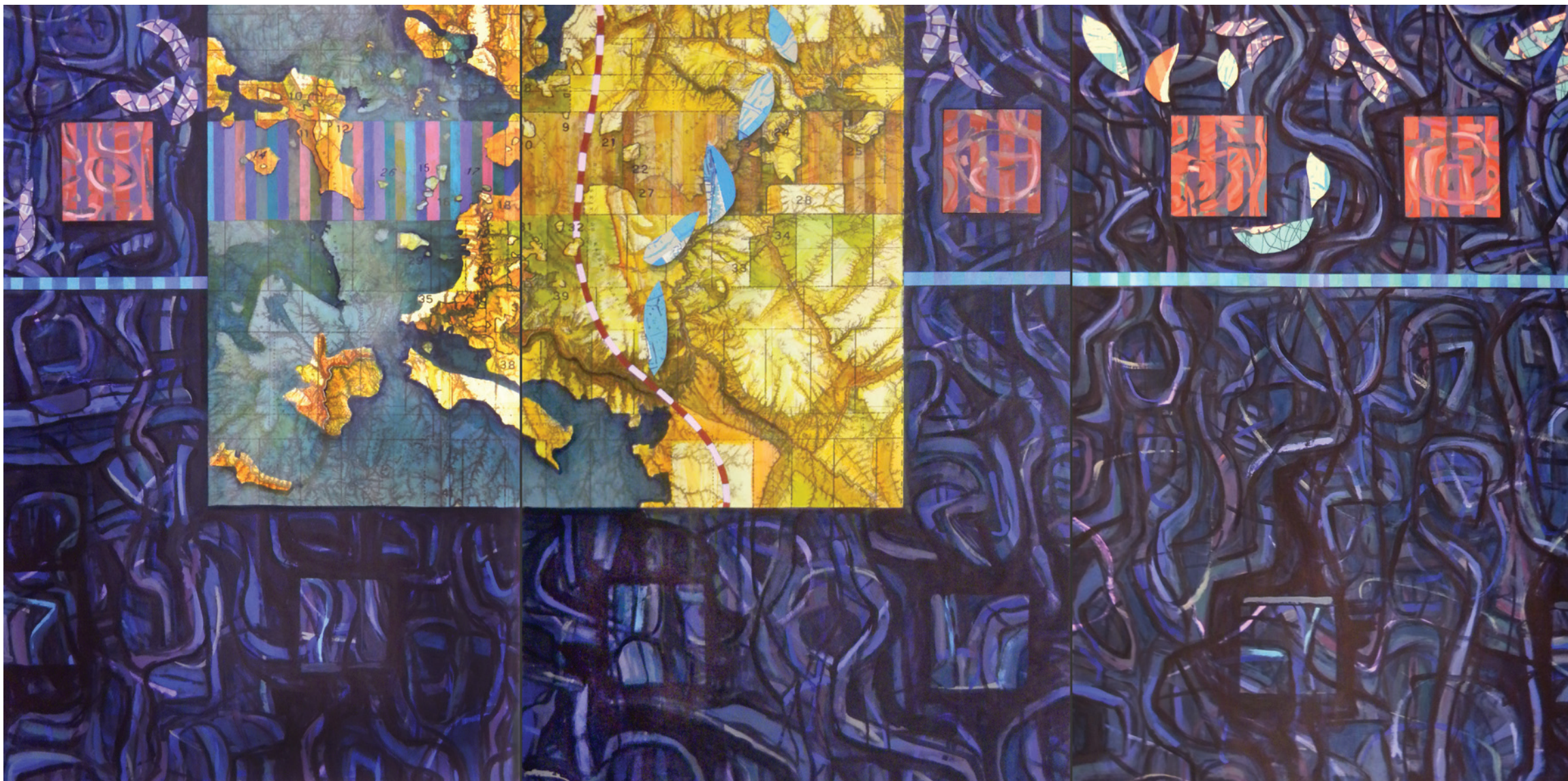
Excavation 2014 Screen inks, colored pencils, collage 60 x 120 inches