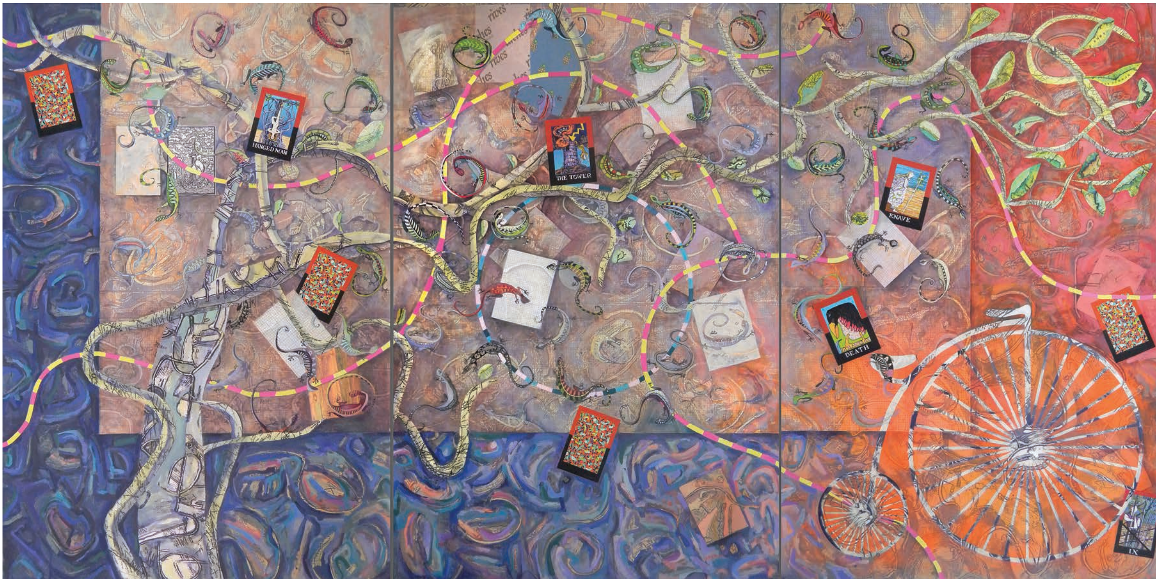
Adapt 2021 Relief collograph, screen inks, colored pencils, spray paint, collage 60 x 120 inches