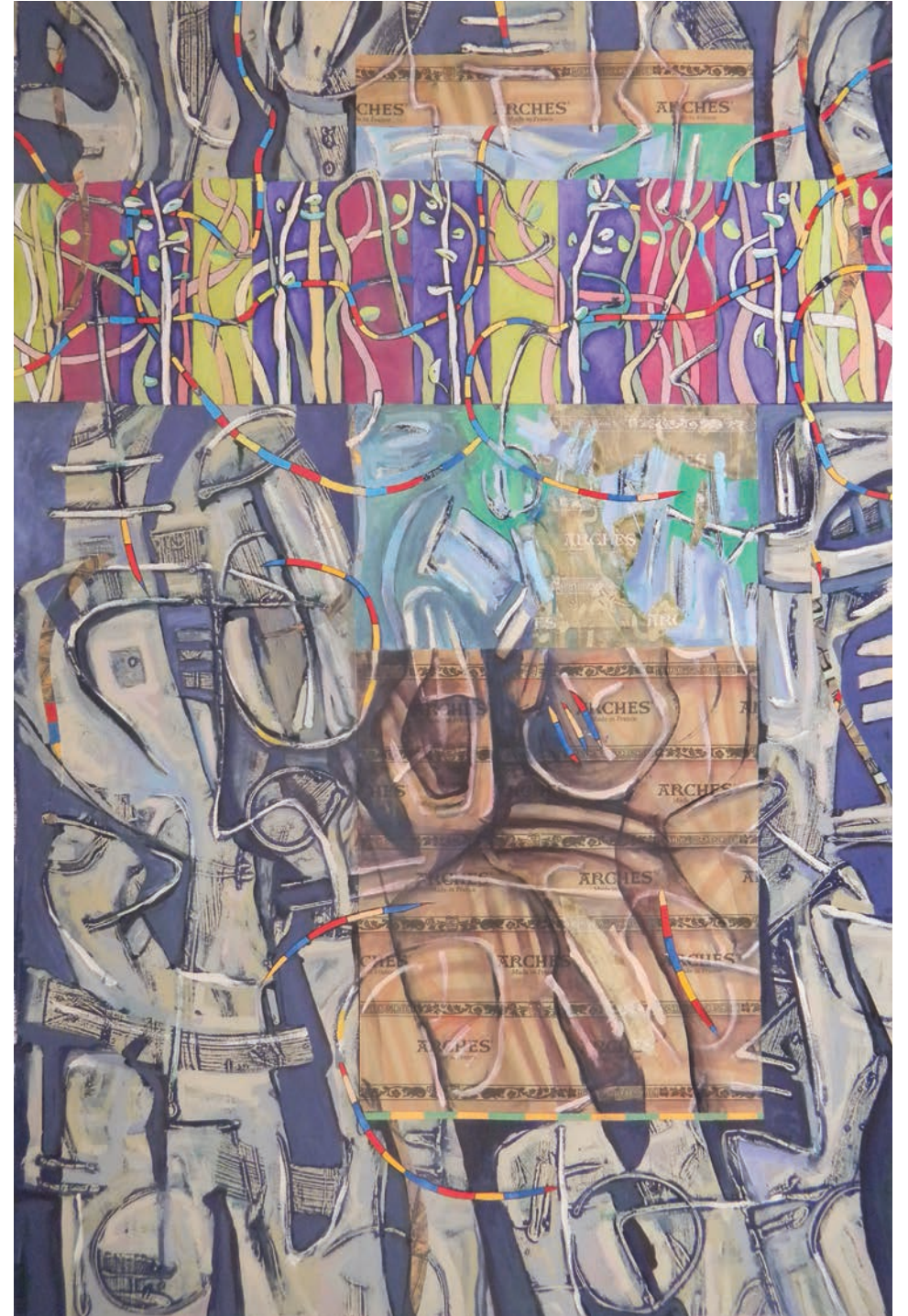
Wands 2020 Relief collograph, screen inks, oil crayons, collage 60 x 40 inches