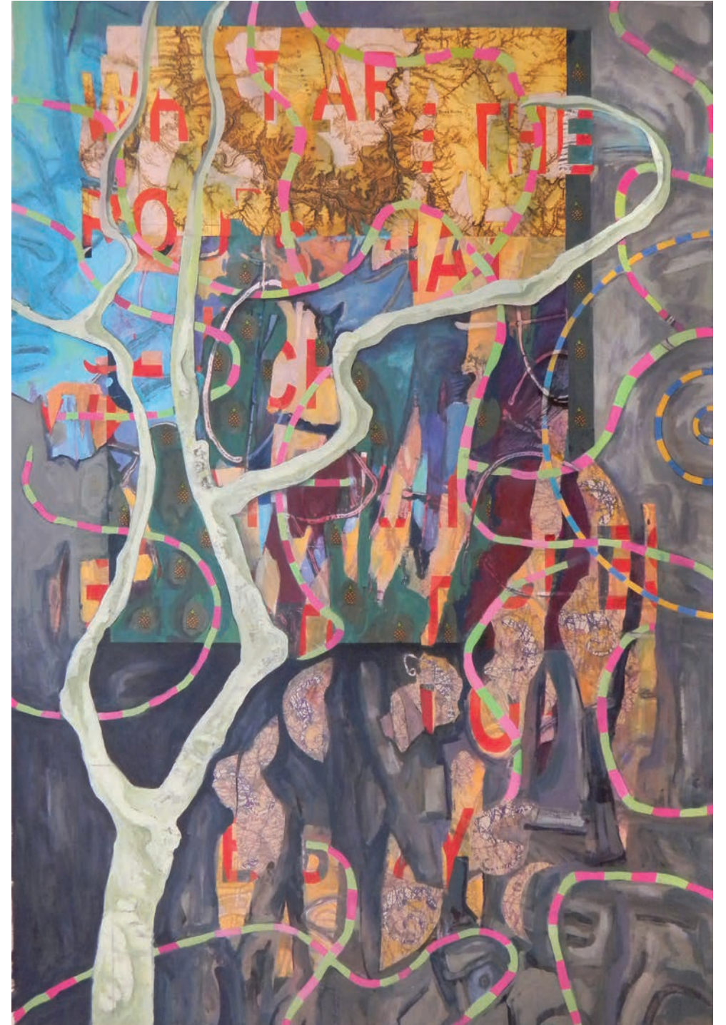
The Roots that Grow 2020 Screen inks, colored pencils, oil crayons, collage 60 x 40 inches