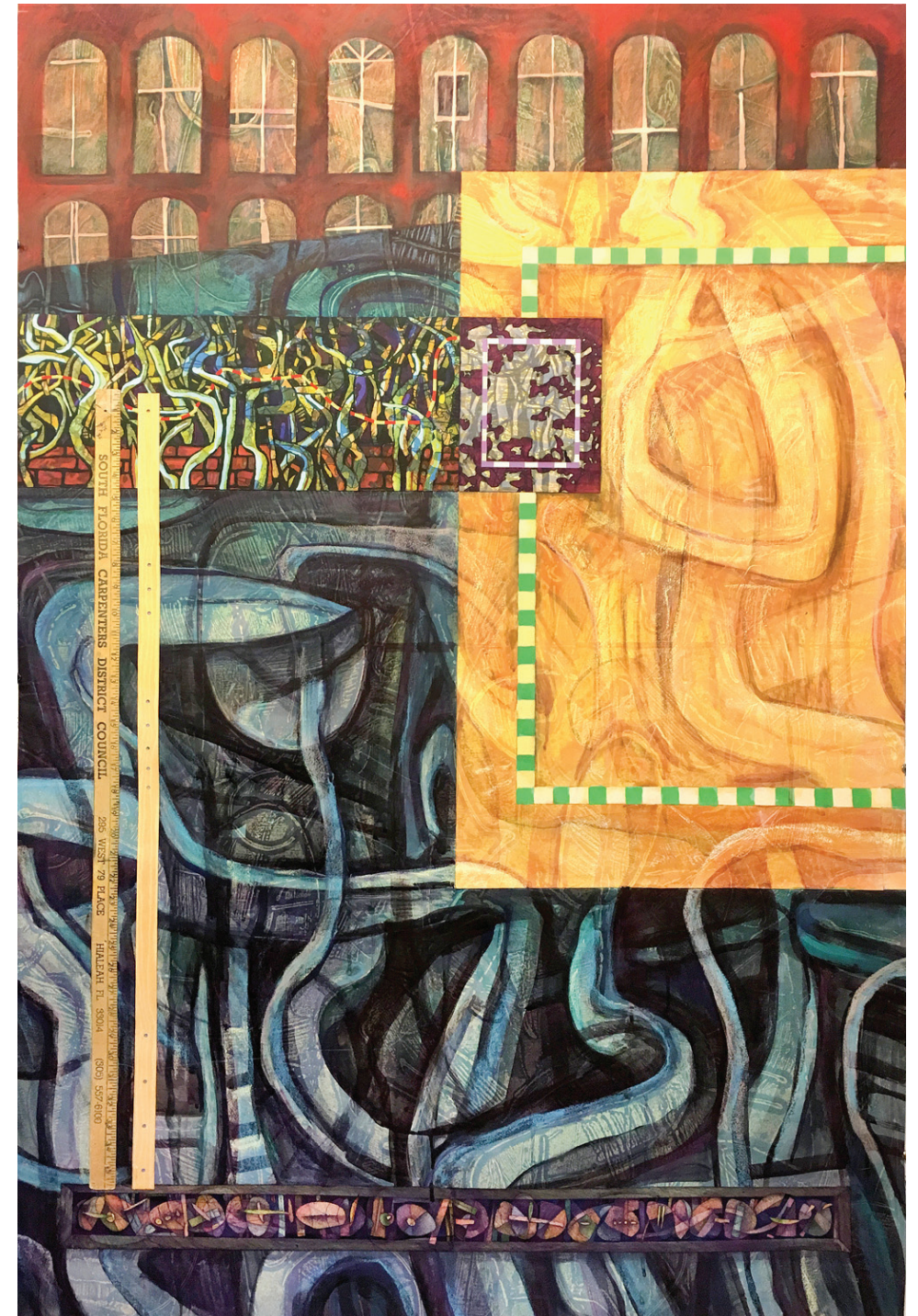
Horizons 2017 Relief collograph, silkscreen, oil crayons, etching, collage 60 x 40 inches

She joined the University of Miami in 1993. She has received two Florida Individual Artist Grants in 1993/94 and 1999/2000 and 16 University of Miami Research Support Awards between 1996 and 2021. She works in Silkscreen, Lithography, Relief Printing and Etching making both editions and unique pieces, which also utilize inkjet printing, painting and collage. She's had 25 solo exhibitions including shows at the Deland Museum of Art, the Polk Museum of Art, Miriam Perlman Gallery in Chicago, and Bird in Hand Gallery in Washington D.C. She has been in more than 300 group invitational and juried exhibitions; her work is in many public collections including the Art Institute of Chicago and the Denver Art Museum.