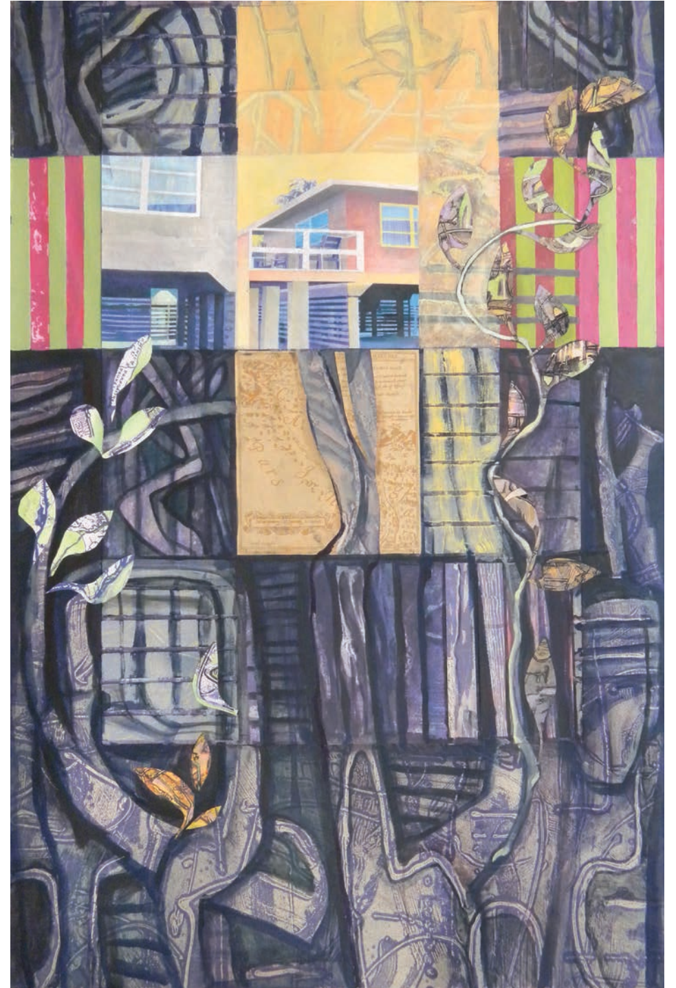
Estero 2020 Relief collograph, silkscreen, oil crayons, collage 60 x 40 inches