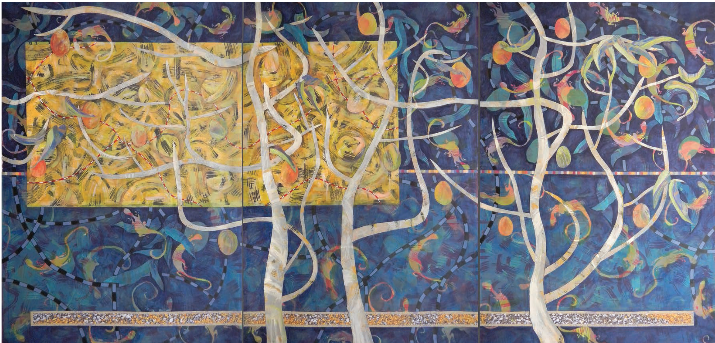
Equator 2021 Silkscreen, oil crayons, collage 60 x 120 inches