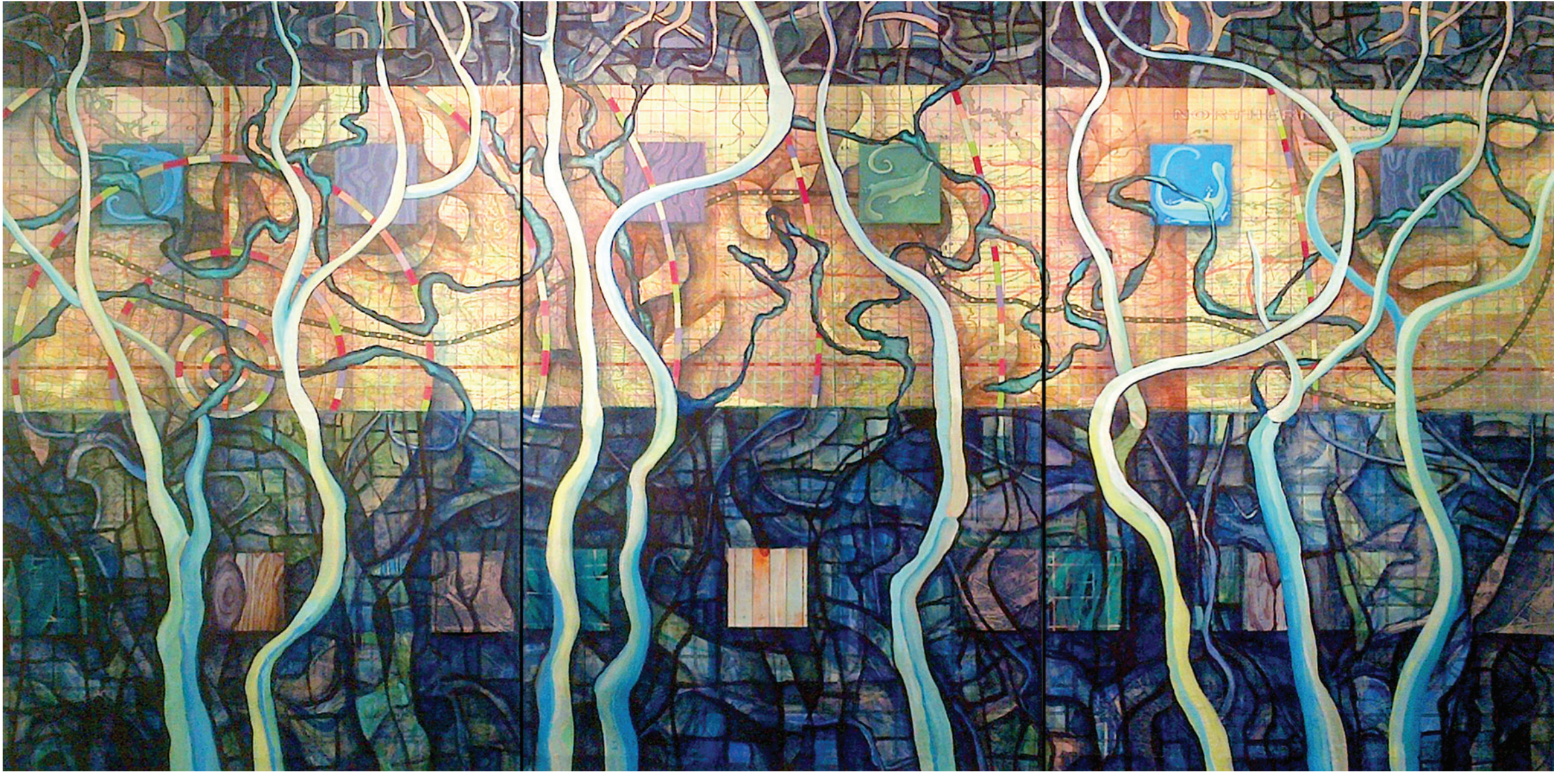
Northern Pacific 2014 Relief collograph, screen inks, oil crayons, colored pencils, collage 60 x 120 inches