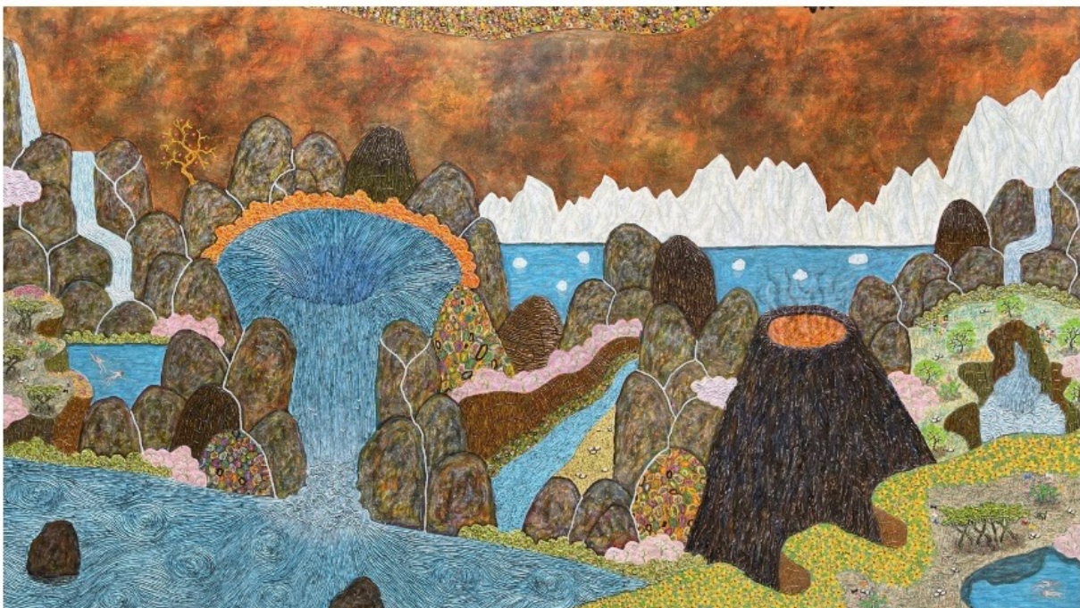
HUNG VIET NGUYEN, "Sacred Landscape V # 57," 2022, oil on canvas, 48" x 84"

Nguyen was, like so many others, quite prolific during COVID lockdown. Feeling the need to provide a visual antidote to the prevailing mood of doom and gloom, he brightened his landscapes with a more polychromatic palette, and made the scenes lush through the addition of organic life in the form of trees, flowers, volcanoes, and, in a few instances, people. In "Sacred Landscape IV #2" (2020), two figures can be observed swimming in a distant reservoir enveloped by boulders, waterfalls, and plants and trees bearing colorful green and orange foliage. To reach this paradise, however, we must first cross another body of water in the foreground, so the journey is not necessarily an easy one. Nguyen certainly knows this from his own experience, having fled Vietnam as one of the "boat people." He first landed in the Philippines, where he remained for ten months before making his way to California.