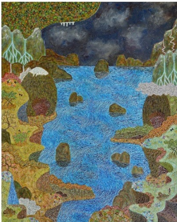
HUNG VIET NGUYEN, "Sacred Landscape III #2," 2020, oil on canvas, 60" x 48"

Water is the dominant feature in the earliest examples on view, where we see ponds, lakes, and waterfalls neatly embedded within mountainous landscapes that combine the naturalistic detailing of traditional Western art with the spatial flattening of Asian prototypes. Approaching them is something like stumbling upon hidden Shangri-Las. In "Sacred Landscape III #2" (2017), the central focus of the composition is on the swirling movements of whirlpools that make up a large body of water that we view from overhead. Using a palette knife, Nguyen scratches into the thick oil paint to create linear striations that define ripples in the water, as well the crusty surfaces of the cliffs and rocks that surround it. In this and other paintings from the same year we can observe that the artist's view of the spiritual accepts the darkness with the light, as the skies in these works are cloudy and foreboding.