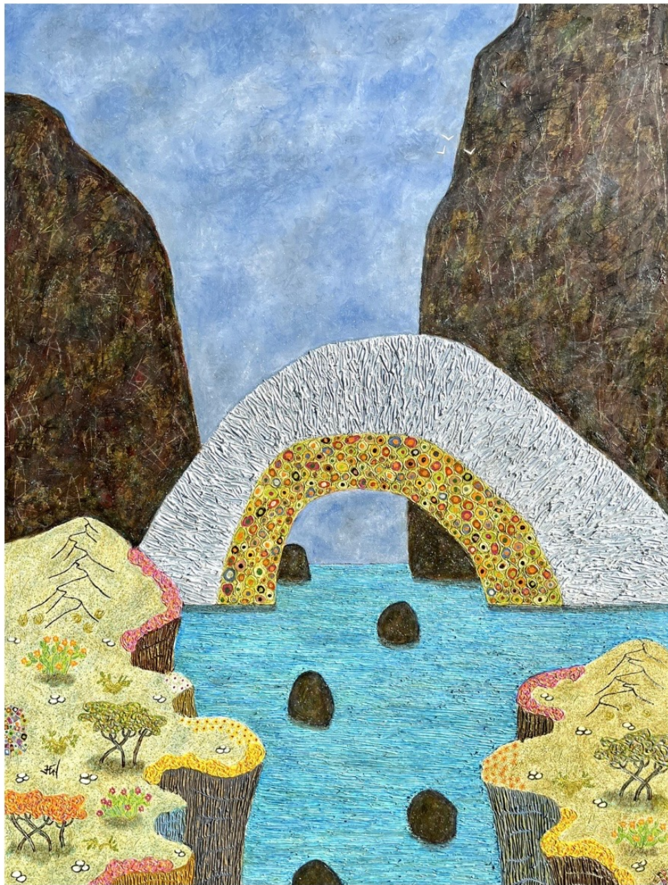
HUNG VIET NGUYEN, "GATE #2/Sacred Landscape VI #10," 2023, oil on canvas. 48 x 36"