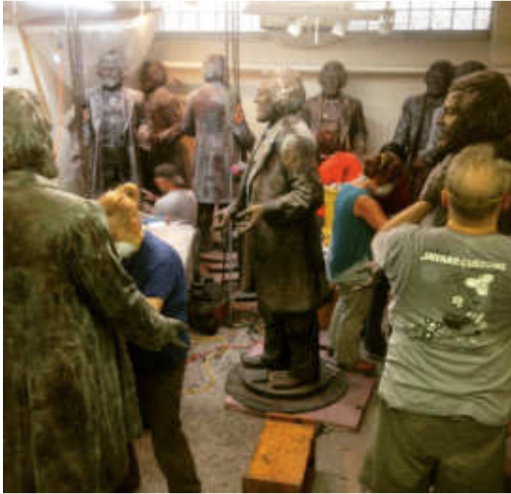
Volunteers making Bicentennial Douglass Statues in fiberglass, 2018

In honor of America’s 250th year of Independence & the “right to Life, Liberty and the pursuit of Happiness,” this article is a gentle reminder that our Union can accomplish just about anything.