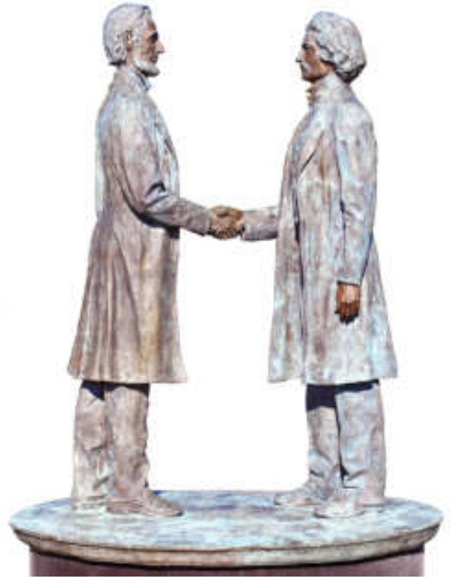
“Salt of the Earth, Light of the World” in bronze by Olivia Kim, 2023