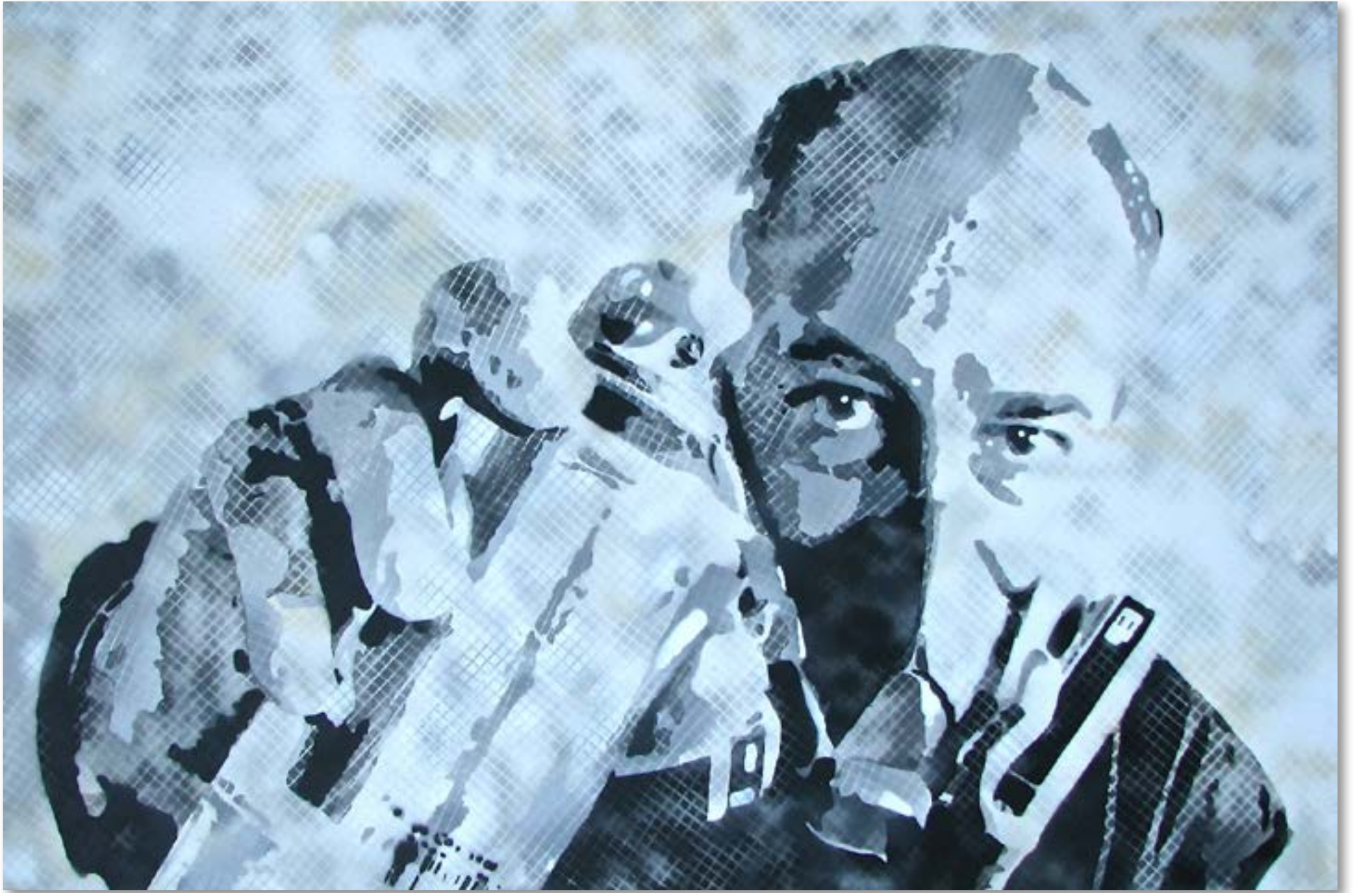
WHAT THE SURFACE SEES • ACRYLIC ON LINEN • 44 X 66 • 2013