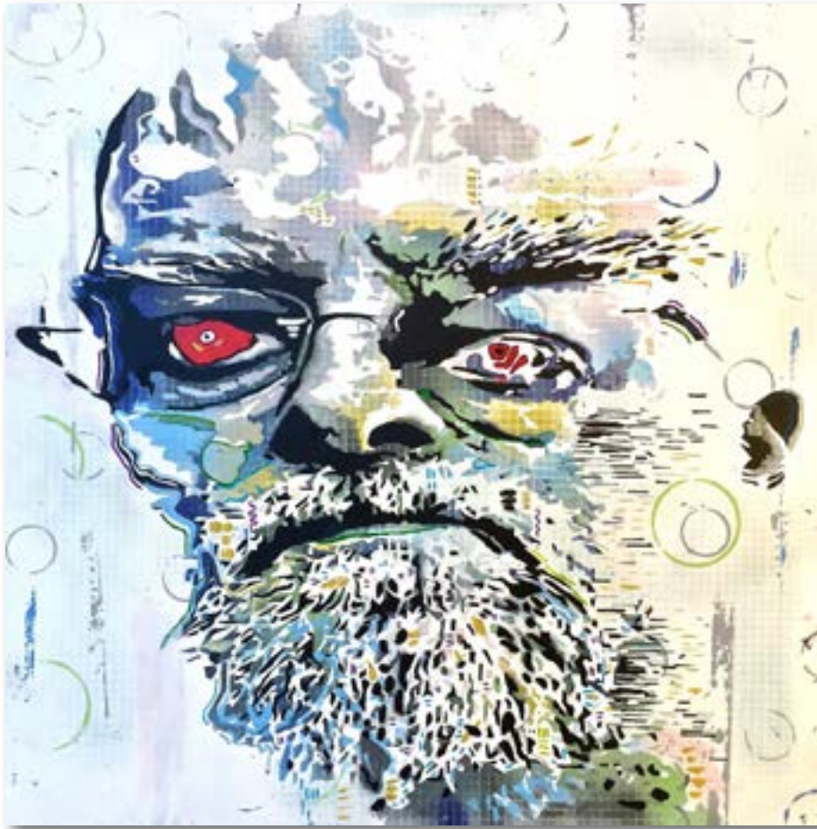
ANGUSTIA ACRYLIC ON WOOD PANEL 24 X 24 2015