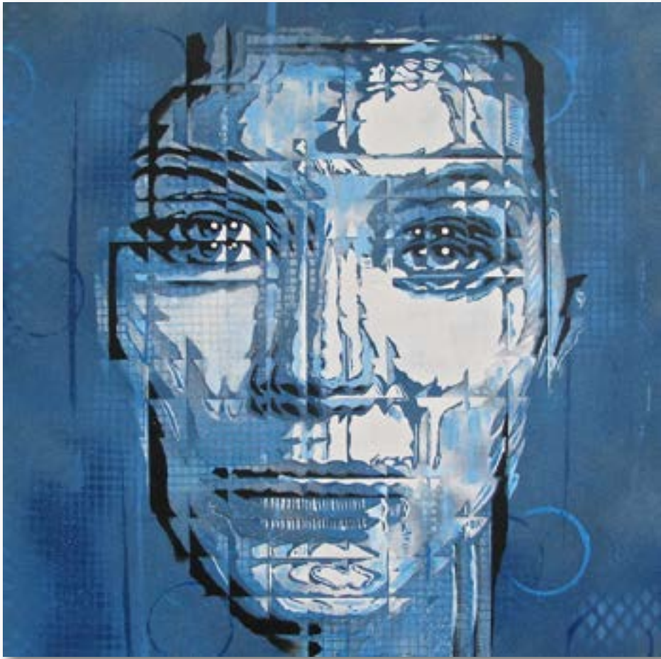
SYMPATHETIC VIBRATIONS ACRYLIC ON WOOD PANEL 20 X 20 2014