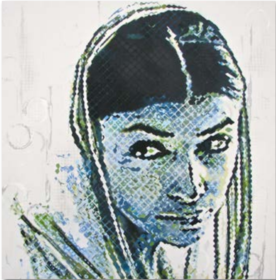
ENDURE ACRYLIC ON WOOD PANEL 24 X 24 2014