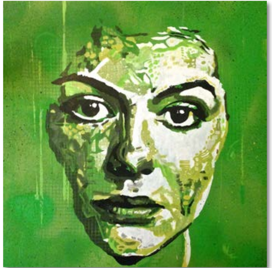
TEMPORARY BRUJA ACRYLIC ON WOOD PANEL 20 X 20 2014