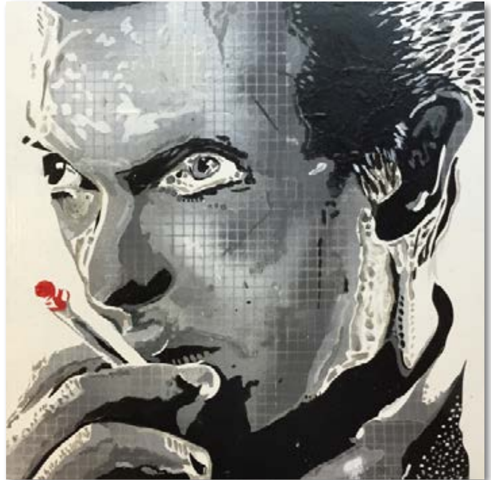
INSECT PARANOIA ACRYLIC ON WOOD PANEL 12 X 12 2015