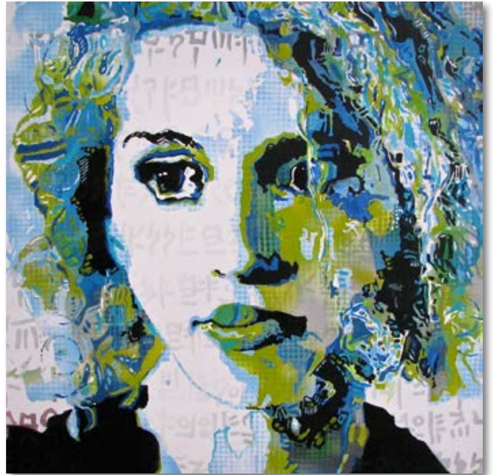
ANNIE ACRYLIC ON WOOD PANEL 24 X 24 2014