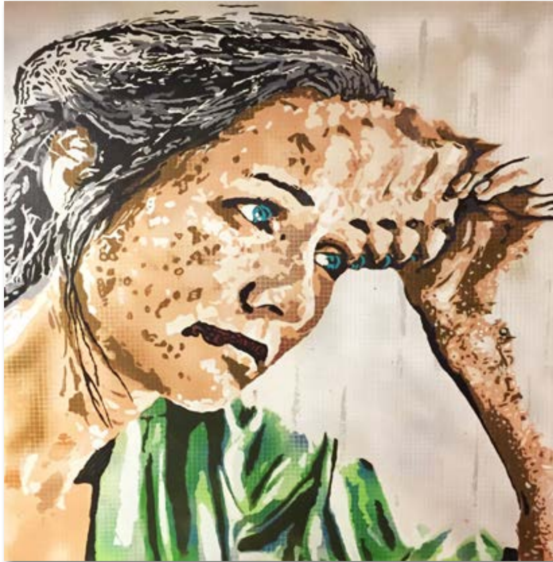
ONUS • ACRYLIC ON WOOD PANEL • 30 X 30 • 2015 2015 Finalist World Stencil Art Prize, Sydney Australia