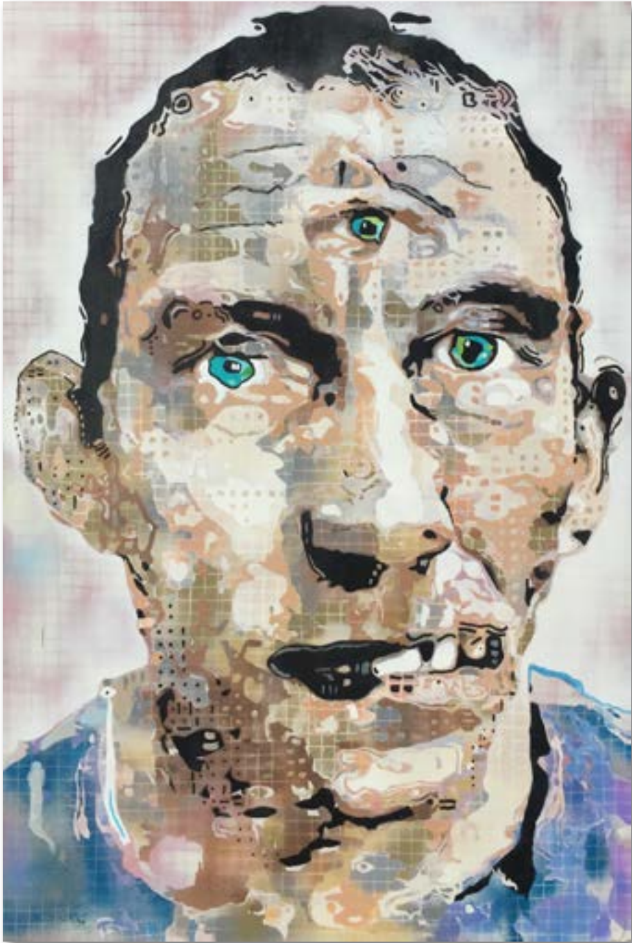
AFRAID OF OURSELVES ACRYLIC ON WOOD PANEL 24 X 30