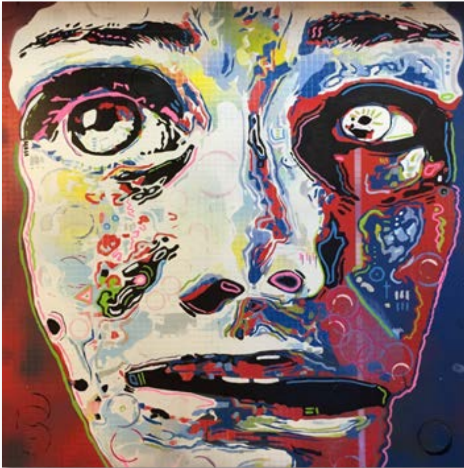
ANSIEDAD ACRYLIC ON WOOD PANEL 20 X 20 2015