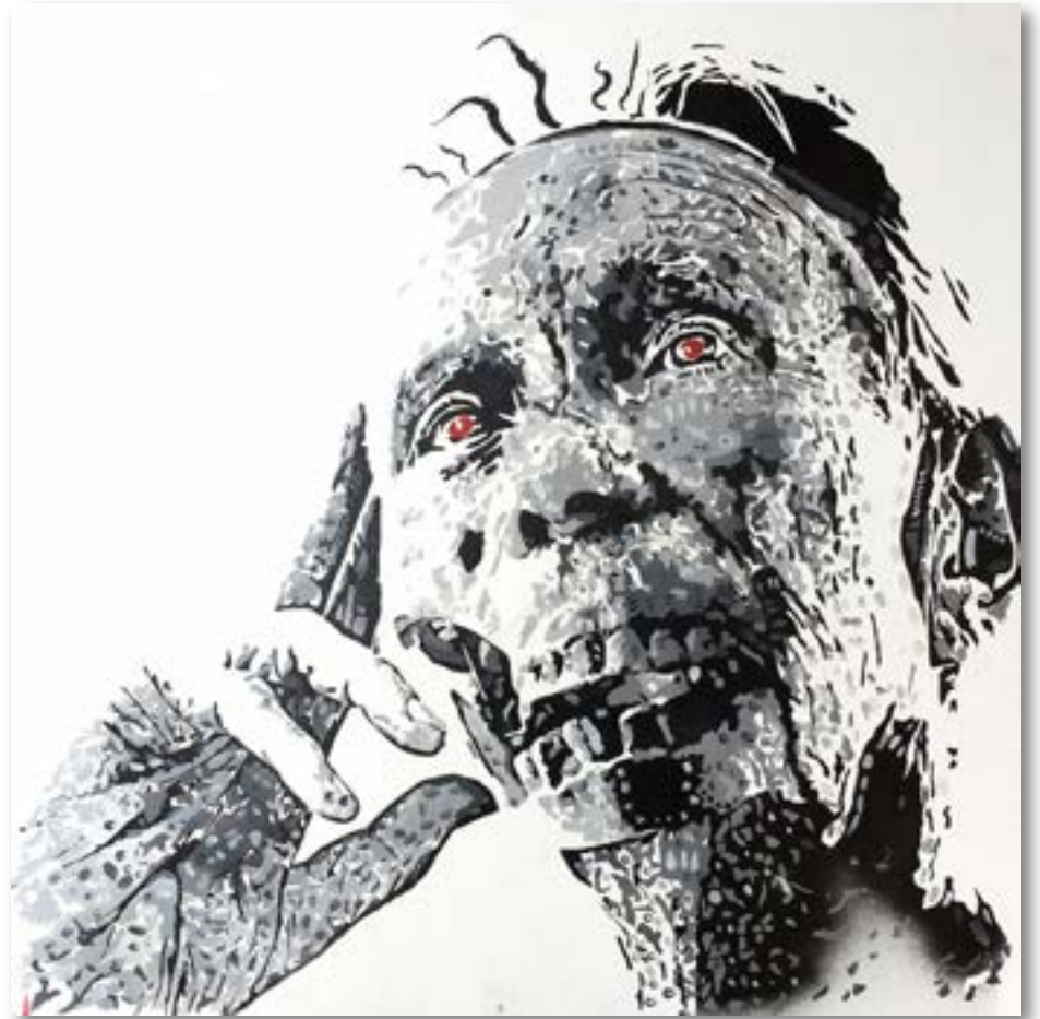
IT WAS ALL FOR NOTHING.. ACRYLIC ON WOOD PANEL 24 X 24 2015