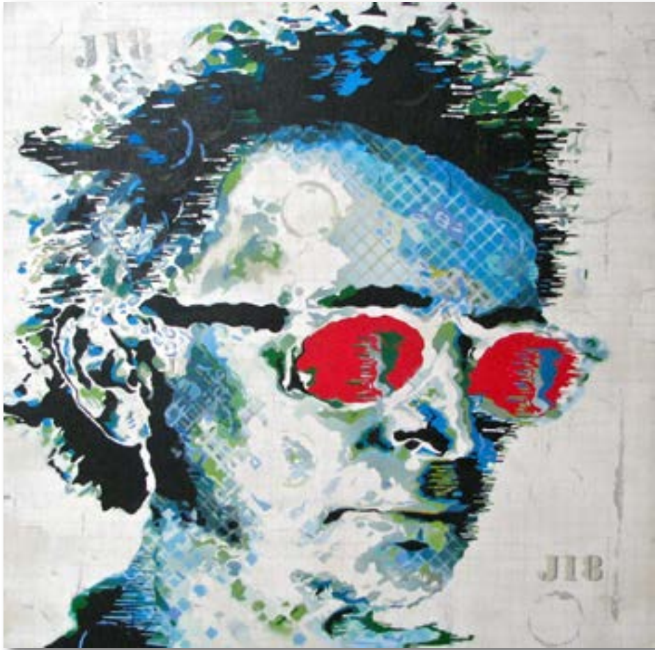
BOMB! ACRYLIC ON WOOD PANEL 24 X 24 2014