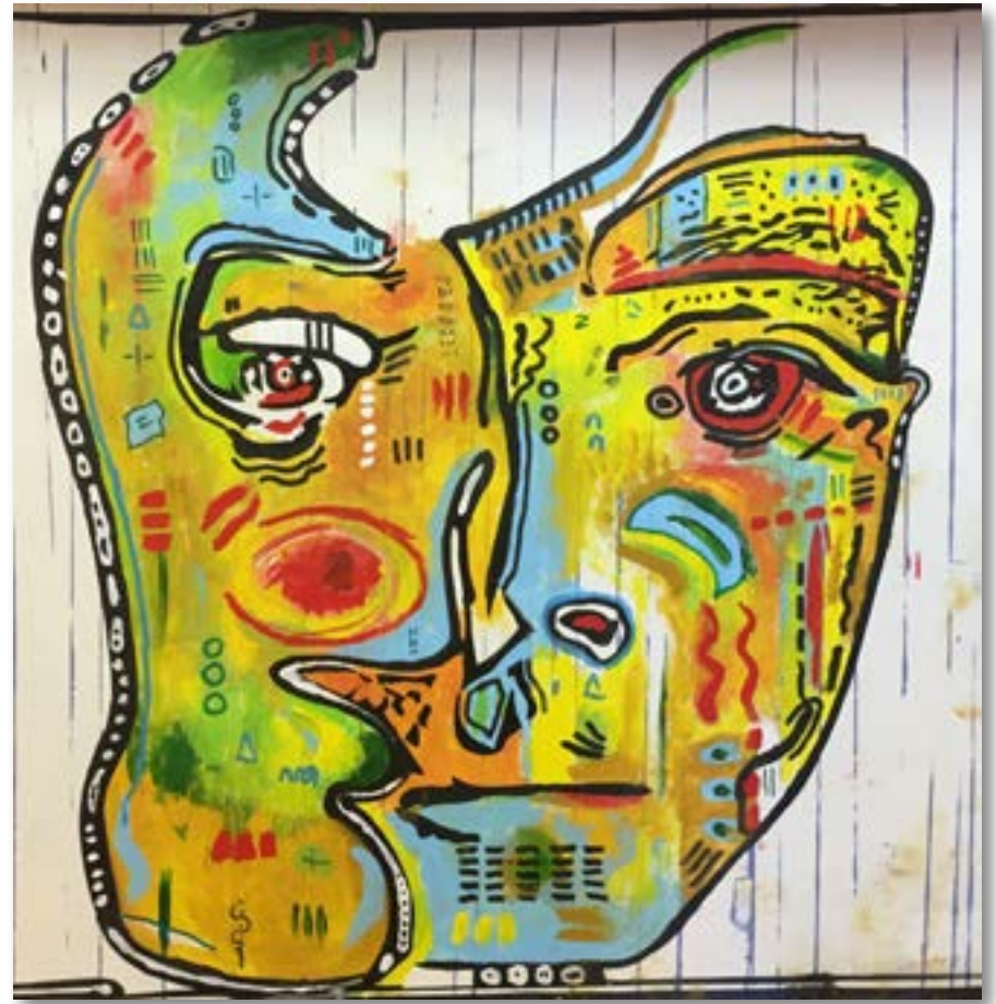
TANZEN ACRYLIC ON WOOD PANEL 20 X 20 2015