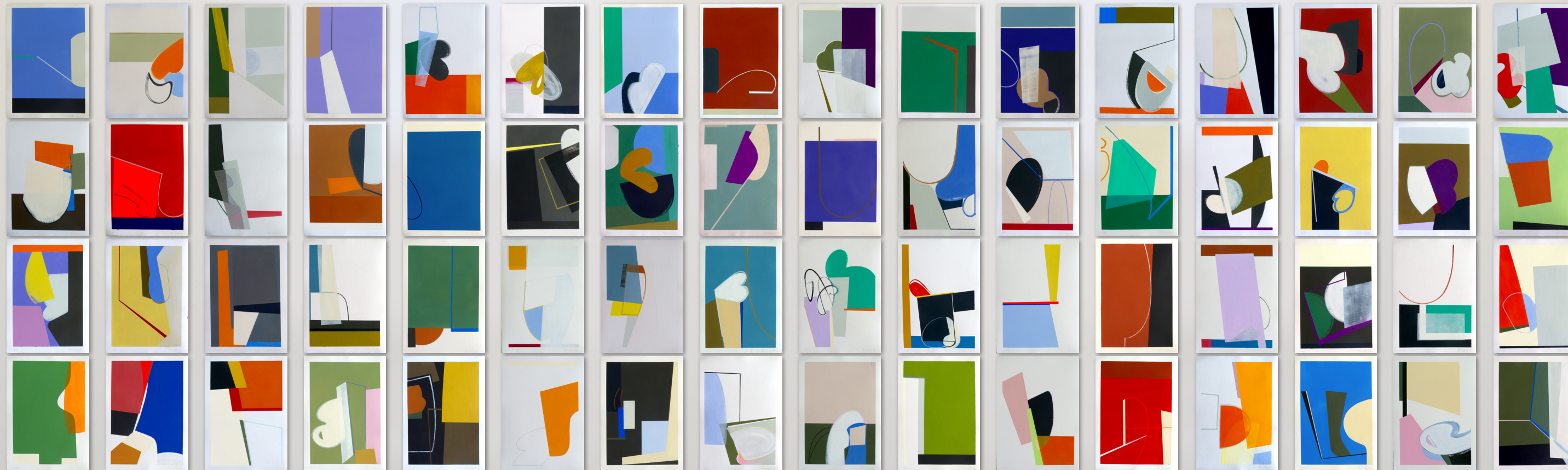
Left to right: Theoria #1-64 (2016) vinyl tempera on 100% cotton rag paper 330 x 240mm