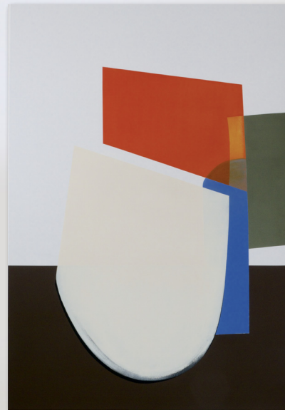
Praxis (2016) vinyl tempera & oil on canvas 1750 x 1200mm