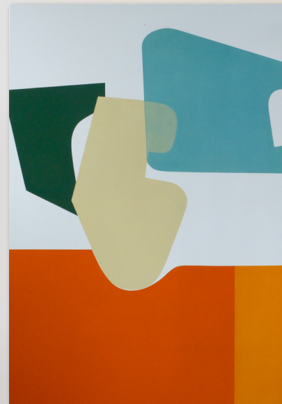
Sapientia (2016) vinyl tempera & oil on canvas 1750 x 1200mm