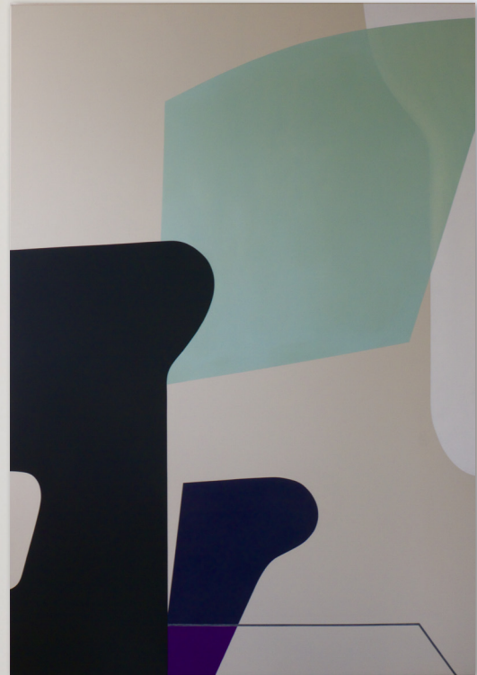
A Form of Prayer (2016) vinyl tempera & oil on canvas 2300 x 1600mm