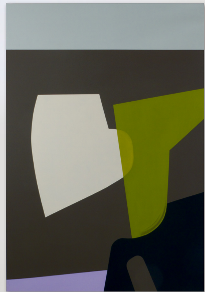
Noesis (2016) vinyl tempera & oil on canvas 1750 x 1200mm