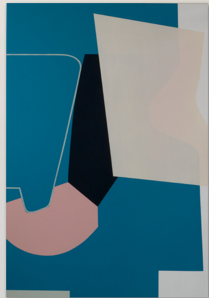
Phronesis (2016) vinyl tempera & oil on canvas 1750 x 1200mm