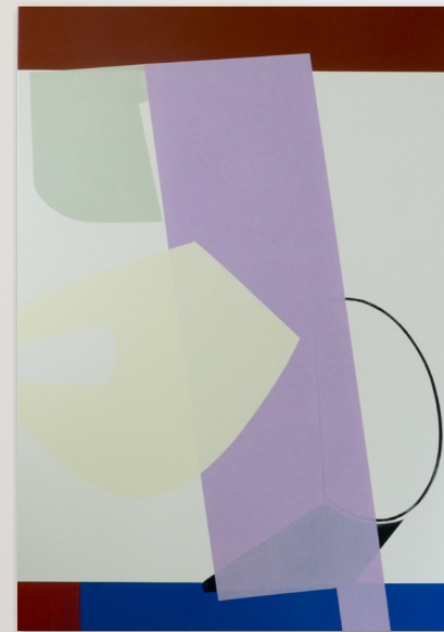
Arete (2016) vinyl tempera & oil on canvas 1750 x 1200mm