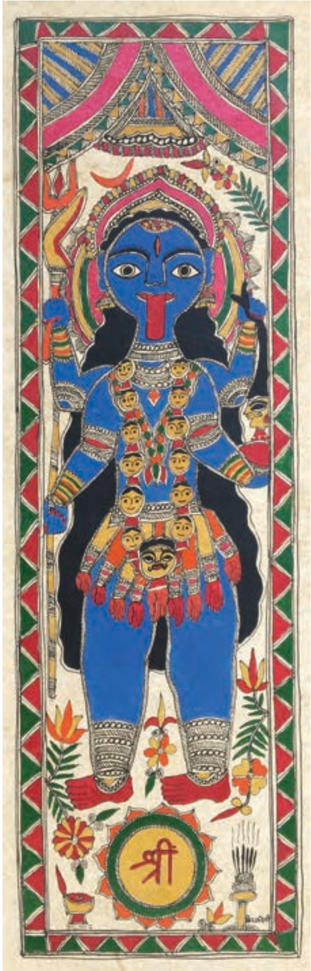
Kiran Devi, Kali , 1999, acrylic on paper, 22" x 7 1/2"