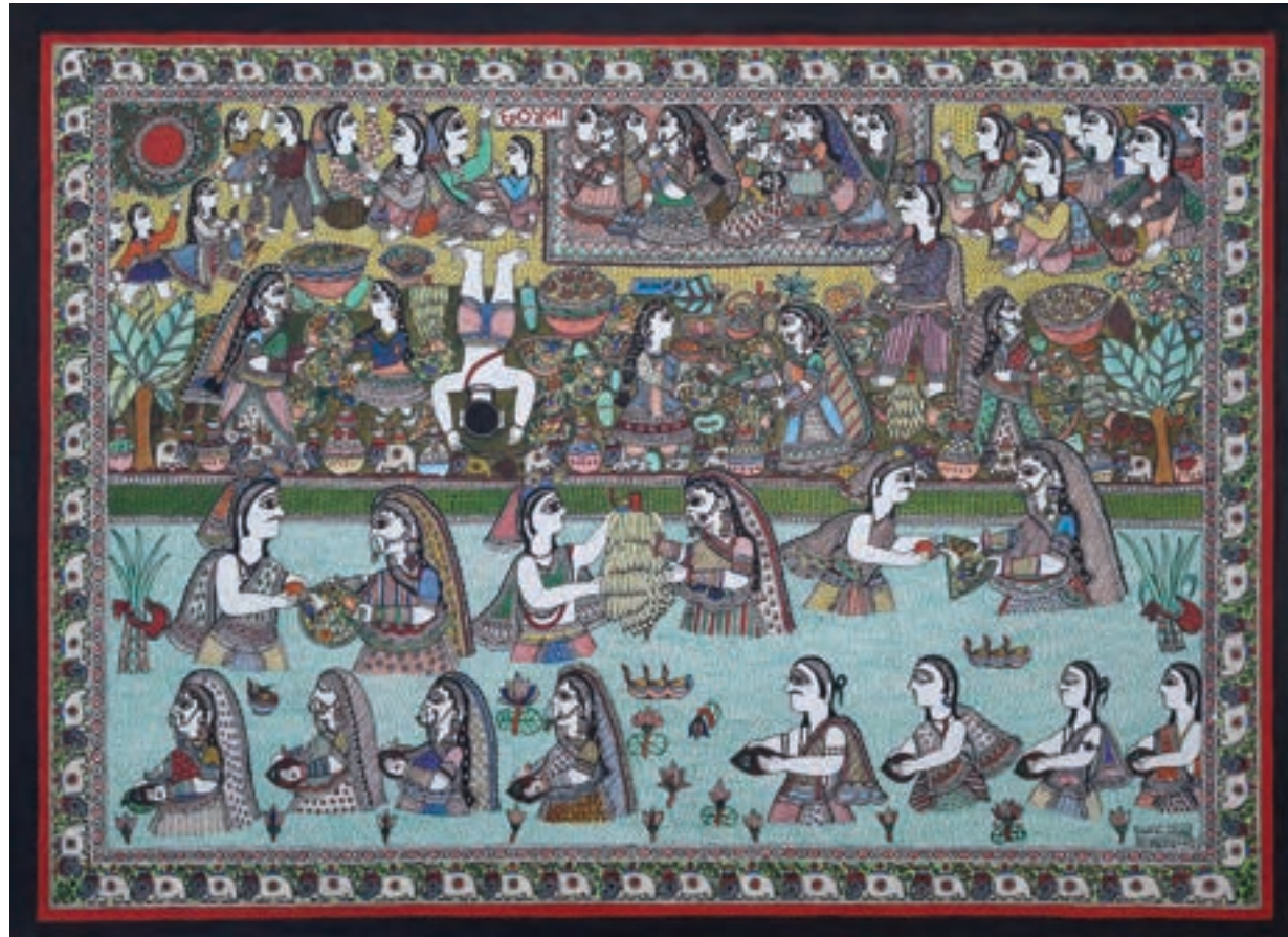
Nisha Jha, Chaath—The Incredible Festival of India , 2021, acrylic on paper, 22" x 30"