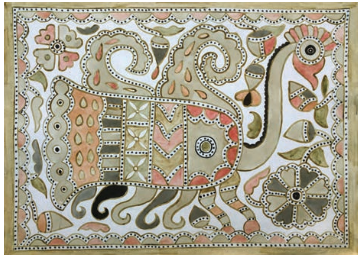
Shanti Devi, Sadul Bird , natural pigments on paper, 22" x 30"