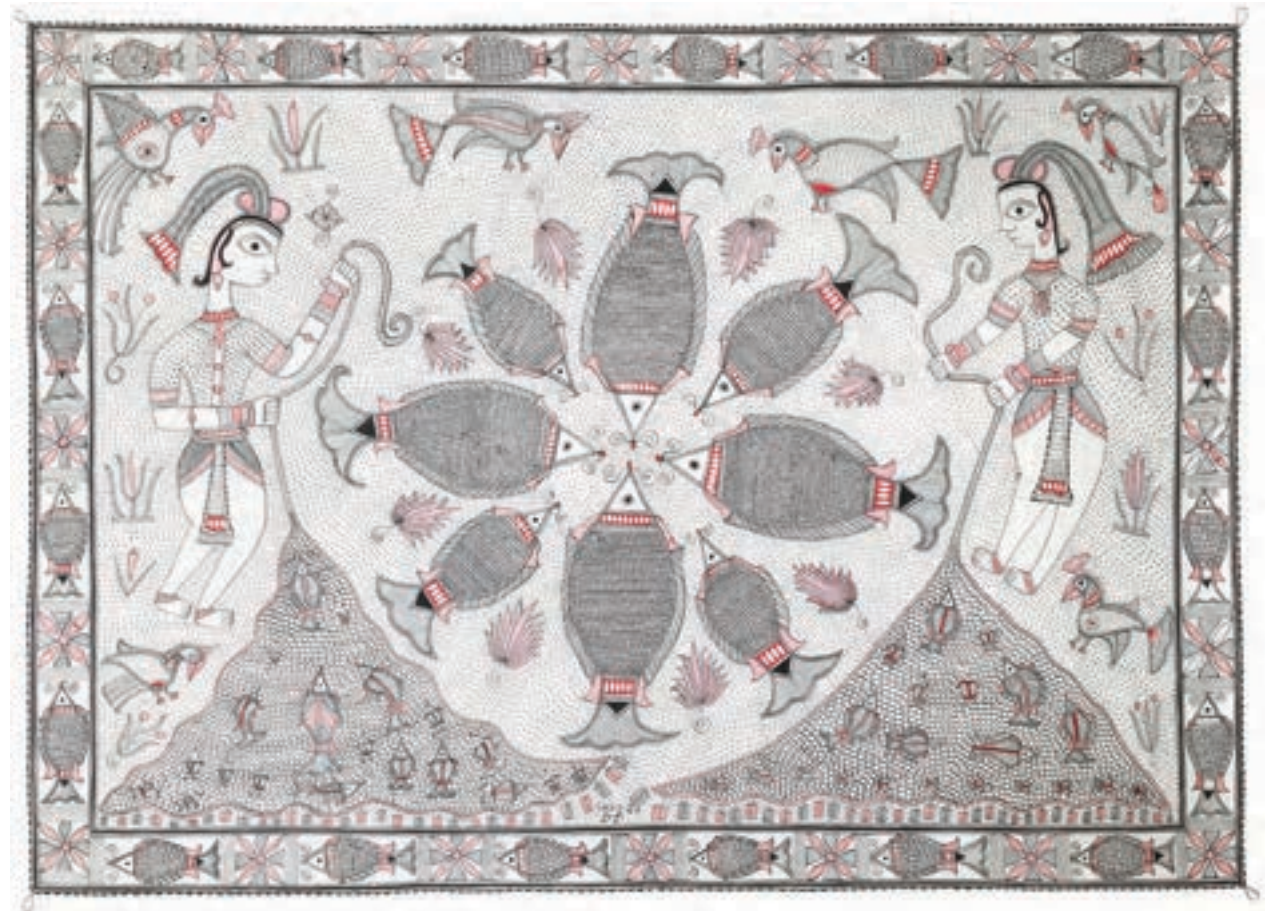
Bimila Dutta, Fishermen , ink on paper, 22" x 30"