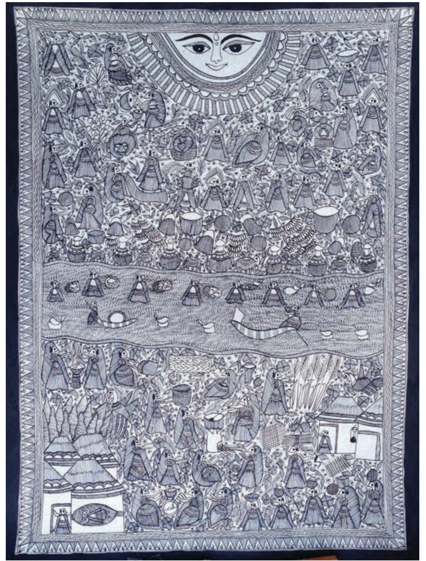
Urmilla Devi, Chhath Puja , 2014, ink on paper, 30" x 22"