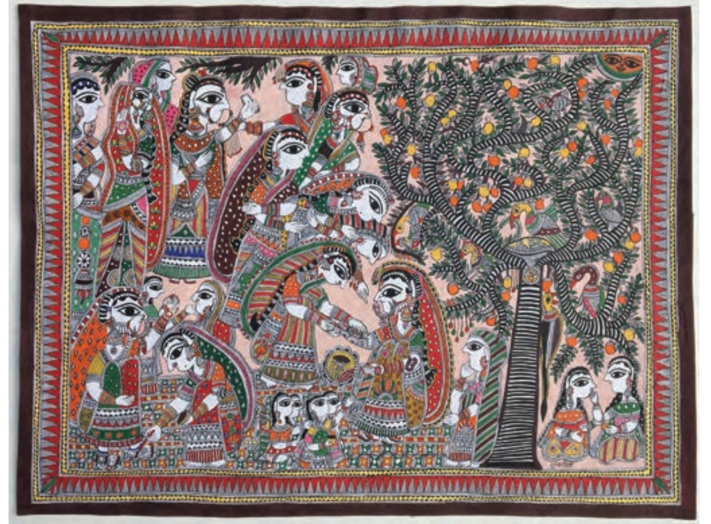
Dulari Devi, Marriage Preparations , 2021, natural pigments and ink on paper, 20" x 29"