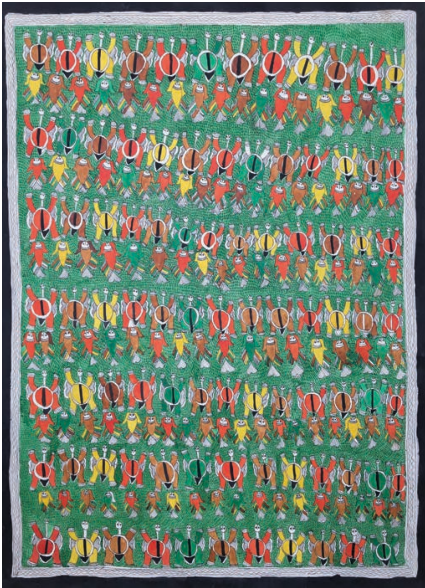
Lachhamaiya Devi, Tortoises and Fish , 2010, ink and acrylic on paper 22" x 30"