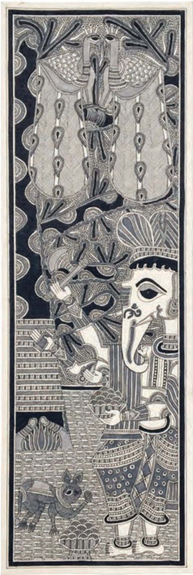
Rakesh Paswan, Ganesh , 2016, ink on paper, 7 3/4" x 23"