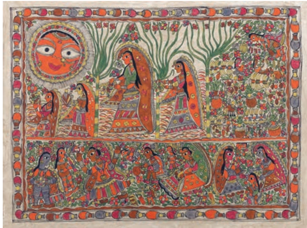
Rampari Devi, Festival Worship of the Sun , 2005, natural pigments on paper, 22" x 30"