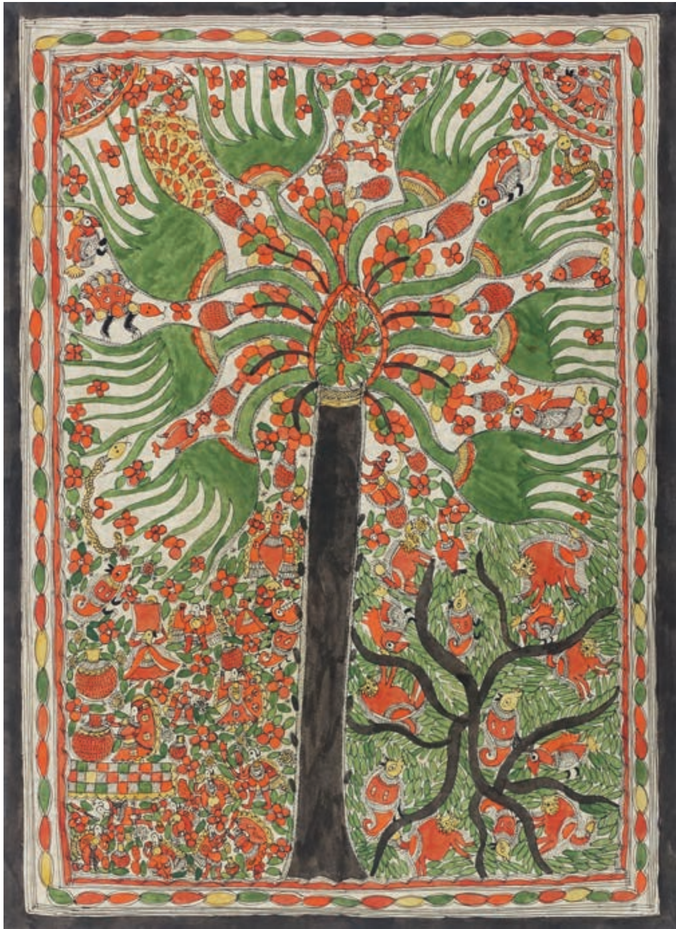
Lalita Devi, Toddy Palm, Animals, Birds and Village , 2004, natural pigments on gobar (dung wash) 30" x 22"