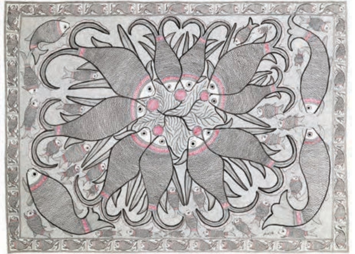
Leela Devi, Fish Pond , ink on paper, 22" x 30"