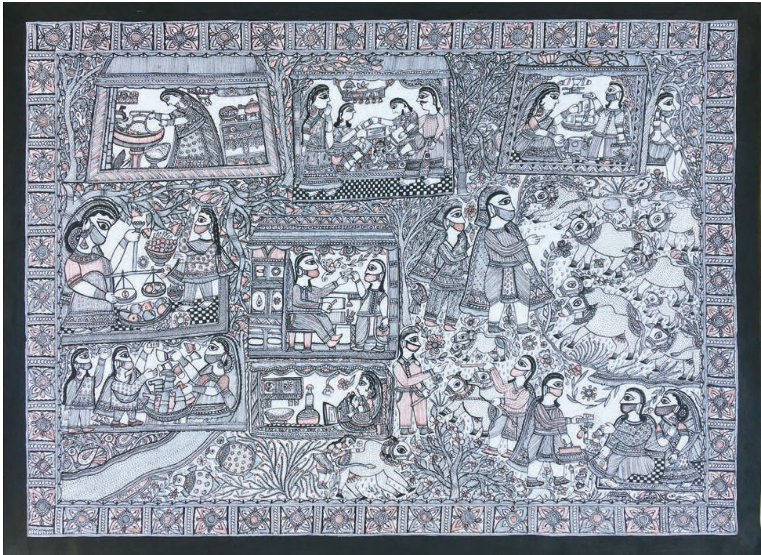
Vinita Jha, Responsibilities of Women During Covid , 2021, ink on paper, 22" x 30"