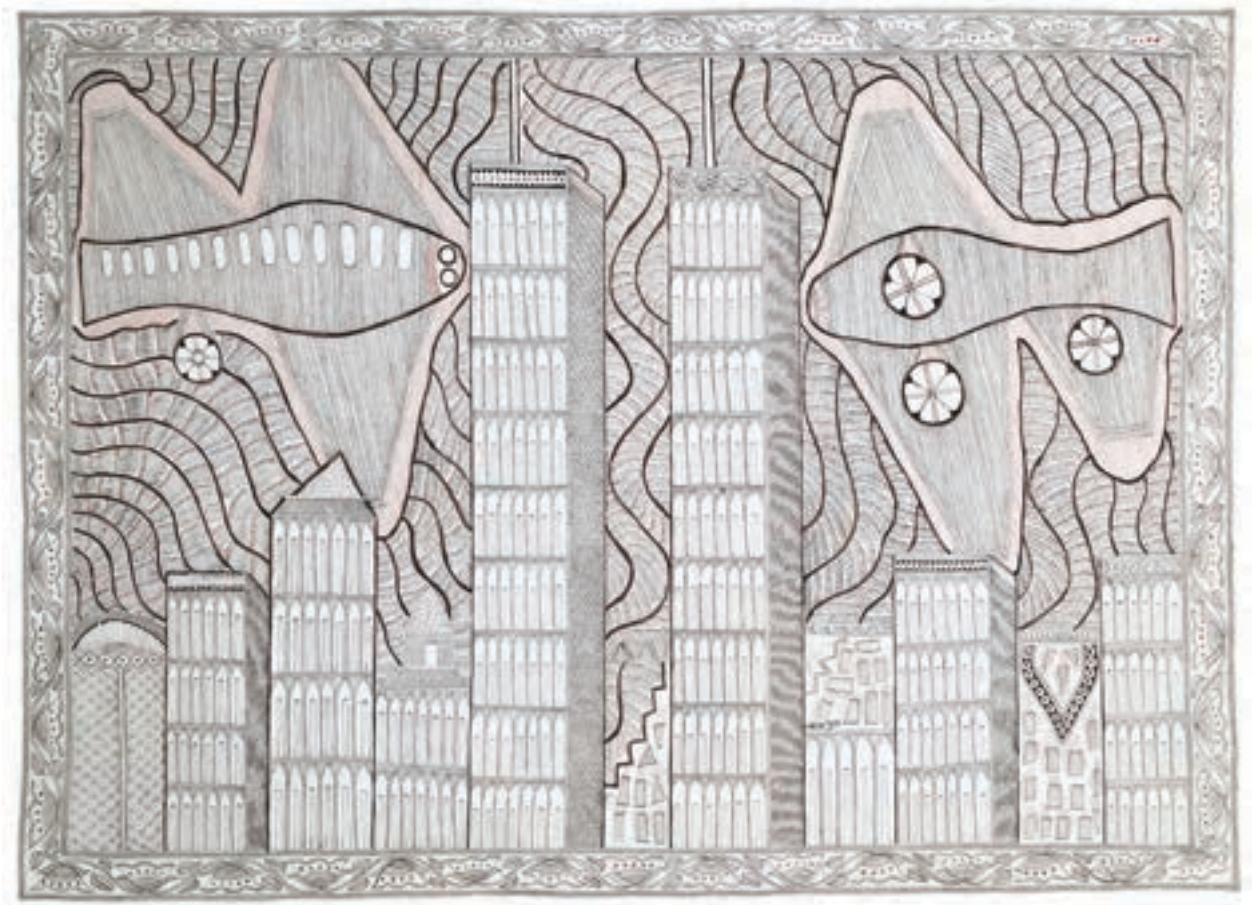
Leela Devi, 9-11 , ink on paper, 22" x 30"