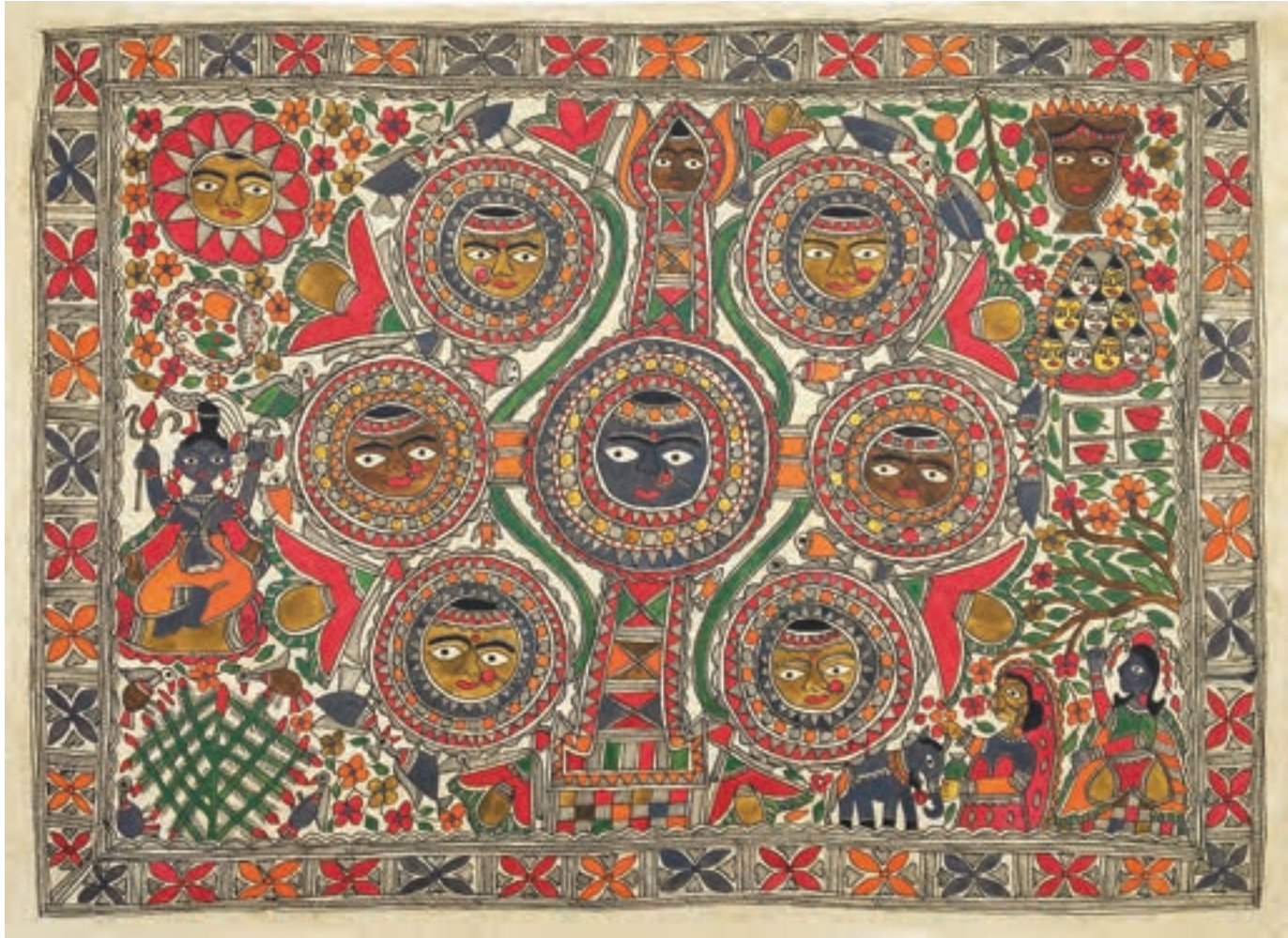
Umar Shankar Prasad, Kohbar , 2002, ink and natural pigments on paper, 22" x 30"

A kohbar is one of the most distinctive and a core image in Mithila art of which there are many variations including those using a standard iconography as well as new interpretations. Richly imbued with symbolism a kohbar is traditionally painted quite elaborately on the wall of the nuptial chamber usually accompanied by images of gods and goddesses. It is where the bride and groom spend their first four nights, watched over by an older woman, who discretely leaves on the 4th night of the marriage rituals, when the marriage is consummated.