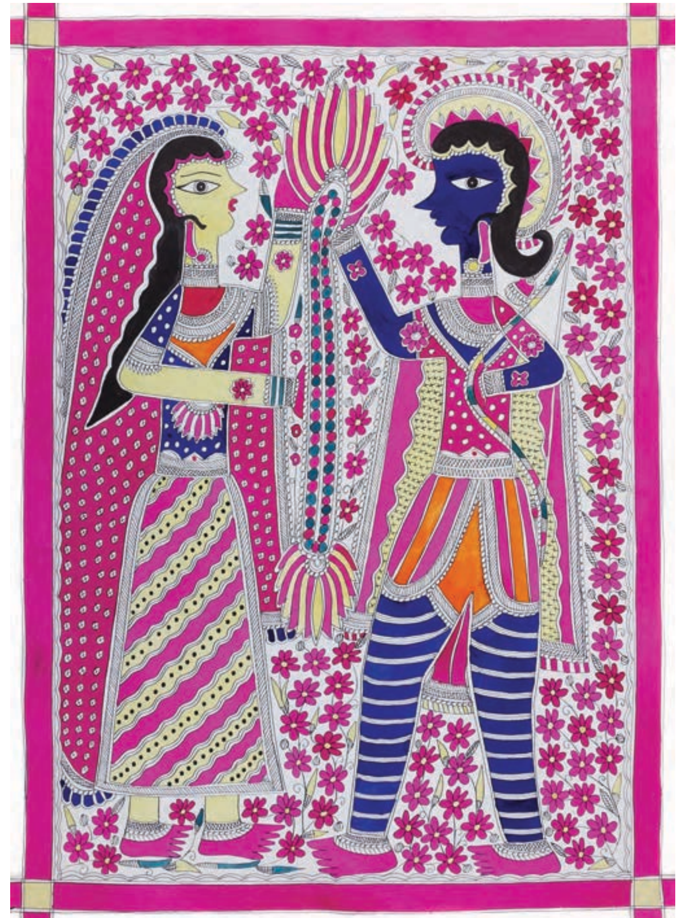
Baua Devi, Sita Garlanding Ram , 1977, natural pigments on paper, 30" x 22"