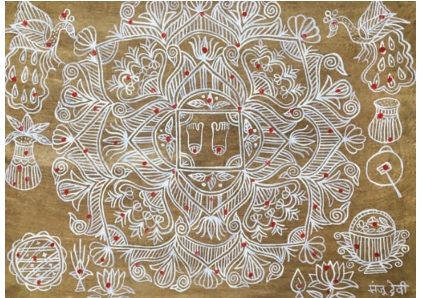
Manju Devi, Aripa , natural pigments on gobar, (paper coated with cow dung) 22" x 30"

An aripa, also referred to as rangoli, or kollam in other regions of India, is an ephemeral floor drawing made from materials such as clay, rice flour, colored sand, rocks or even flower petals. Traditionally made by women as an everyday ritual, or for festivals or auspicious events, they are created over a purifying layer of cow dung and water.