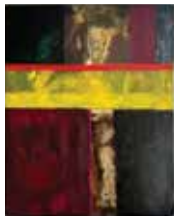
#3 Verona, 2022 Oil, plaster, wood 14 x 12" x 1.5" 2,400