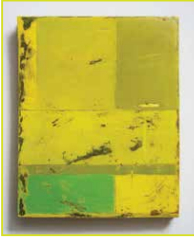
Lightblocks , pigment prints, resin, oil, wood, 2023