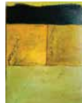
#7 Havana, 2020 Oil, plaster, wood 14 x 12" x 1.5" 2,400