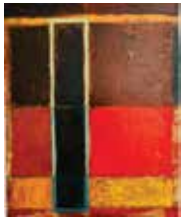
#1 Mexico City 2021 Oil, plaster, wood 14 x 12" x 1.5" 2,400