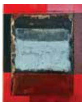
#4 Querini Stampalia #3 2022 Oil, plaster, wood 13 x 11" x 1.5" 2,100