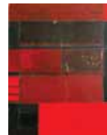
#6 Querini Stampalia #2 2022 Oil, plaster, wood 13 x 11" x 1.5" 2,100