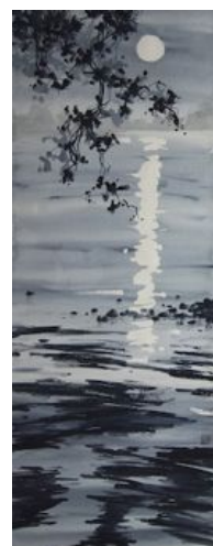
Abundance 76x28cm watercolor 2012