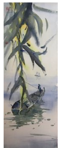
Roots 76x28cm watercolor 2012