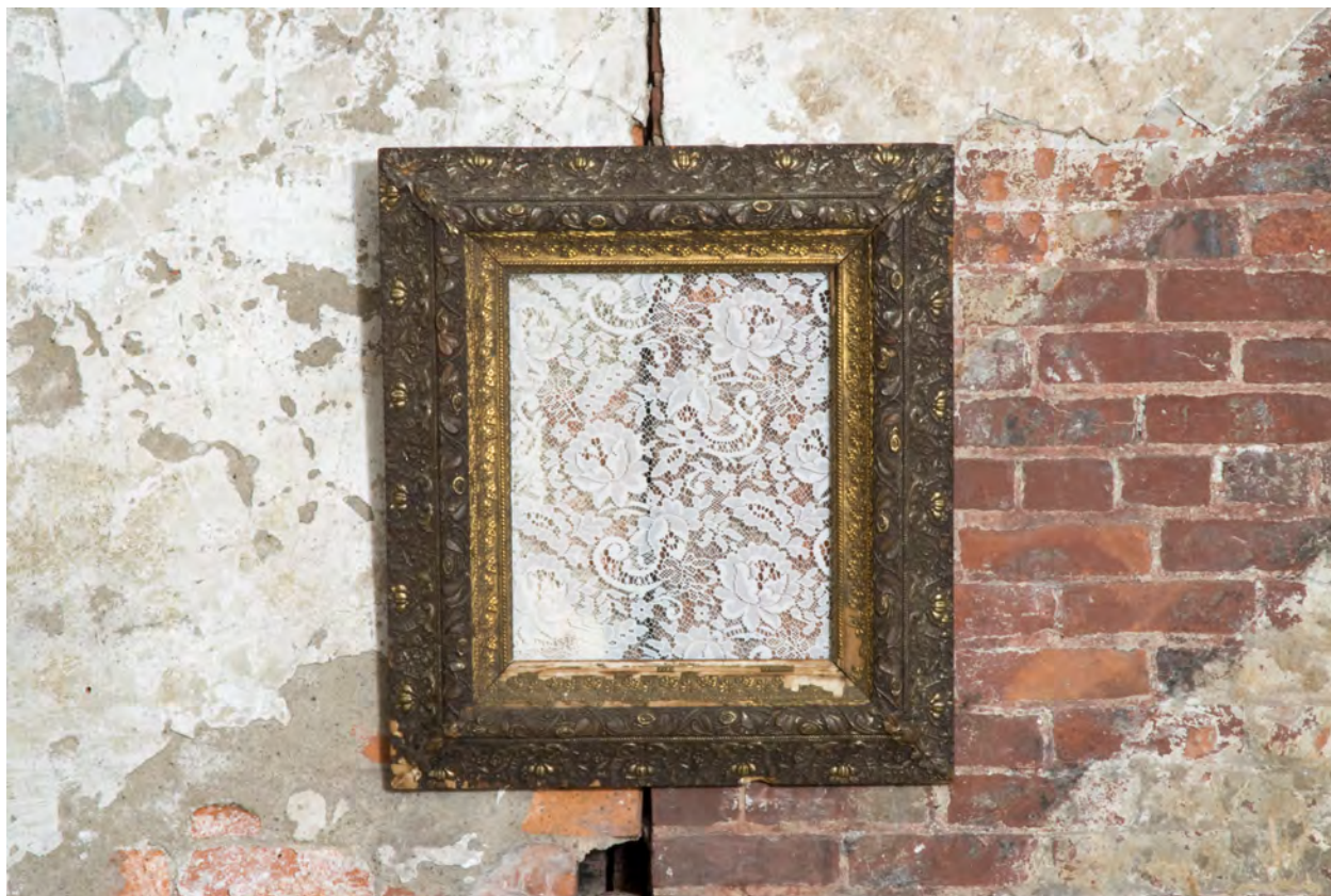
Eric , donated frame and lace, lights, 2008