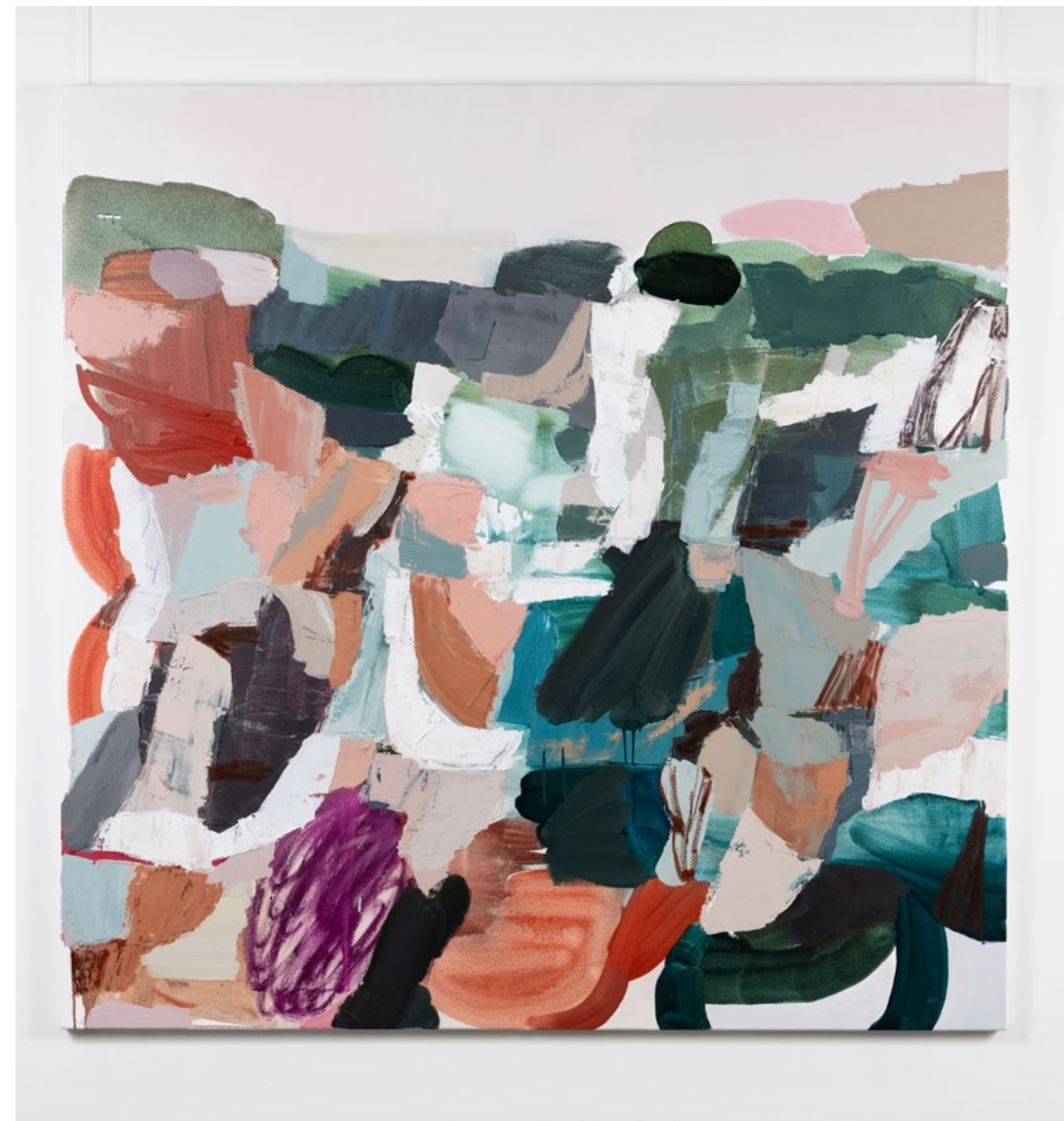
Sum of Parts, Interlude, 2023 oil and beeswax on canvas, 150 x 150cm, unframed $9,500 AUD