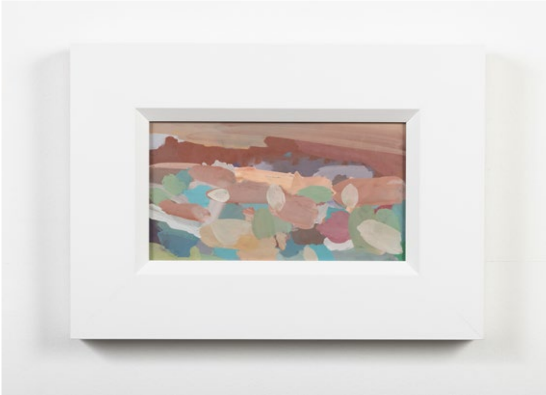
After Trephina Walk II, 2023 gouache on board 25 x 35cm, framed $950 AUD