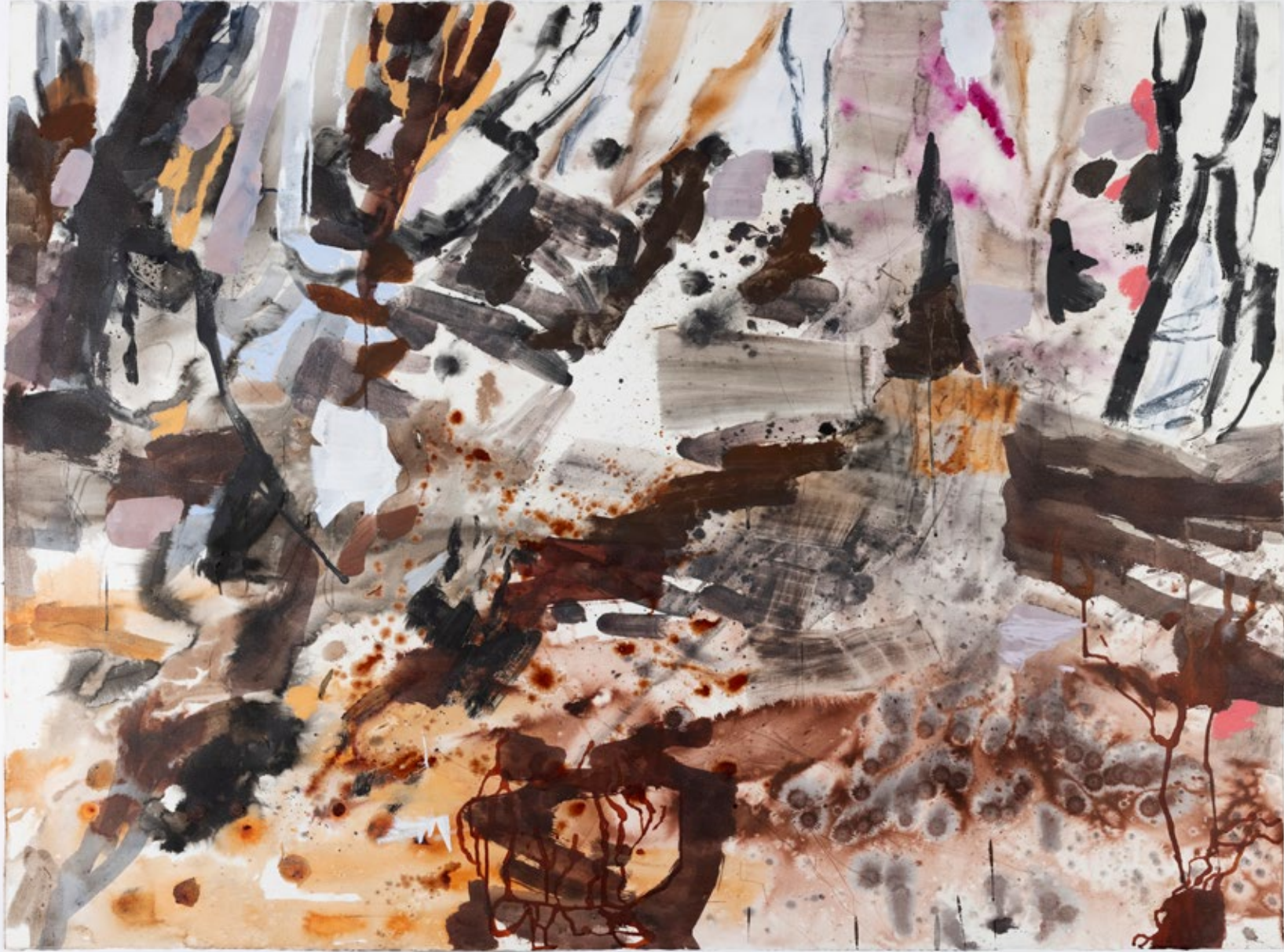
Cross-Pollination (Arve River Campfire) , 2023 mixed media on 300gsm Arches, 114 x 150cm, unframed $4,700 AUD