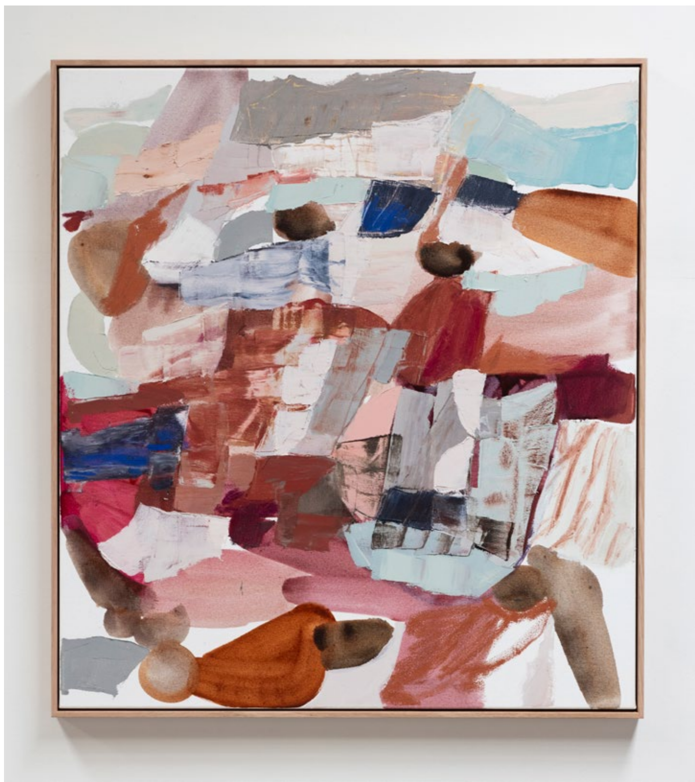
Hartz Mountains (Glacial Lakes and Coral Fern) , 2023 oil on canvas, 103 x 93cm, framed $4,000 AUD