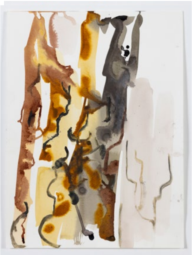
Termite Markings II 2023 mixed media on paper 42 x 29.5cm, unframed $400 AUD