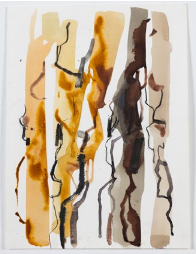
Termite Markings I 2023 mixed media on paper 42 x 29.5cm, unframed $400 AUD