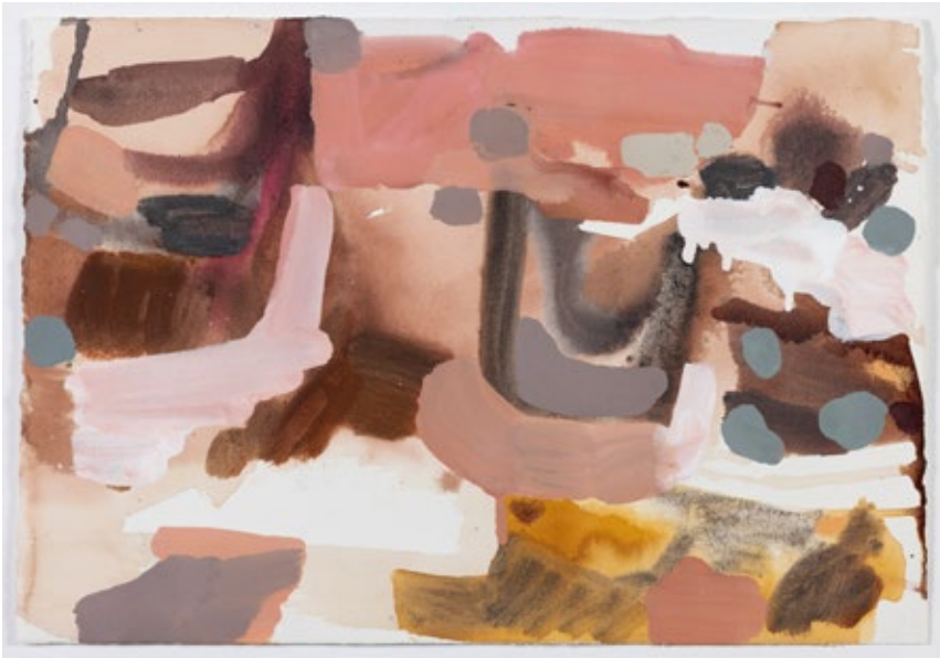
Day 1 Tjoritja, Facing N'Dhala Gorge Face, 2023 mixed media on paper, 44 x 61cm, (51 x 68cm framed) $1,200 AUD