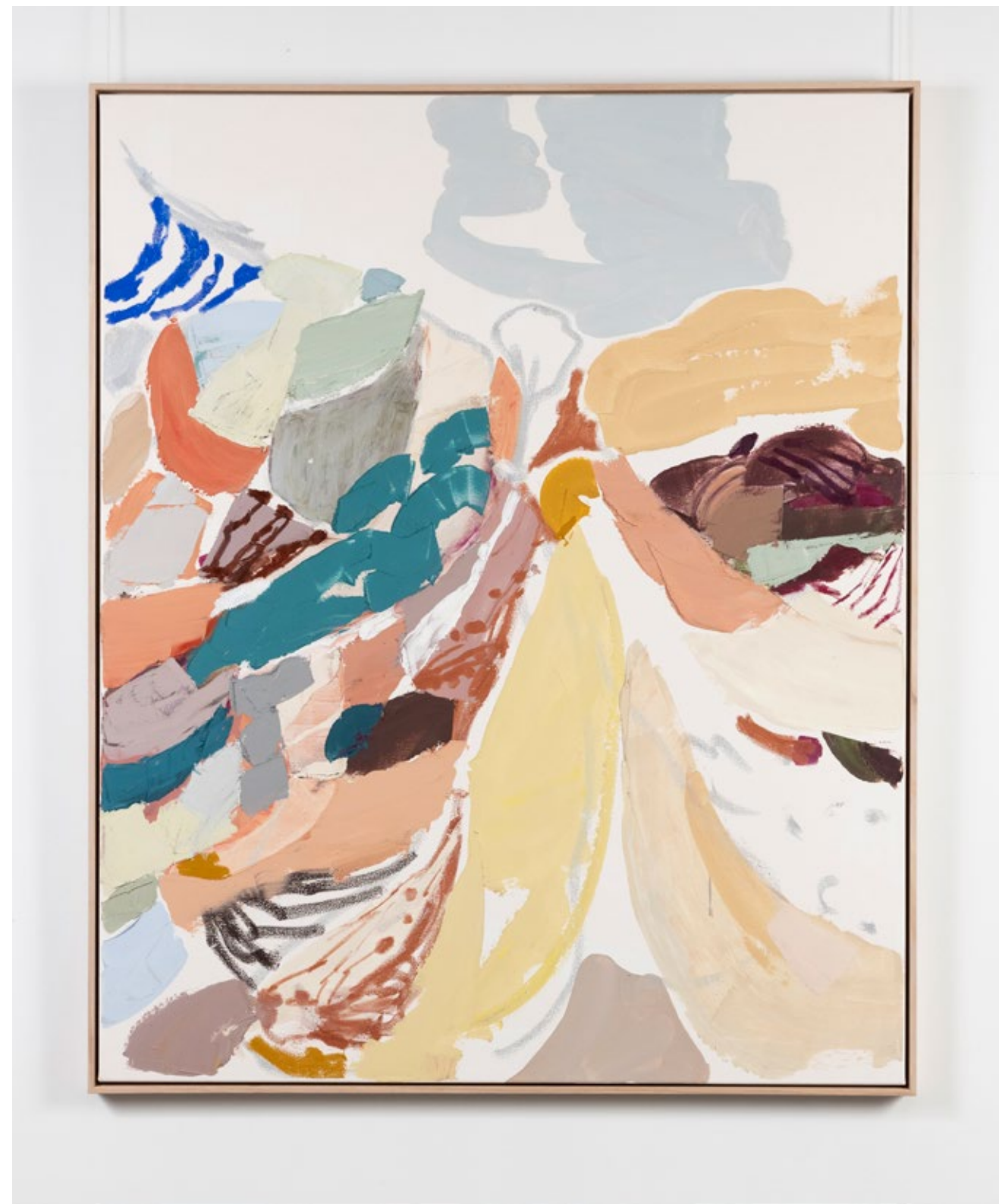
Sitting in Tjoritja, East Mac Ranges (Ochre Hill Medley II) , 2023 oil on canvas, 135 x 110cm, (138 x 113cm framed) $6,900 AUD