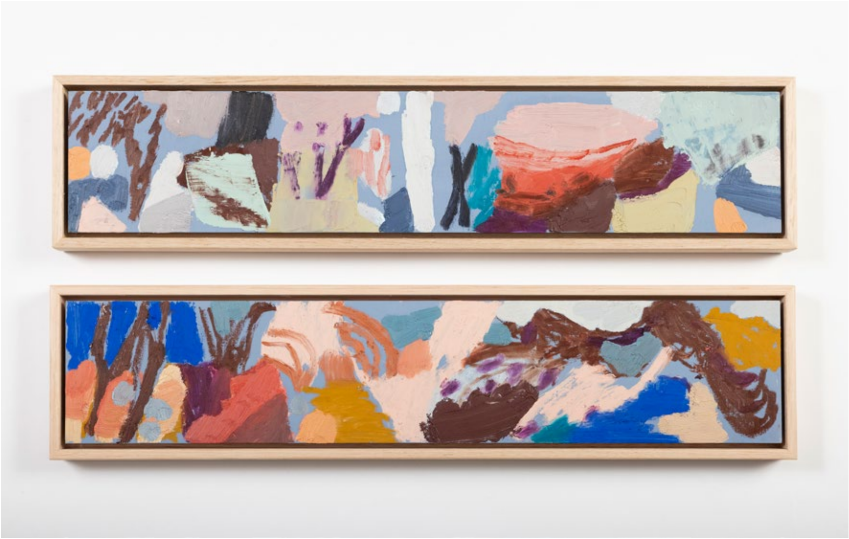
Ross River Homestead (Window View) I , 2023 oil on board, 17 x 63cm, framed $1,200 AUD