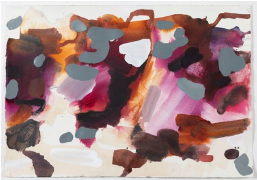
Day 1 Tjoritja, N'Dhala Gorge, facing north, 2023 mixed media on paper, 44 x 61cm, (51 x 68cm framed) $1,200 AUD