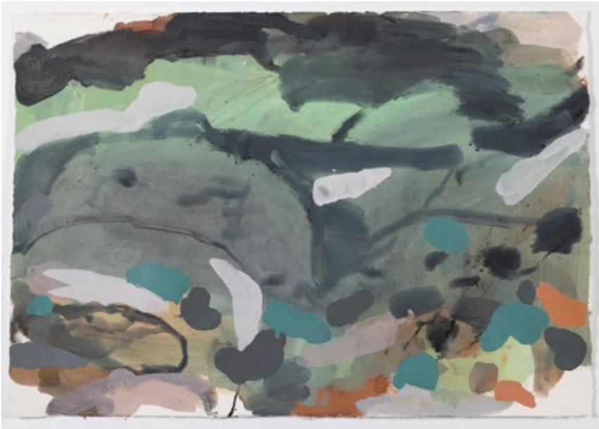
Day 3 Tjoritja_In the periphery, 2023 mixed media on paper, 44 x 61cm, (51 x 68cm framed) $1,200 AUD