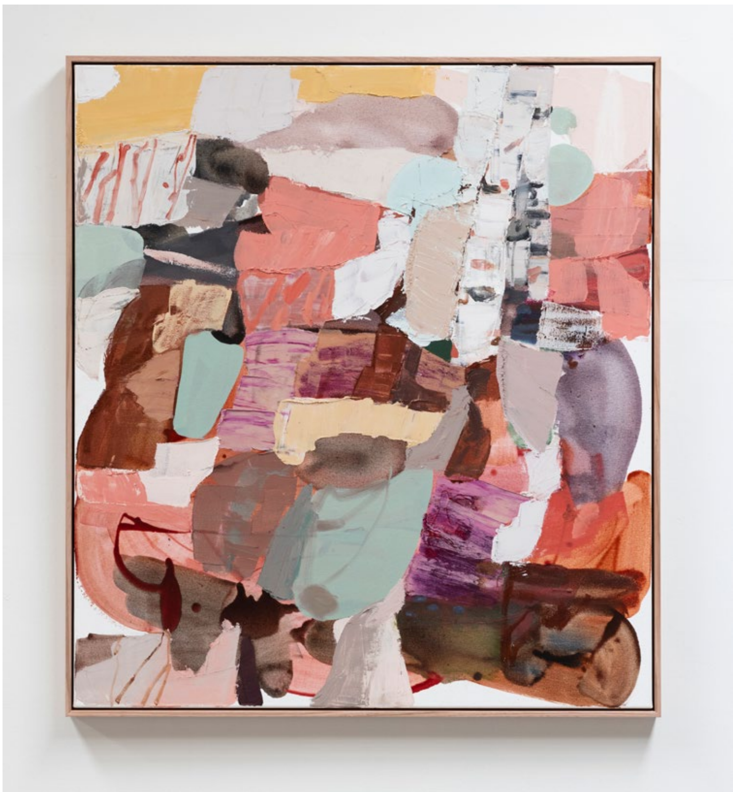
Hartz Mountains (In the Midst of Mist, Silver Birch) , 2023 oil on canvas, 103 x 93cm, framed $4,000 AUD