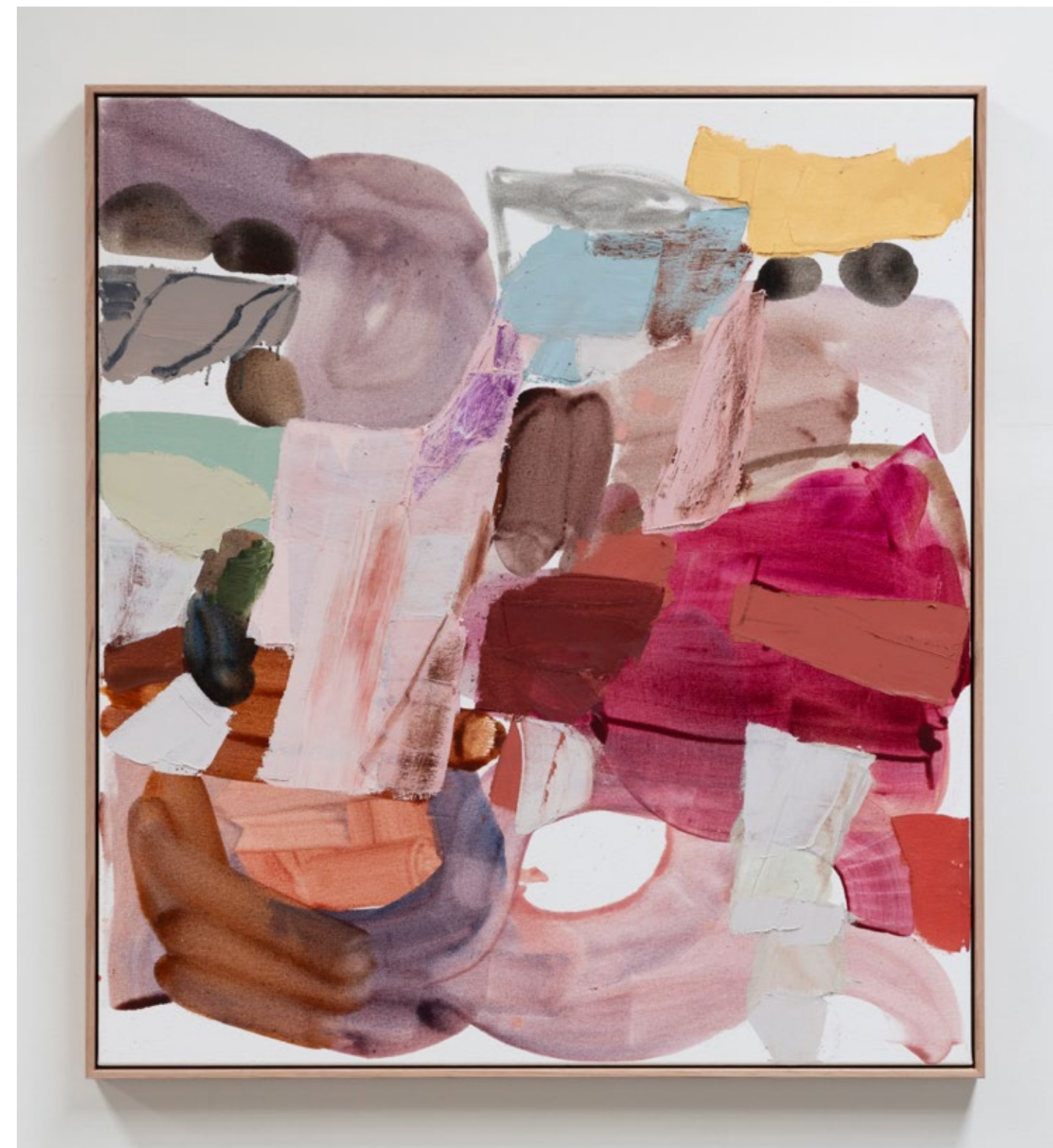
Hartz Mountains (In the Alpine Plateau) , 2023 oil on canvas, 103 x 93cm, framed $4,000 AUD