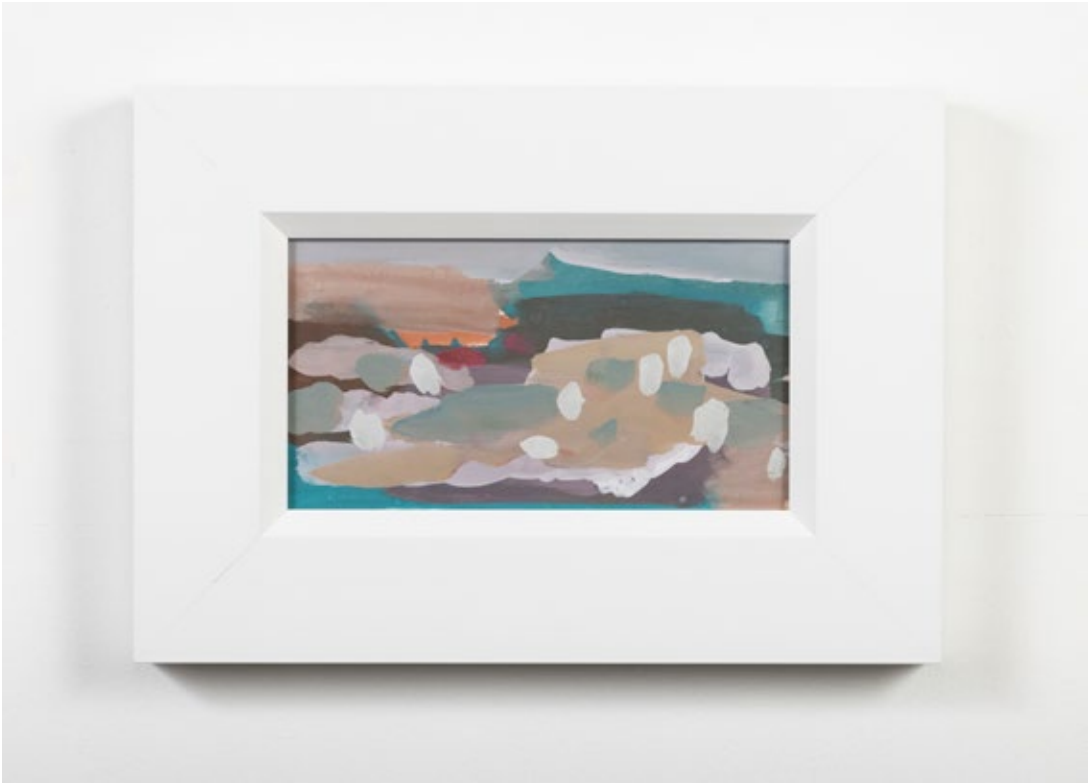
After Trephina Walk I, 2023 gouache on board 25 x 35cm, framed $950 AUD