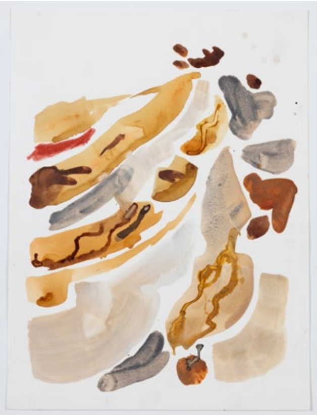
Drawn In (riverbed to ochre cliff), 2023 mixed media on paper, 42 x 29.5cm, unframed $400 AUD