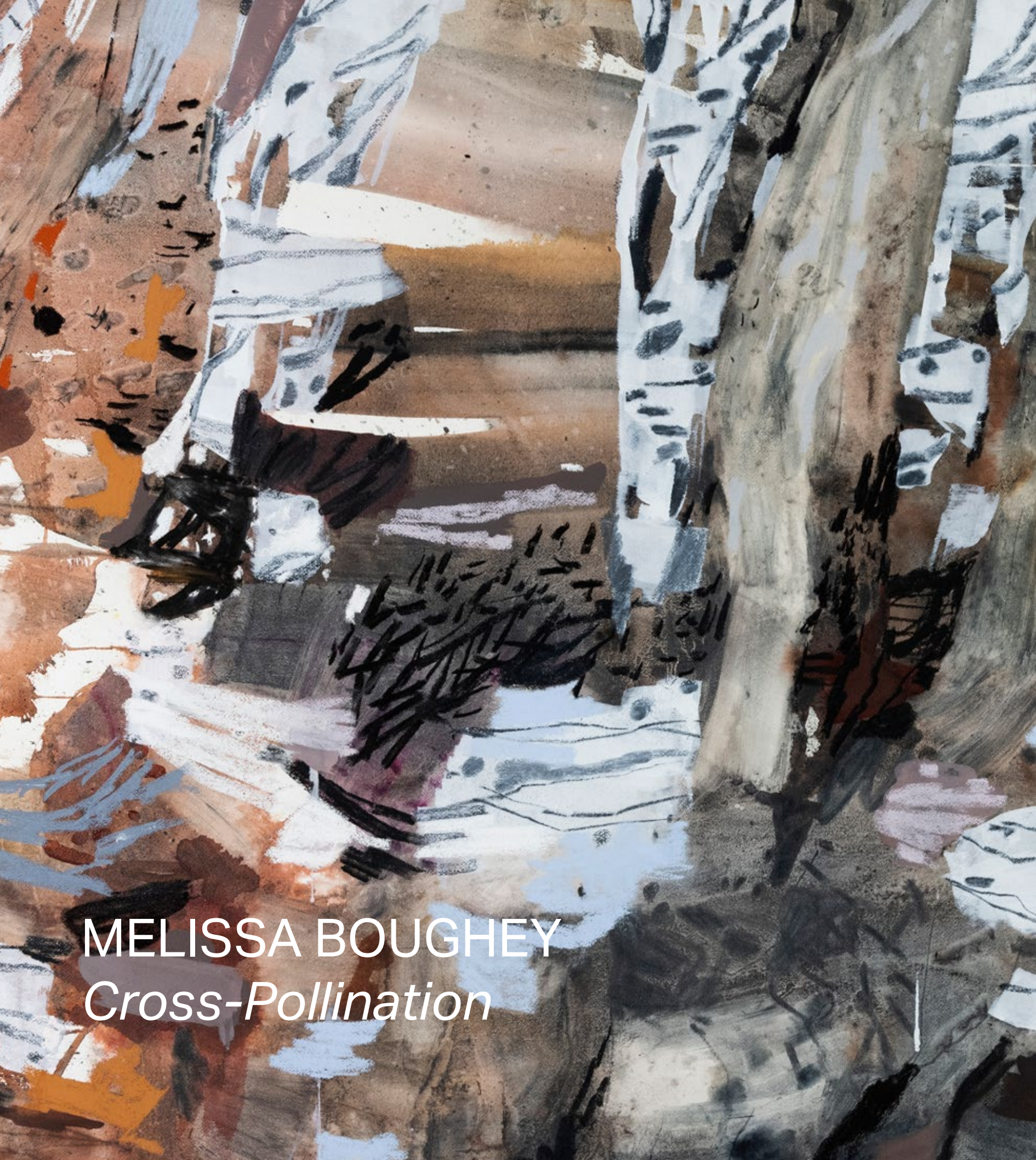
MELISSA BOUGHEY Cross-Pollination