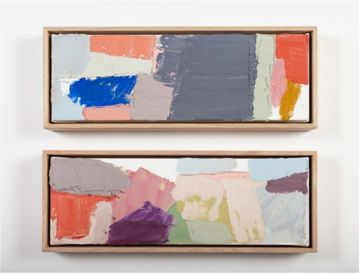
End of Day (Palette Notes) II , 2023 oil on board, 21 x 46cm, framed $950 AUD