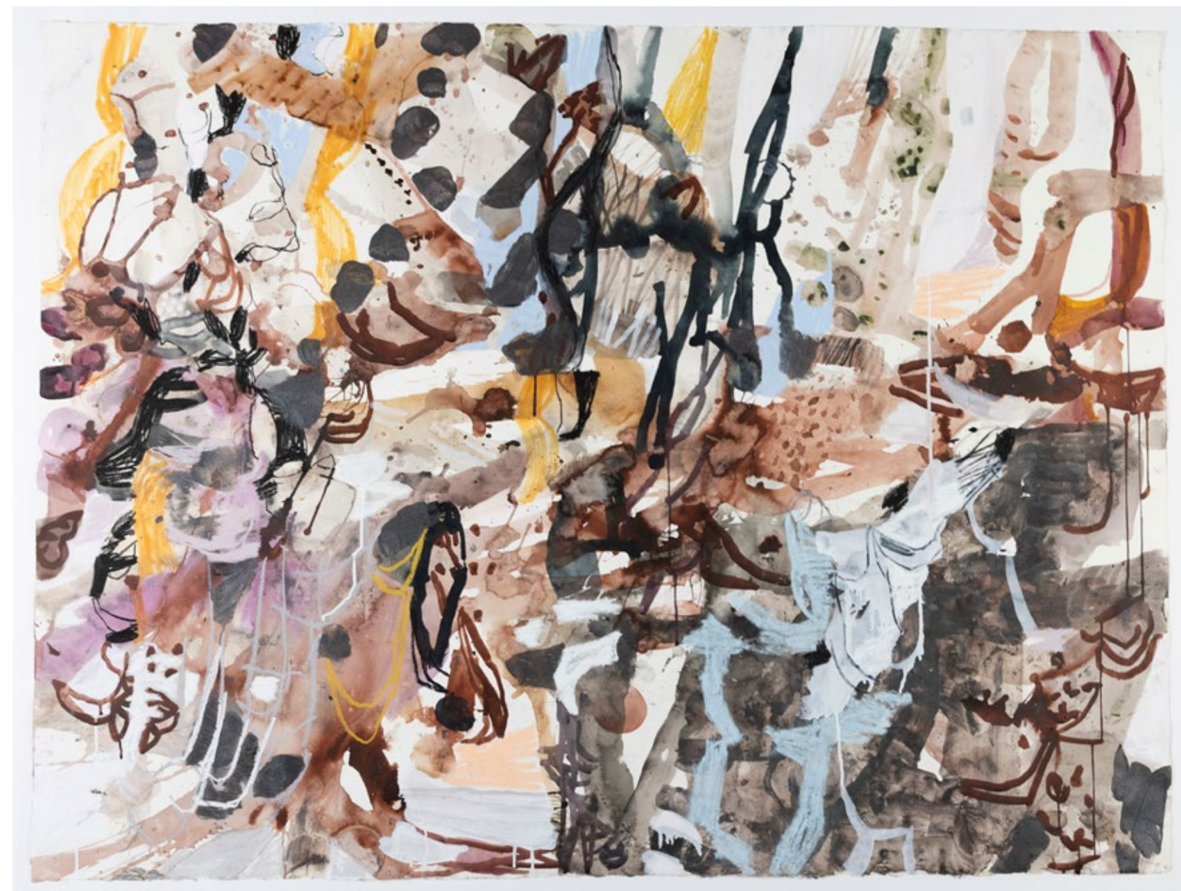
Cross-Pollination (Parry's Inlet, where the osprey feeds), 2023 mixed media on 300gsm Arches, 114 x 150cm (122 x 158cm charcoal-stained oak frame) $5,900 AUD