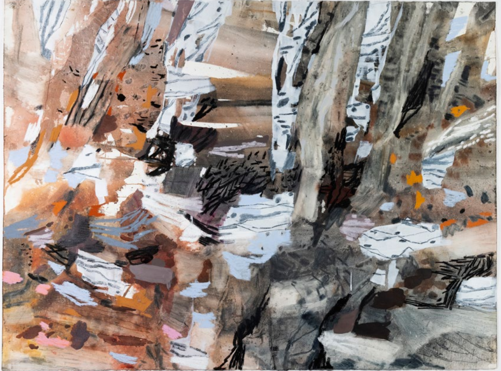
Cross-Pollination (Silver Birch Walk, Morse ode) , 2023 mixed media on 300gsm Arches, 114 x 150cm, unframed $4,700 AUD