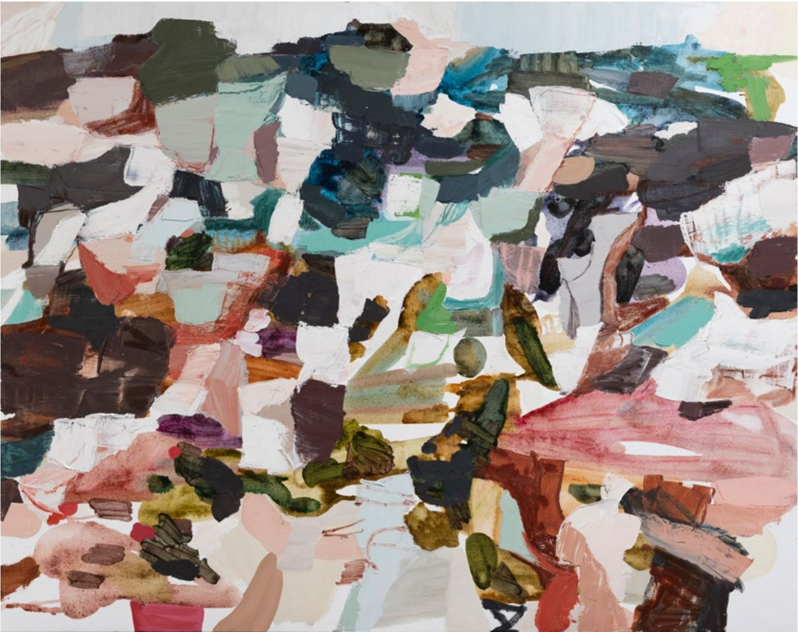
From Arve River to Miena, 2023 oil on linen, 157 x 198cm, unframed $12,000 AUD