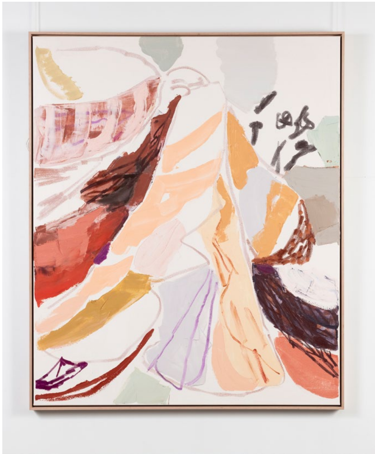
Sitting in Tjoritja, East Mac Ranges (Ochre Hill Medley III) , 2023 oil on canvas, 135 x 110cm, (138 x 113cm framed) $6,900 AUD