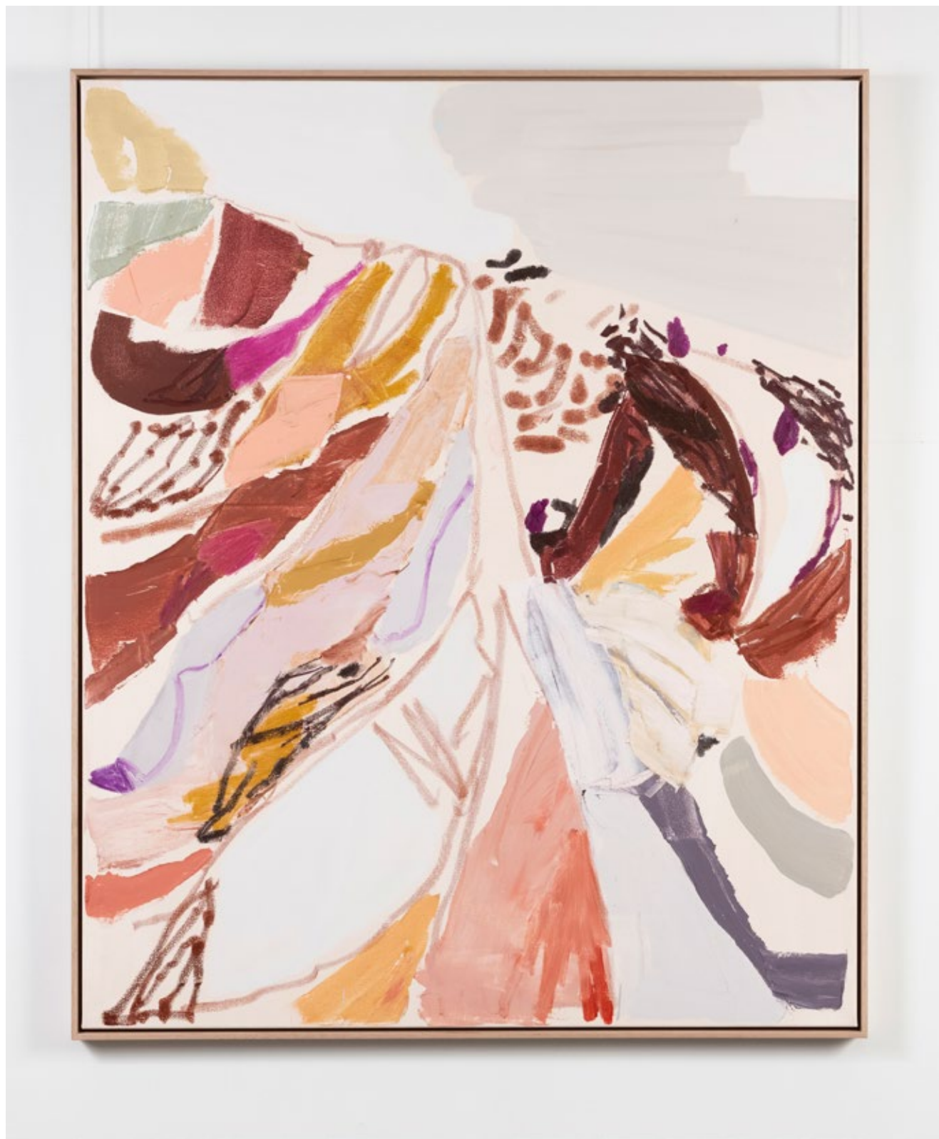
Sitting in Tjoritja, East Mac Ranges (Ochre Hill Medley I) , 2023 oil on canvas, 135 x 110cm, (138 x 113cm framed) $6,900 AUD