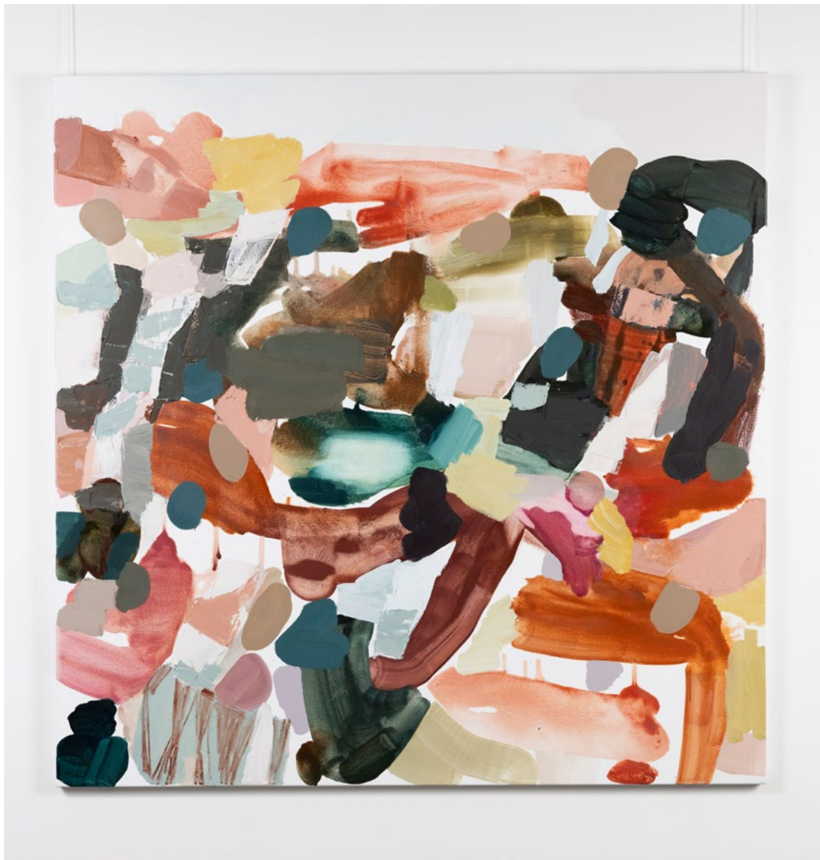
State of Flux, Symbiosis, 2023 oil and beeswax on canvas, 150 x 150cm, unframed $9,500 AUD