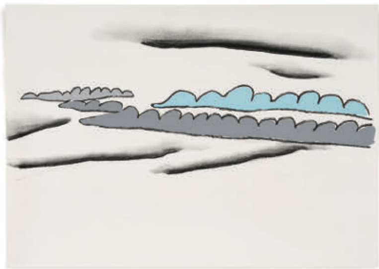
Untitled , 2018, acrylic, charcoal on paper, 30×42cm