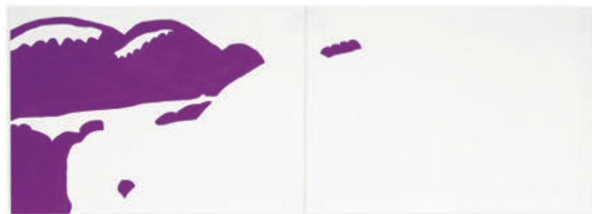
Purple Mountain_21/02/19 , 2019, acrylic on paper, 30×84cm