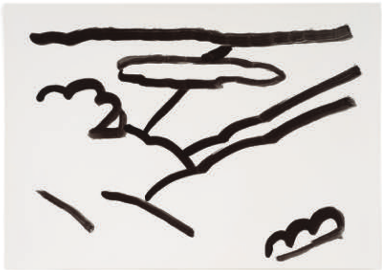
Mathon_View to the South , 2018, acrylic on paper, 30×42cm