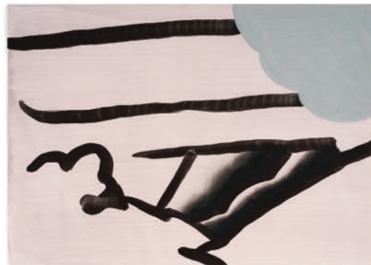
Untitled , 2018, acrylic, charcoal on paper, 30×42cm