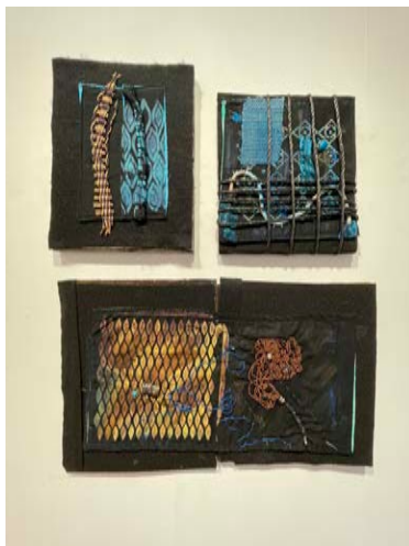
11. "Jeweled and Tied 1" (top left) found woven plastic, batik dyed fabric, hand stitched on felt, mounted on canvas board. 12" h x 9" w $525.00