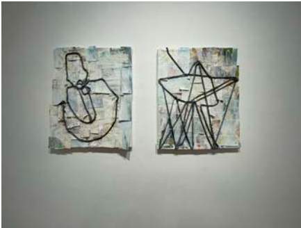
7. "Pirate Knot":recycled watercolor painting, cord, paint stapled on canvas board 20"h x16"w $650.00