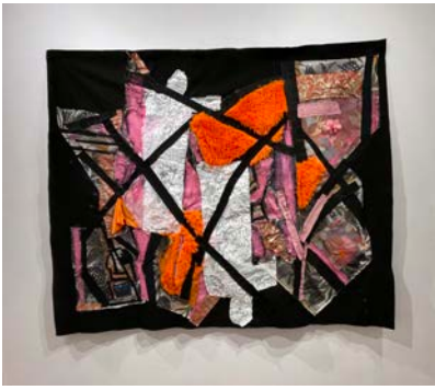
6. "Moon Bride": fake fur, upholstery fabric, rayon, lace, cotton, paint, machine, hand stitching, felt. 60" h x 72" w $2500.00