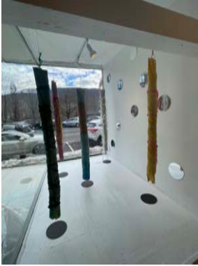
1. Window installation : "Mirrors, Lines, Knots" paint stained canvas, wire, rope, cardboard, mirrors (variable) 6 ft x 5 ft $2100.00