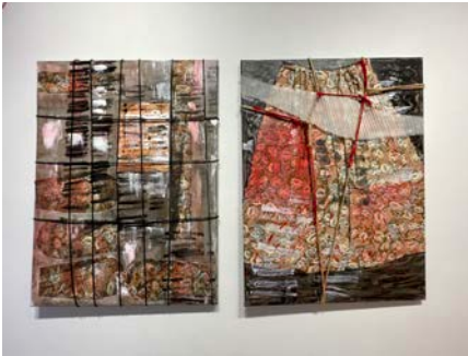
2. "Sleeves" : cotton print pattern cut outs, paint, rope, stitched thread, words of Cady Stanton on canvas board 40 " h x 30" w $1000.00