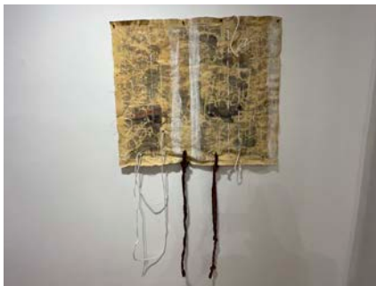
5. "Skin/beige" : unstretched canvas, paint, thread stitching, rope, cord, upholstery material. 30" h x 34" w $850.00