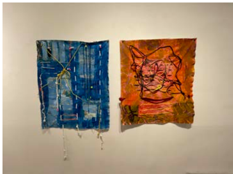
9."Skin/blue":unstretched canvas, paint, thread stitching, paper, tape, rope, plastic and cotton cord. 27" h x 29" w $850.00